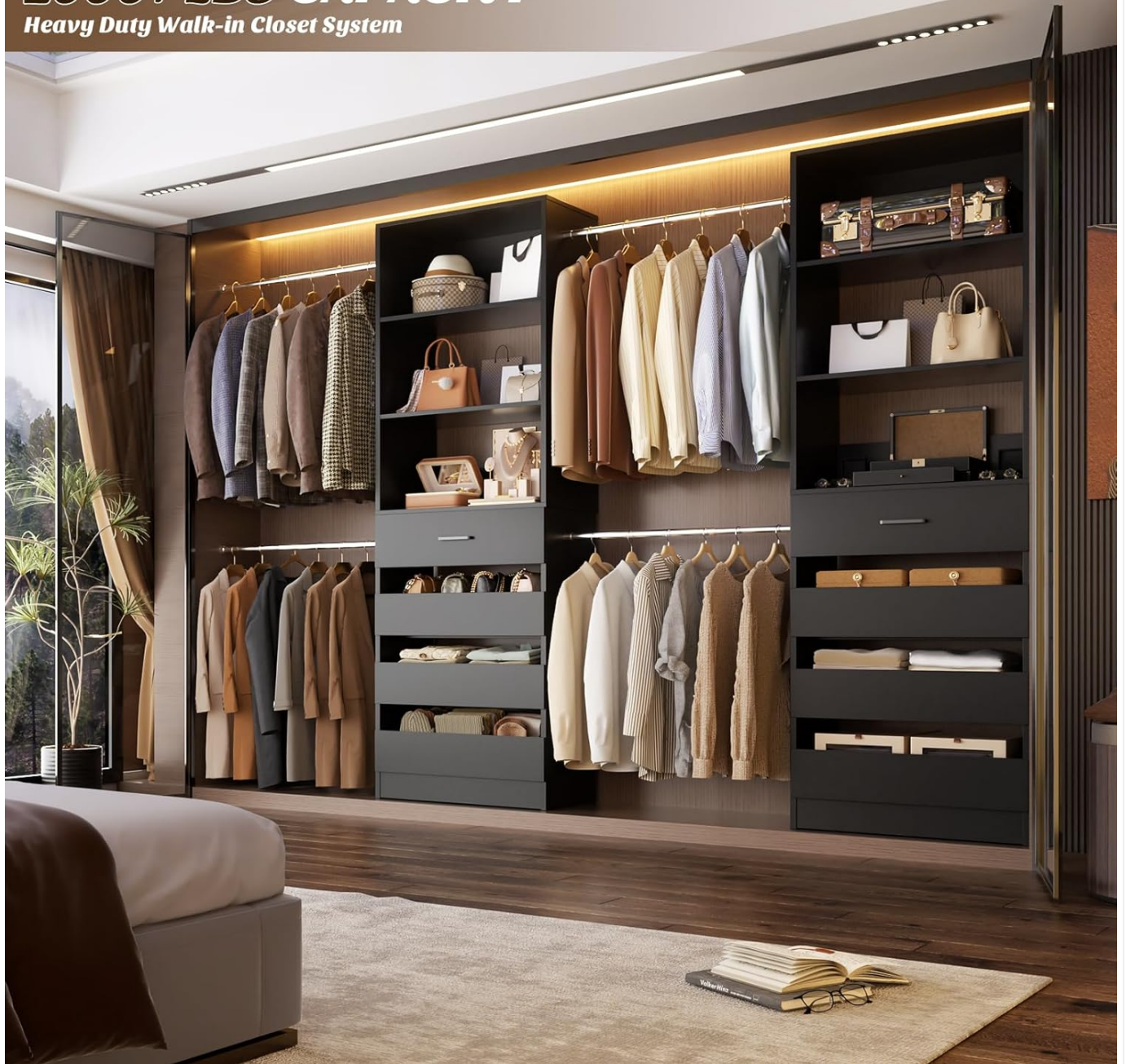
Figure 8.1: The Aheaplus Closet System demonstrating its heavy-duty capacity in a walk-in closet setting.