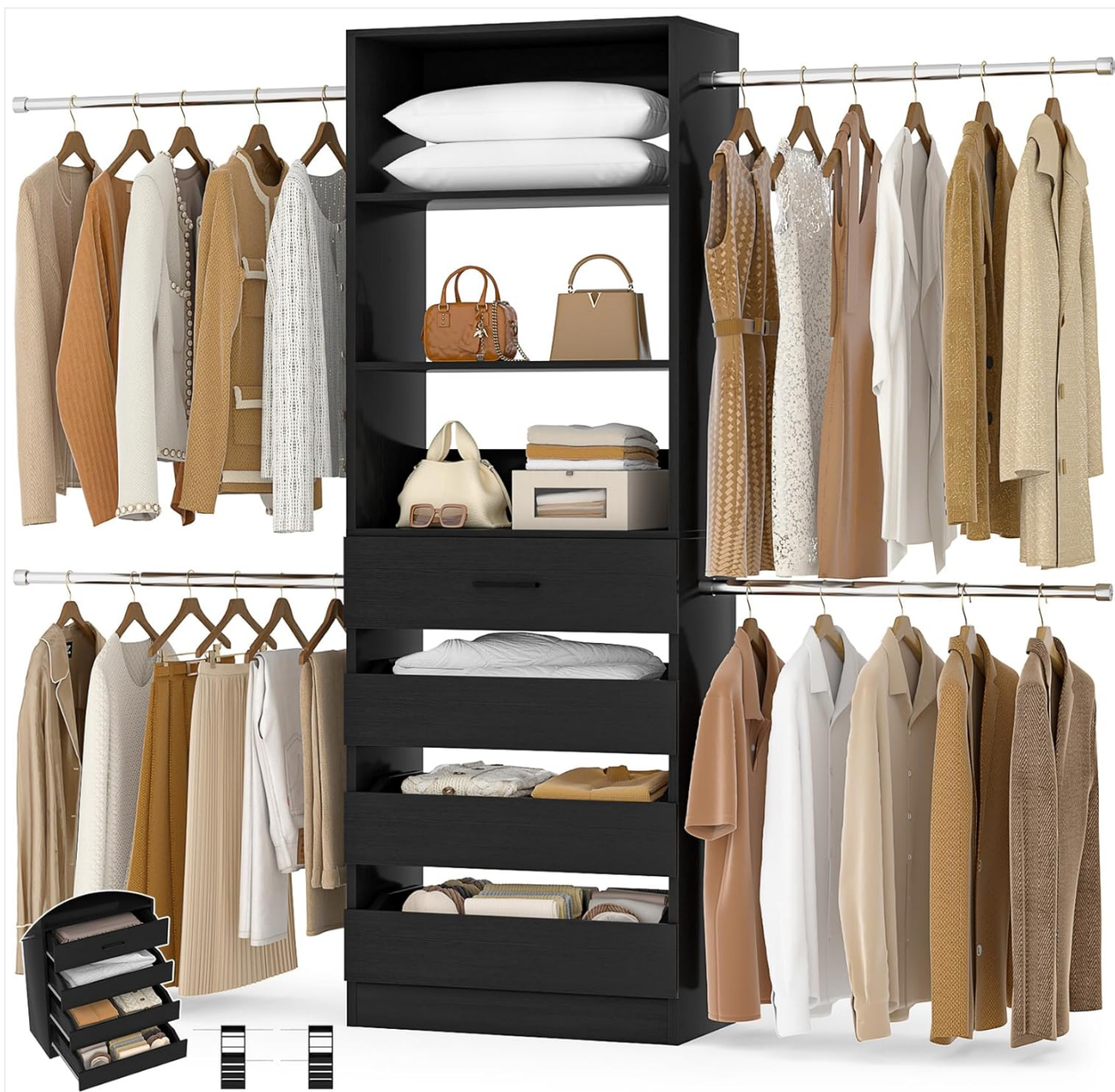
Figure 1.1: Overview of the Aheaplus Closet System, showcasing its central tower, drawers, and hanging rods.