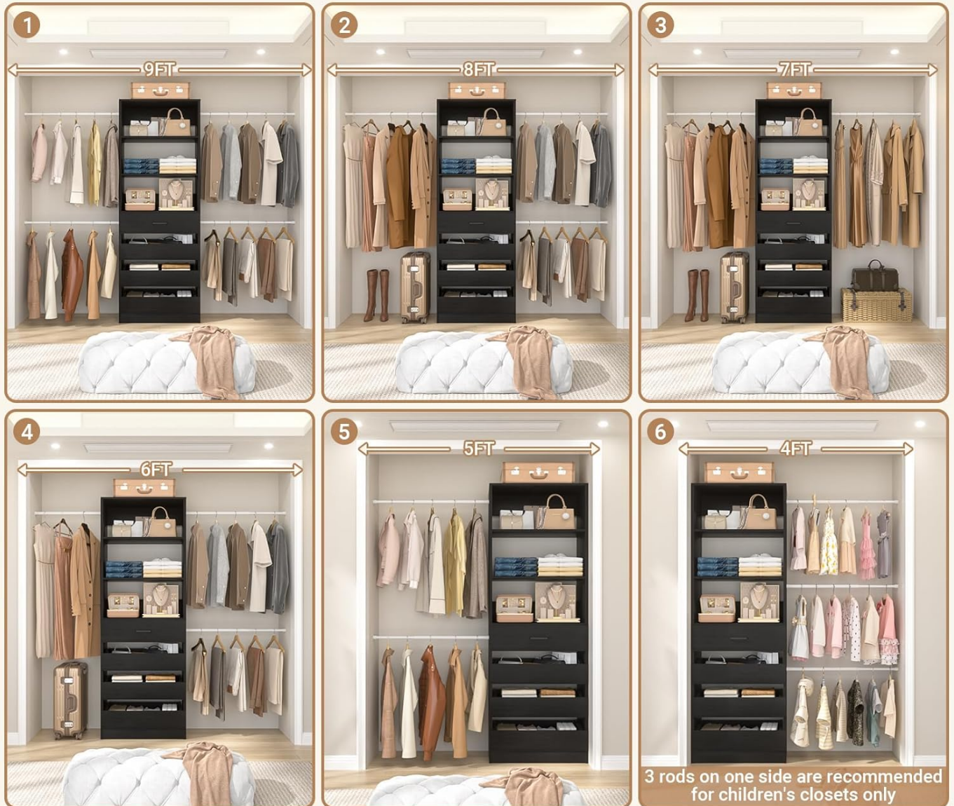
Figure 4.2: Examples of various installation configurations for different closet widths.

with rods installed on one side of the unit, left or right, the organizer can fit smaller spaces 4 ft. to 5 ft.