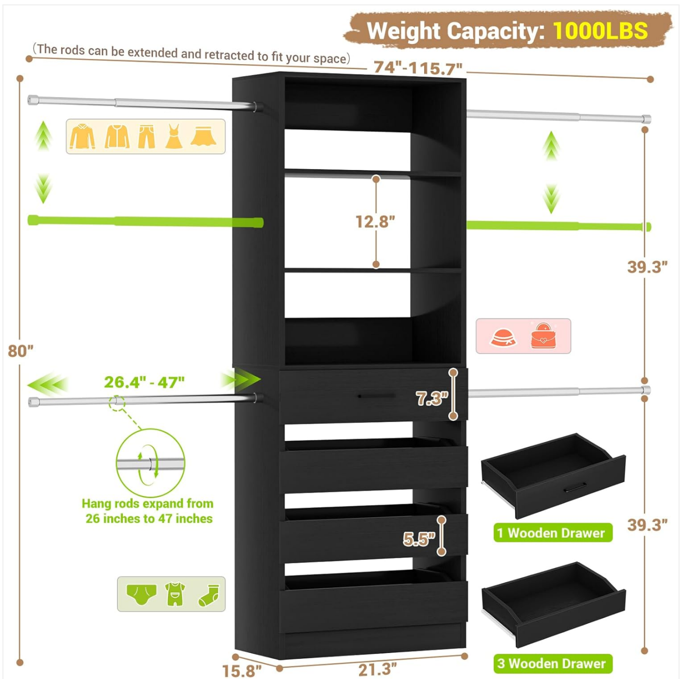
Figure 4.1: Dimensional diagram of the Aheaplus Closet System, including expandable rod lengths.