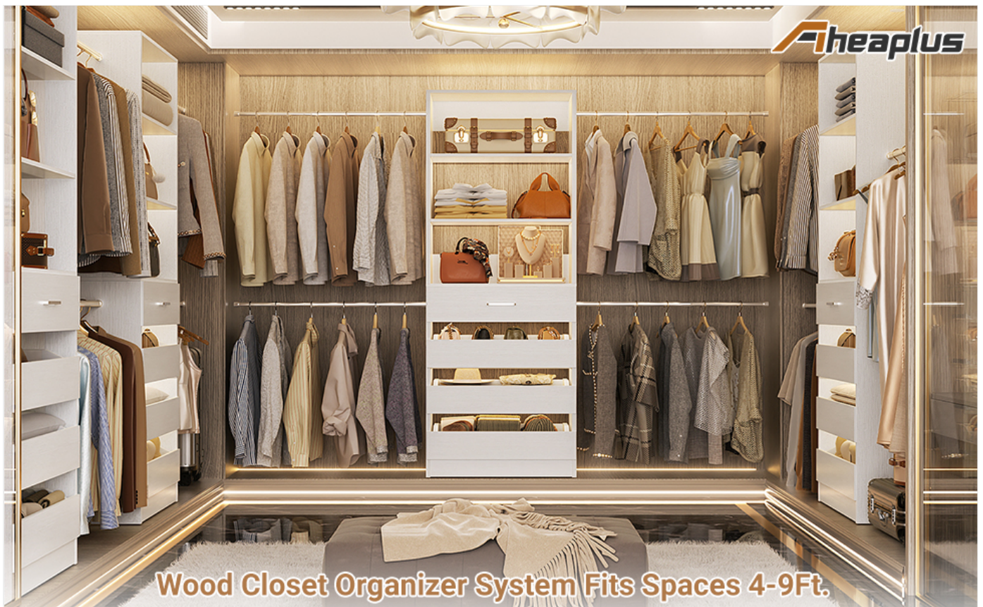
Figure 4: Example of a fully installed closet system.