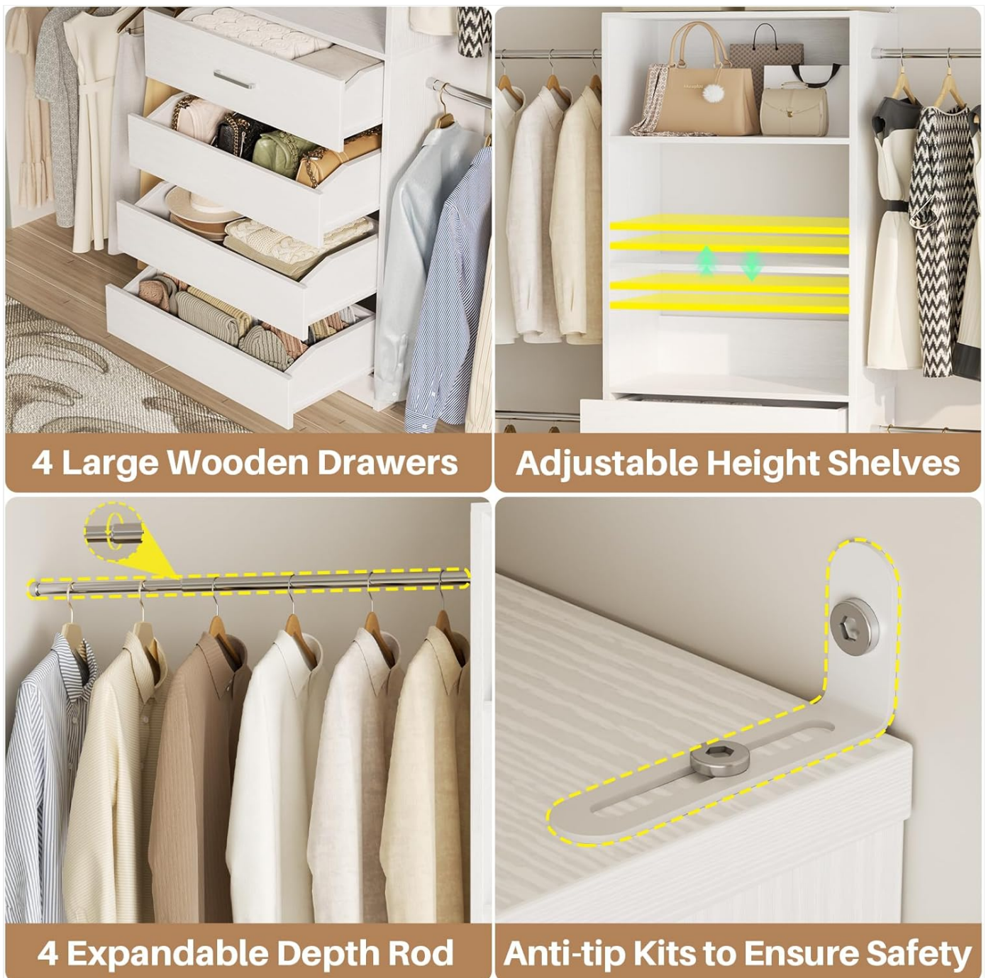
4 Large Wooden Drawers