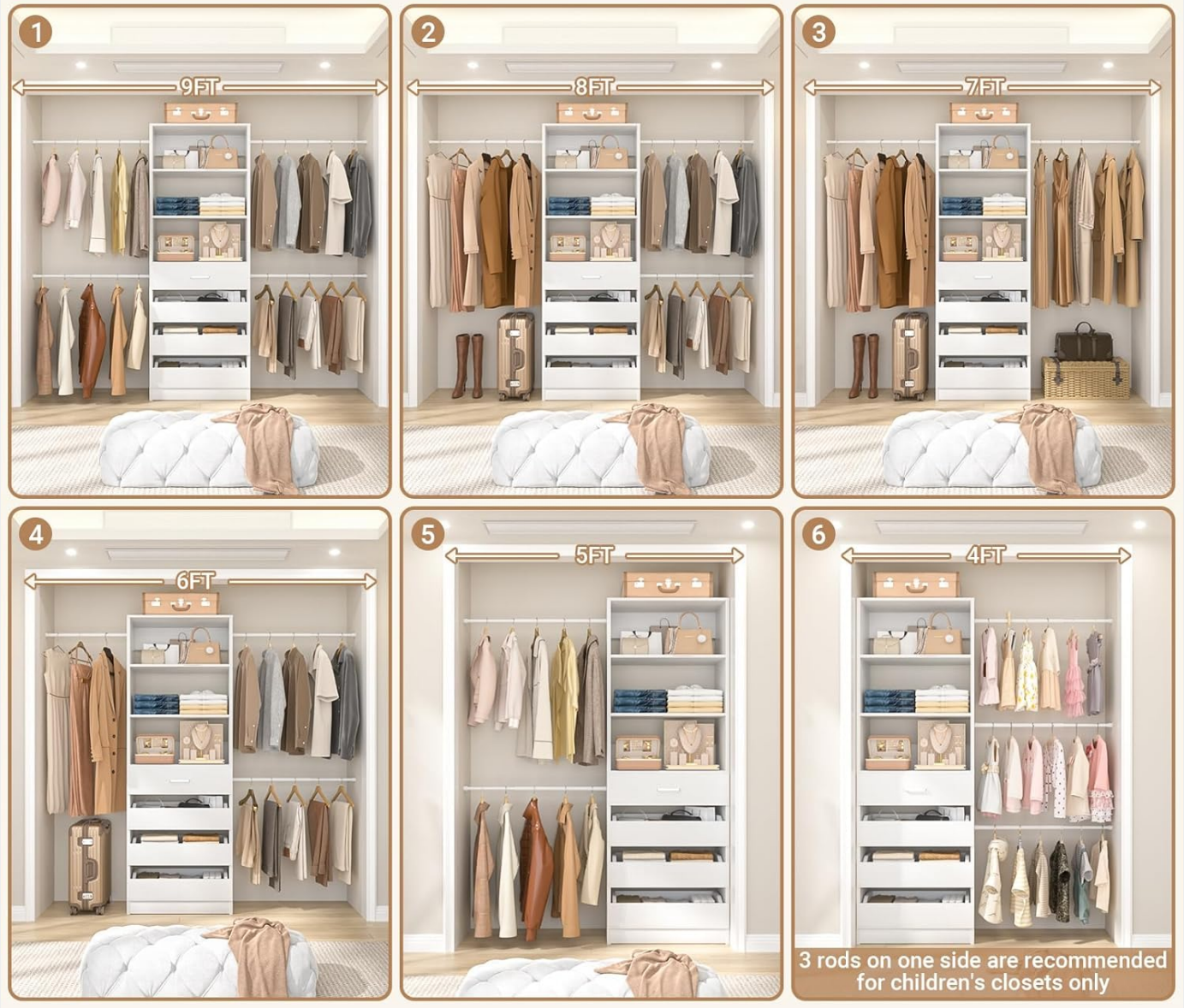
Figure 5: Various configurations for different closet sizes.

with rods installed on one side of the unit, left or right, the organizer can fit smaller spaces 4 ft. to 5 ft.