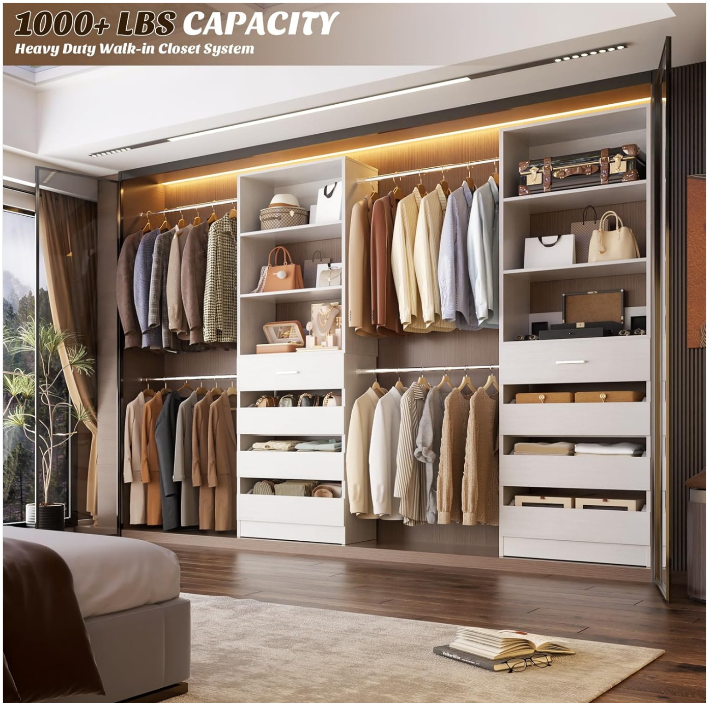
Figure 1: Fully assembled Aheaplus Closet System.