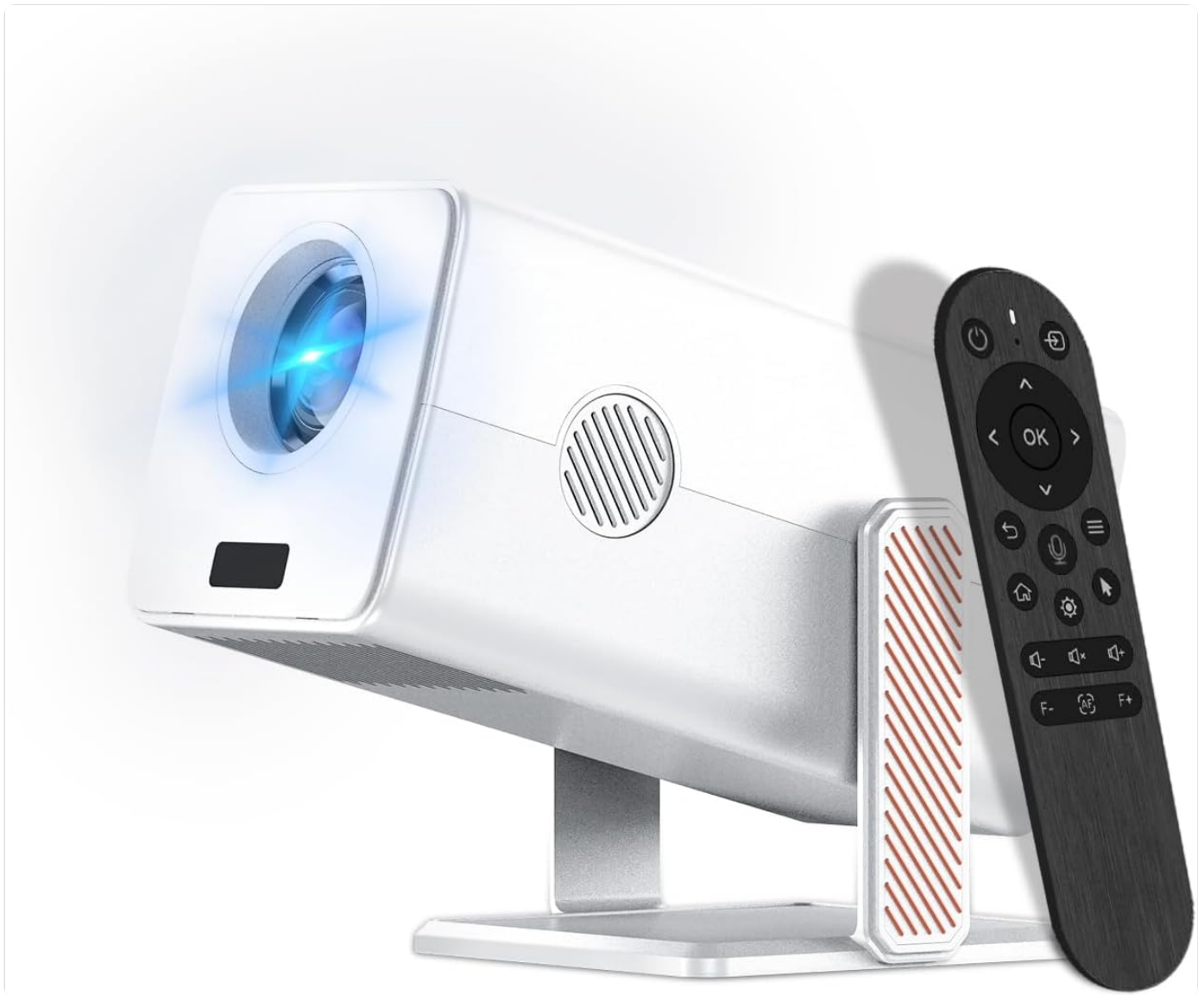
Figure 1: XNANO HM103A Video Projector and Remote Control.