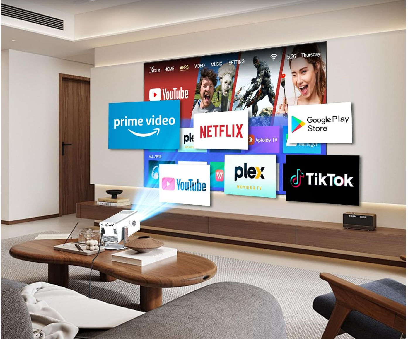
Figure 5: Dual-band WiFi 6 and Bluetooth 5.2 connectivity.