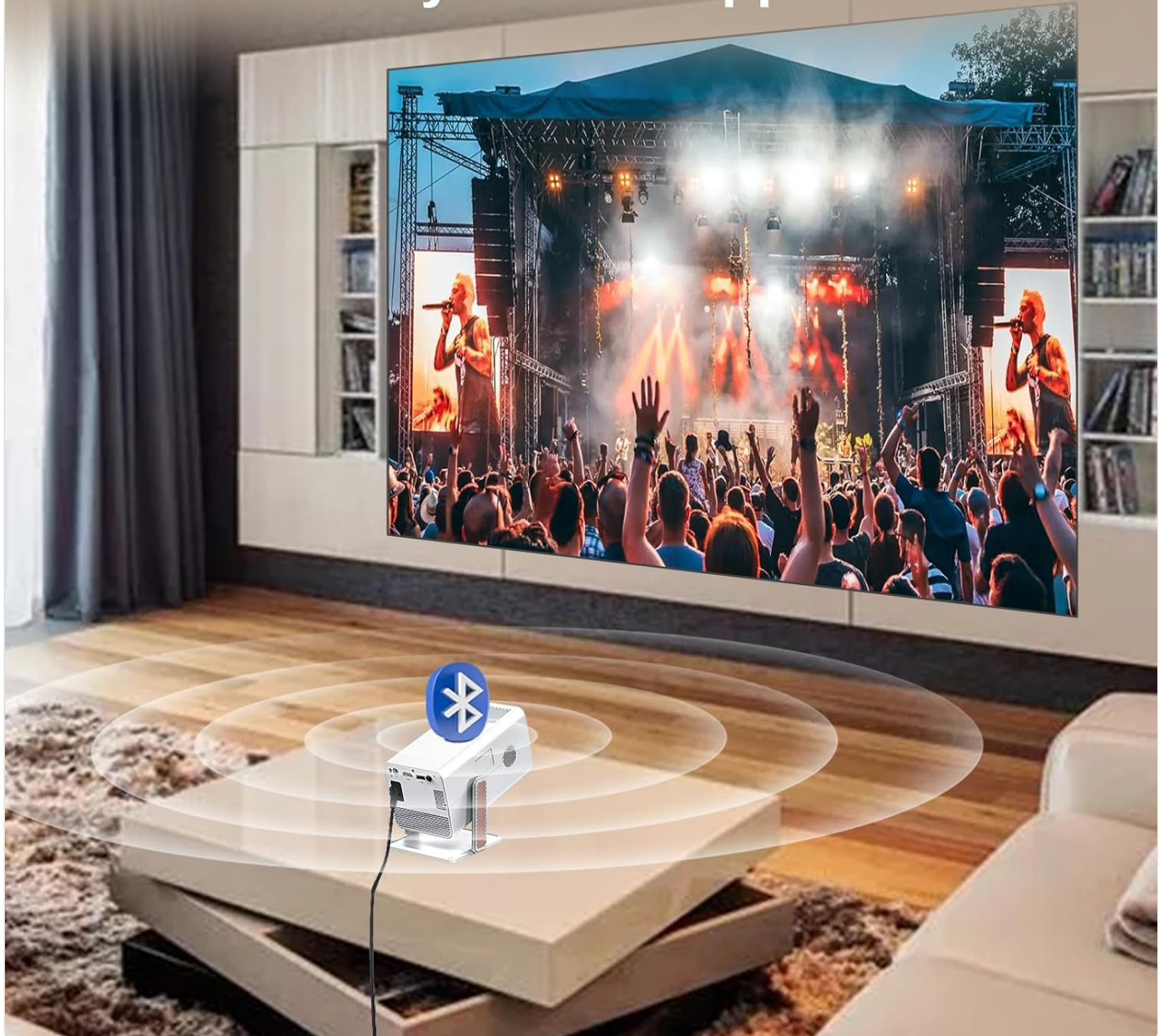
Figure 6: Connecting to external audio devices via Bluetooth for Dolby Audio.