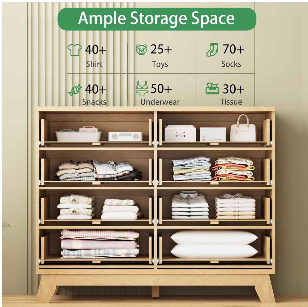
Image 4.1: Visual representation of the dresser's ample storage capacity, showing various items neatly organized within the drawers.