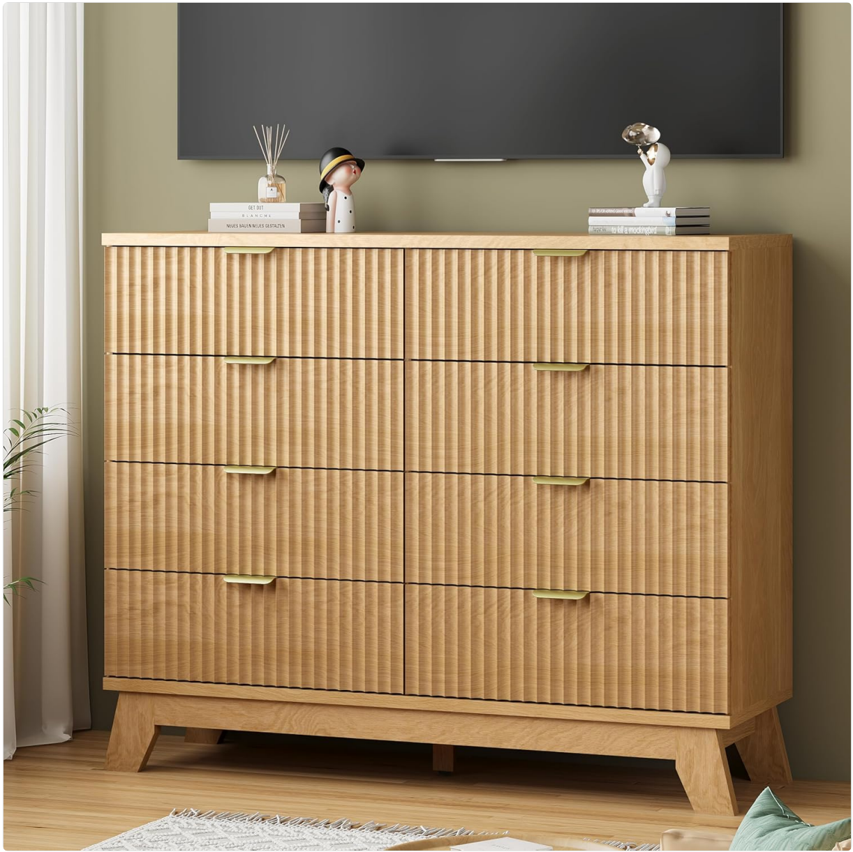
Image 7.1: Detailed view of the dresser's construction, including adjustable feet, stable base, metal handles, and fluted panel design.