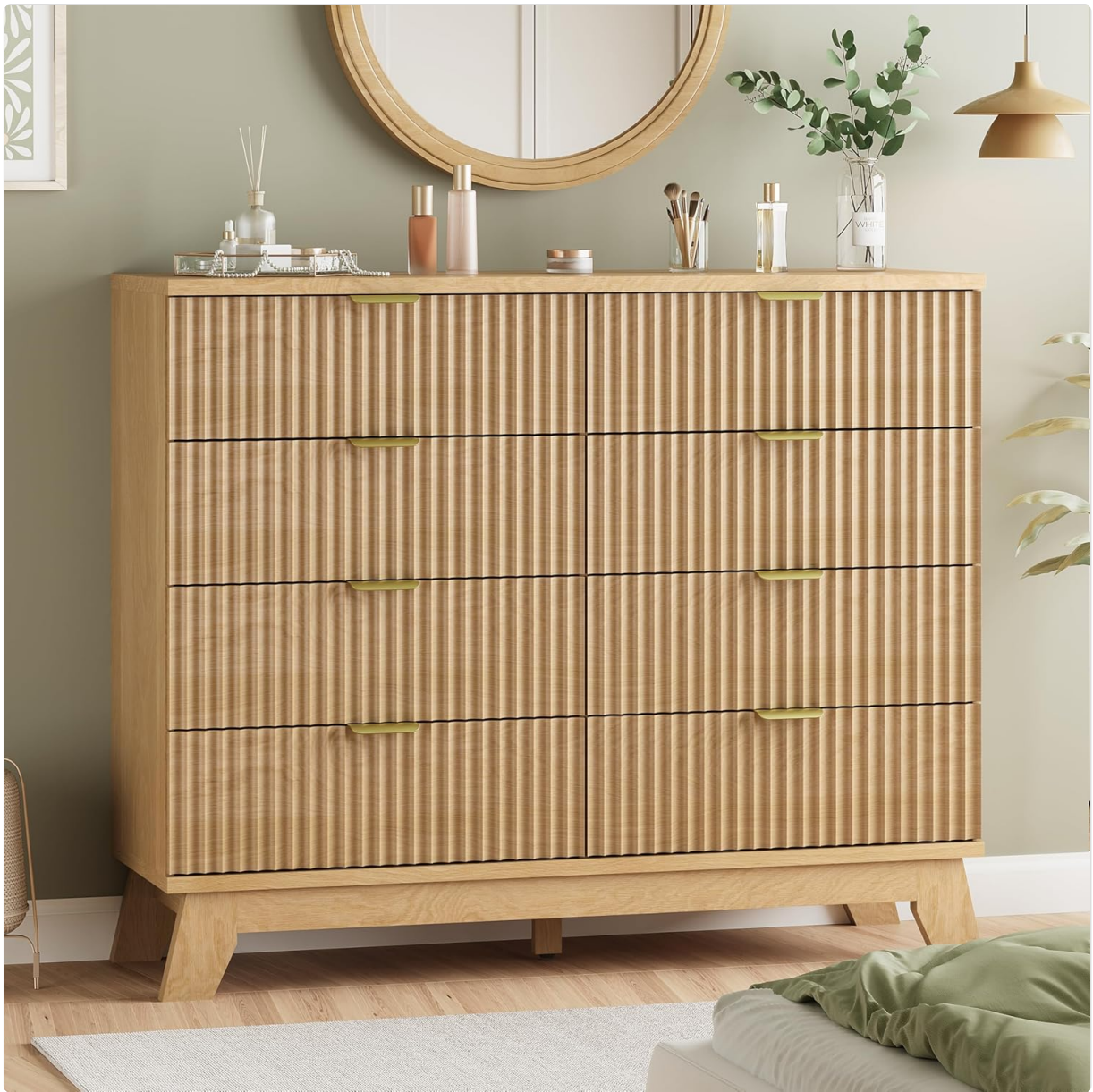
Image 1.1: The Xixini Fluted 8-Drawer Dresser in Natural Oak, showcasing its modern design and fluted panels.