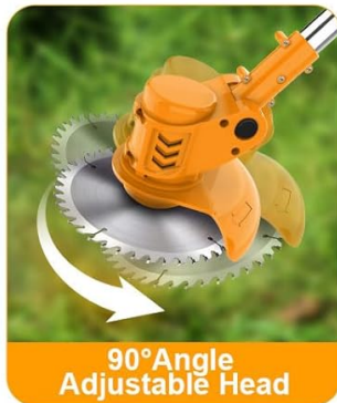
90° Angle Adjustable Head