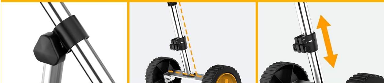
2 Stable Buckles