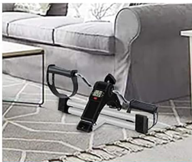
Beside the sofa