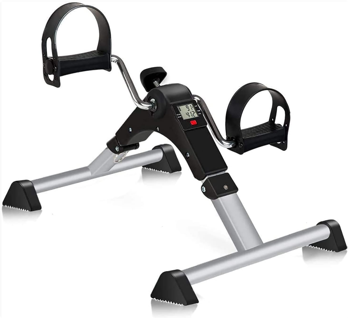
Figure 1: The UMJIGF Portable Mini Exercise Machine. This image shows the compact design of the pedal exerciser with its digital display and pedals.