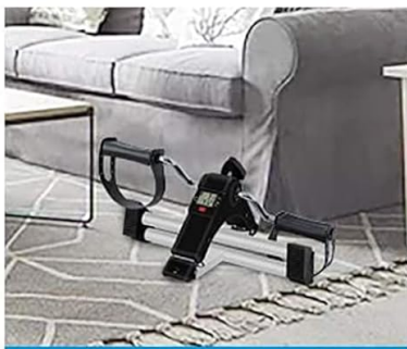
Beside the sofa