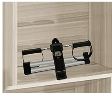
In the locker