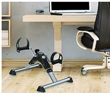
Under the table