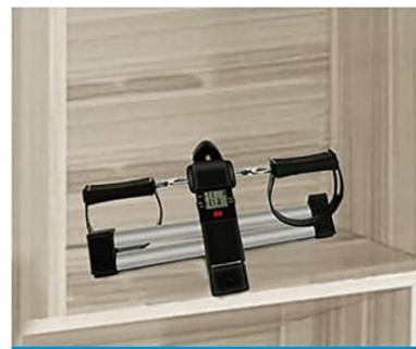
In the locker