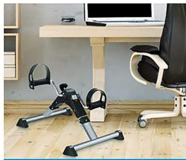
Under the table