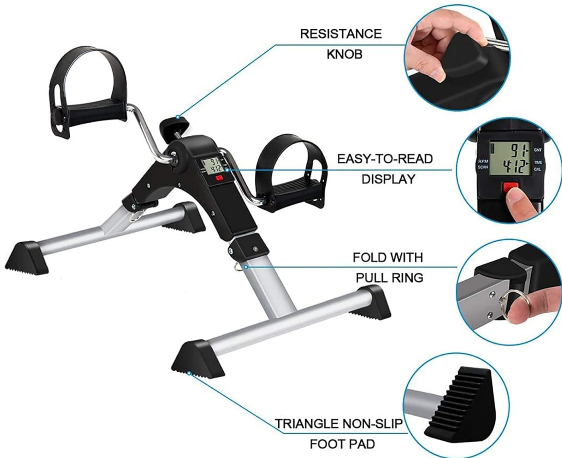
Figure 3: Key product parts. This image highlights the resistance knob, easy-to-read display, fold with pull ring, and triangle non-slip foot pad.