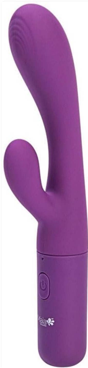
Image: The Maia Toys Rayla Dual Stimulator, highlighting the power button and charging port at the base.