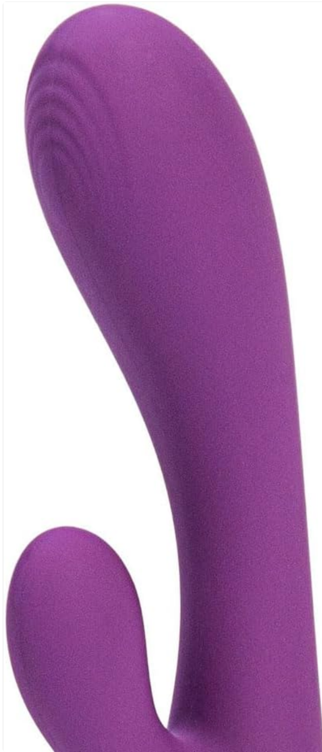
Image: A close-up view of the flexible stimulator end of the Maia Toys Rayla.