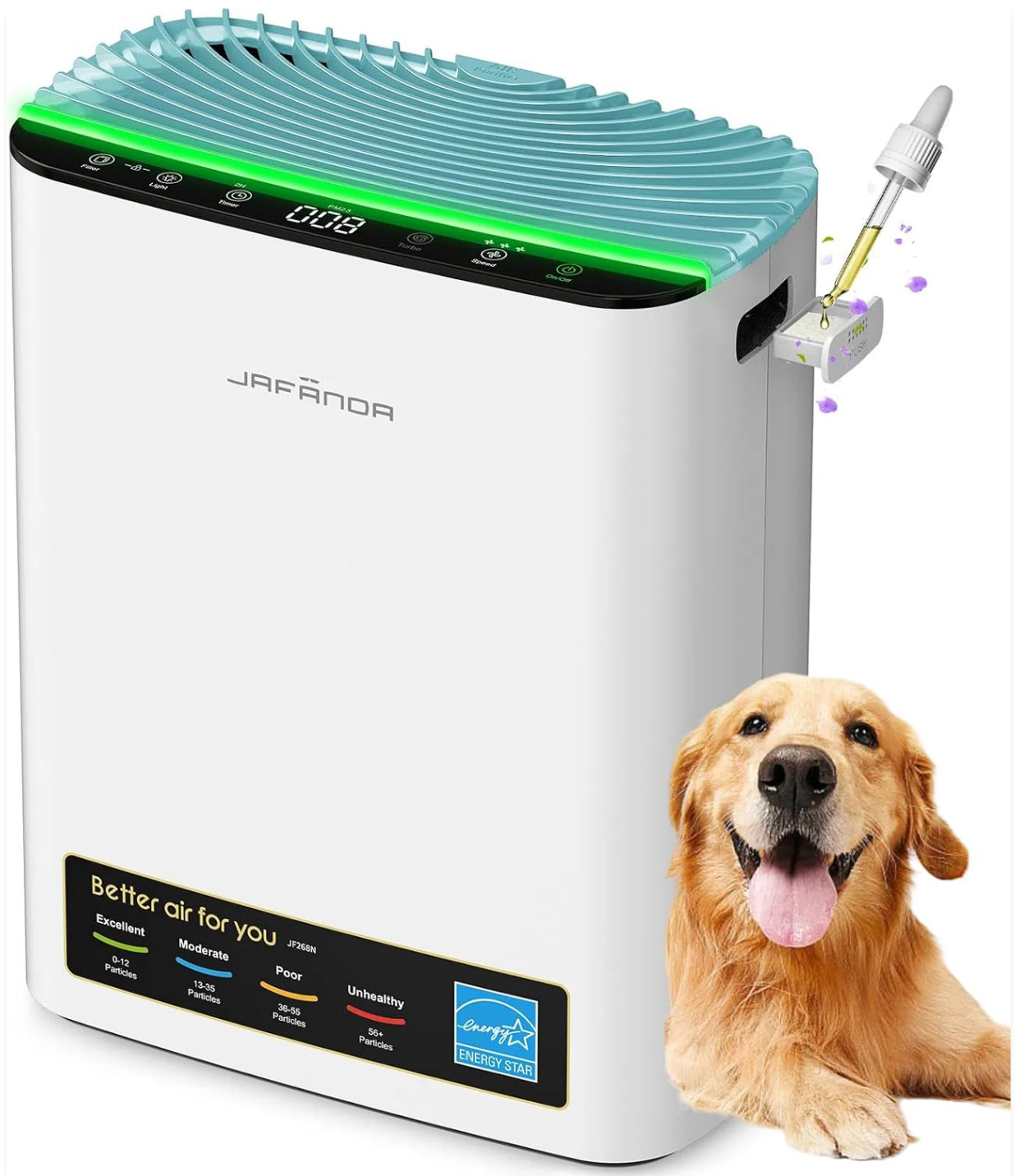
The Jafānda JF268N Air Purifier, designed for effective air purification and aromatherapy.