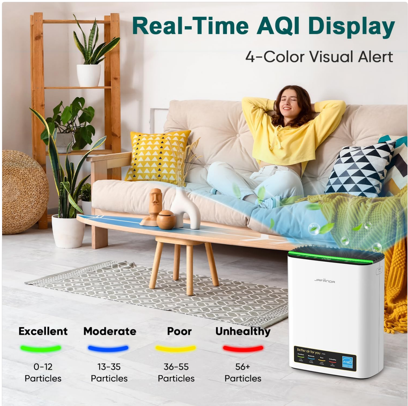
Figure 5.2: The PM2.5 display and color-coded light provide instant feedback on air quality.