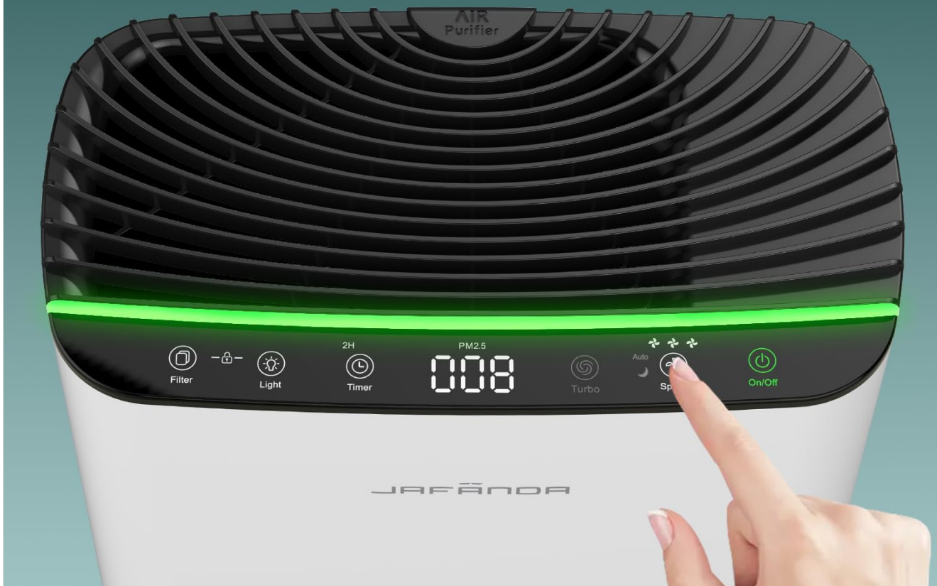
Figure 5.1: The smart touch control panel allows easy access to all functions, including fan speed, timer, and mode selection.