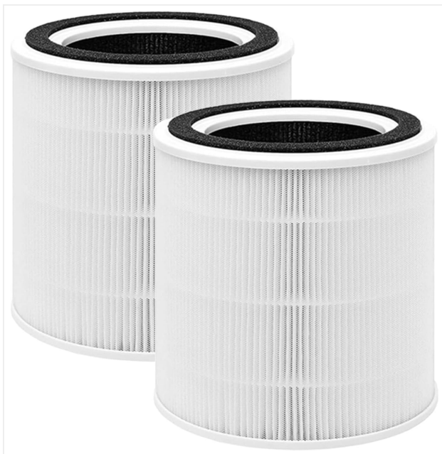
Image: Two BLUTENET TT-AP005 replacement filters, showing their cylindrical shape and white pleated filter material

The BLUTENET TT-AP005 Replacement Filter is a 3-in-1 filtration system comprising a Pre-Filter, H13 True HEPA Filter, and High-Efficiency Activated Carbon Filter.