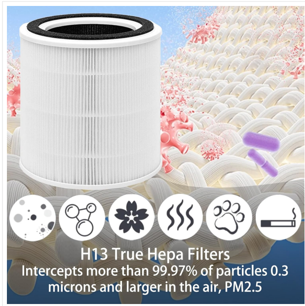
Image: Close-up of the H13 True HEPA filter, illustrating its ability to intercept particles like dust, pollen, pet dander, and smoke. This filter is designed to capture more than 99.97% of particles 0.3 microns and larger, including PM2.5.