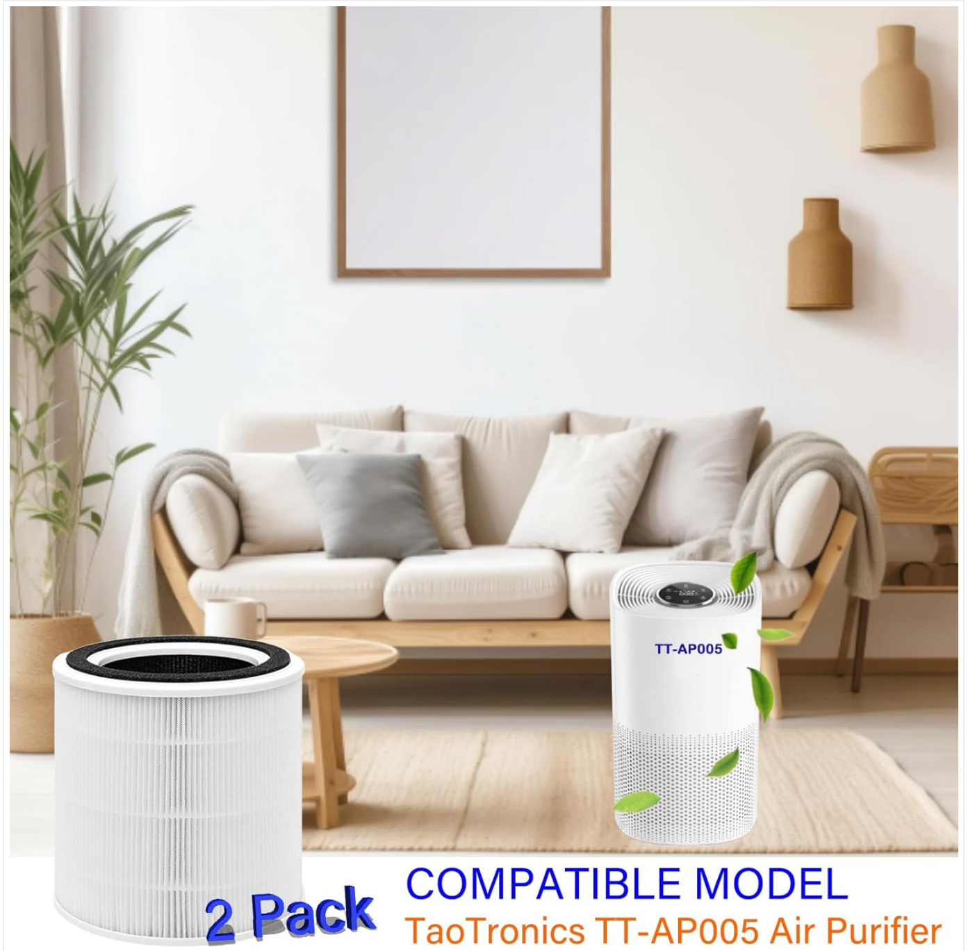
Image: An air purifier with a TT-AP005 filter placed next to it, indicating compatibility with TaoTronics TT-AP005 Air Purifier models.