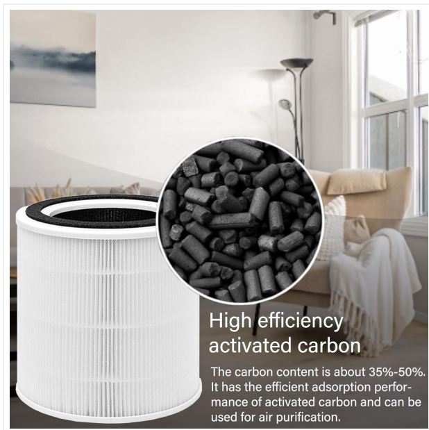
Image: A visual representation of the High-Efficiency Activated Carbon filter, with an inset showing activated carbon pellets. This filter is effective in adsorbing odors and harmful gases.

Image: Close-up of the H13 True HEPA filter, illustrating its ability to intercept particles like dust, pollen, pet dander, and smoke. This filter is designed to capture more than 99.97% of particles 0.3 microns and larger, including PM2.5.