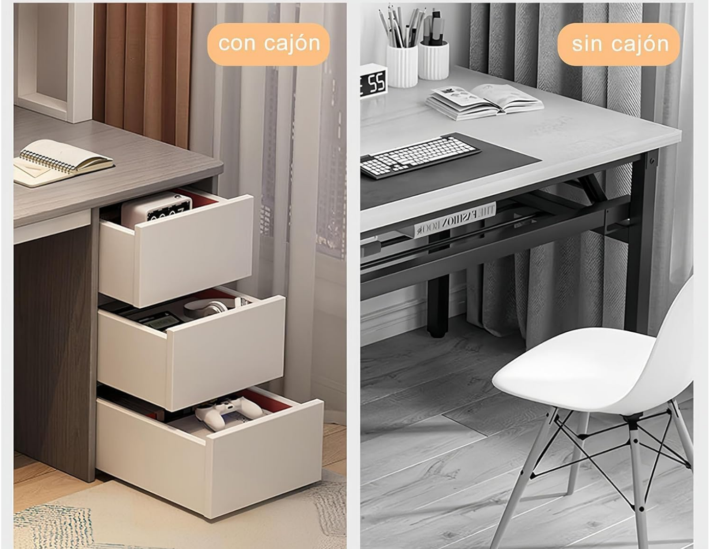
Image 4: Comparison showing the desk with three drawers on the left and a desk without drawers on the right, emphasizing the storage capacity provided by the drawers.