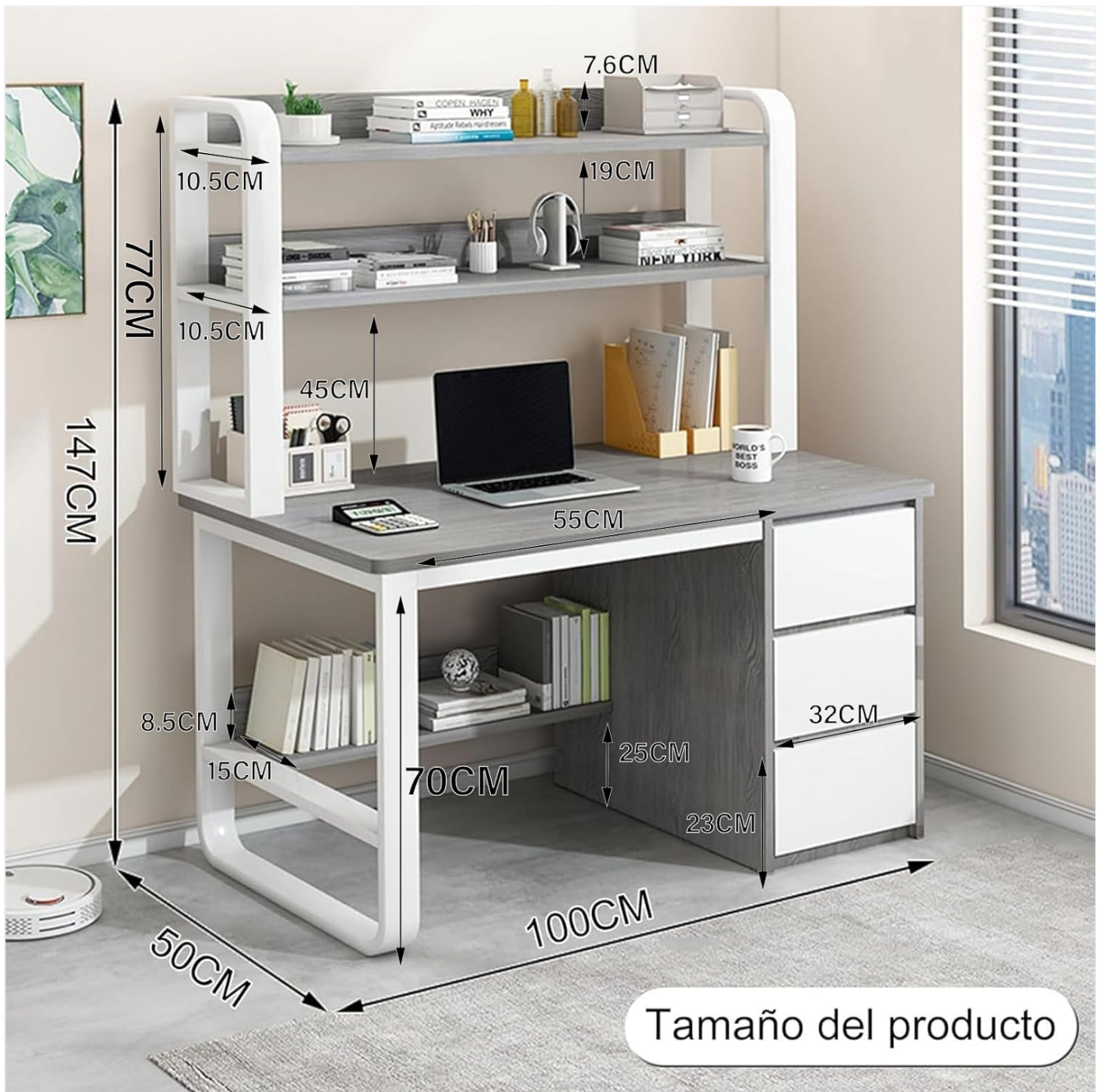
Image 6: Dimensional drawing of the desk, showing measurements in centimeters for width, depth, and height, as well as individual shelf and drawer dimensions.