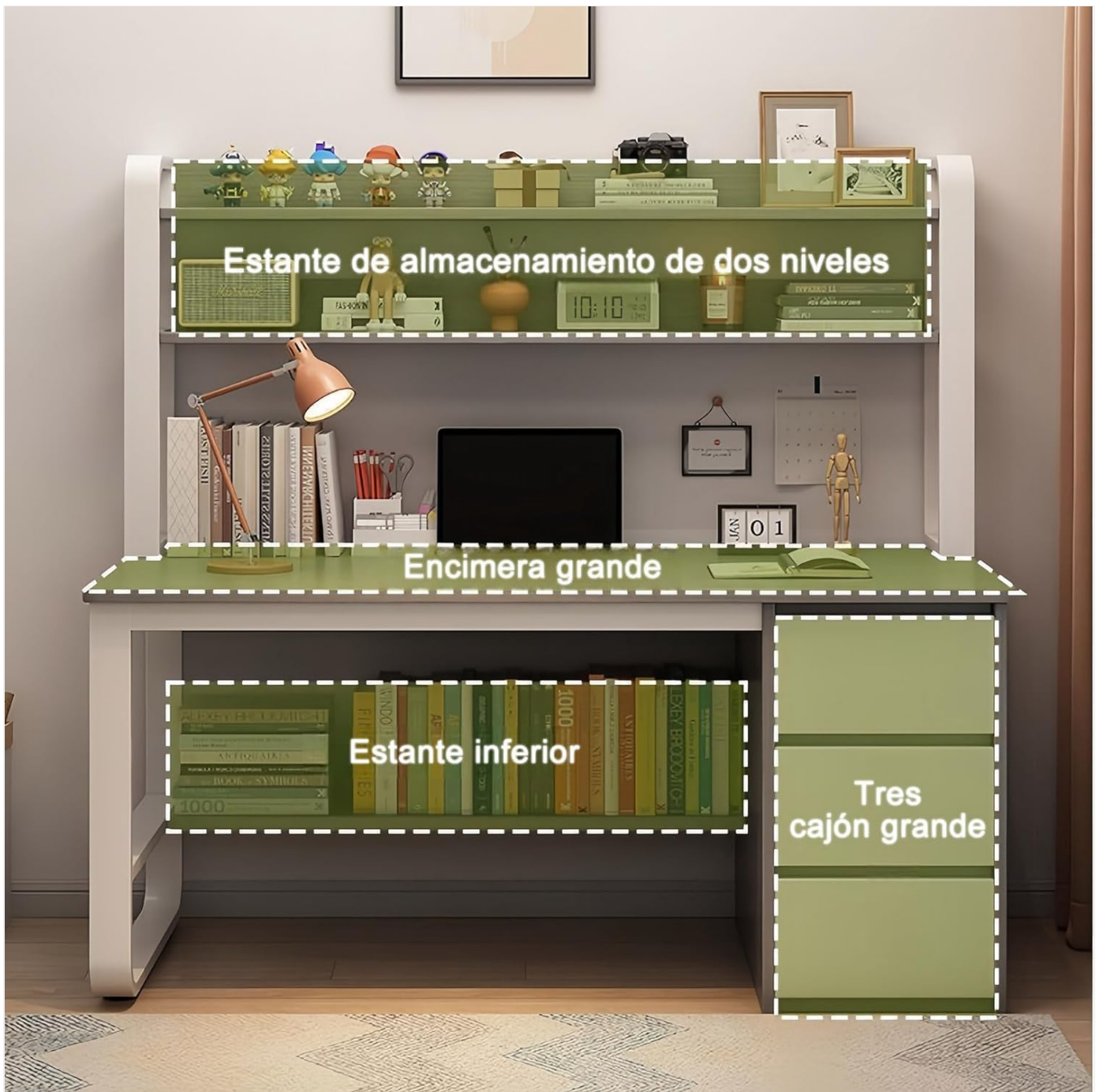
Image 3: Desk sections including the large countertop, two-level storage shelf, bottom shelf, and three large drawers.