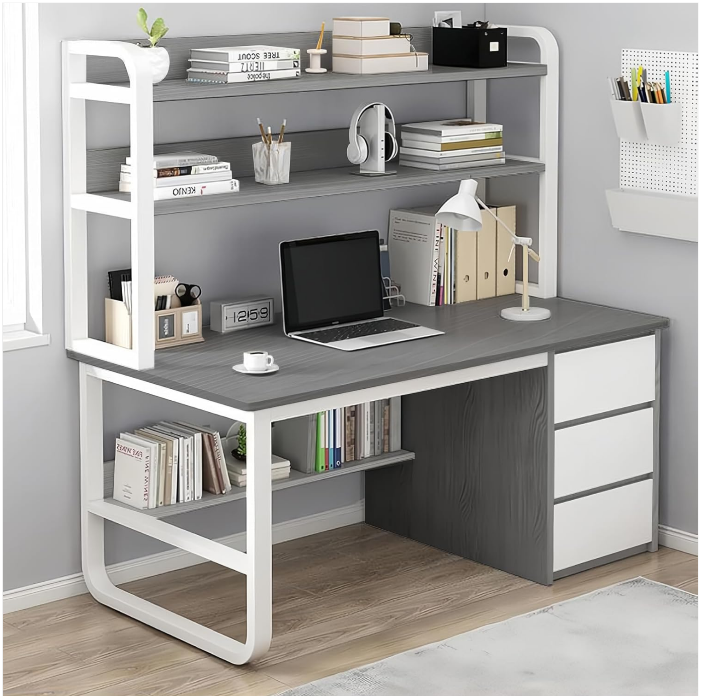
Image 2: Key components of the desk. This diagram highlights the stable frame, thick tubes, fixed steel elements, shelves, spacious desktop, rounded edges, and three large drawers.