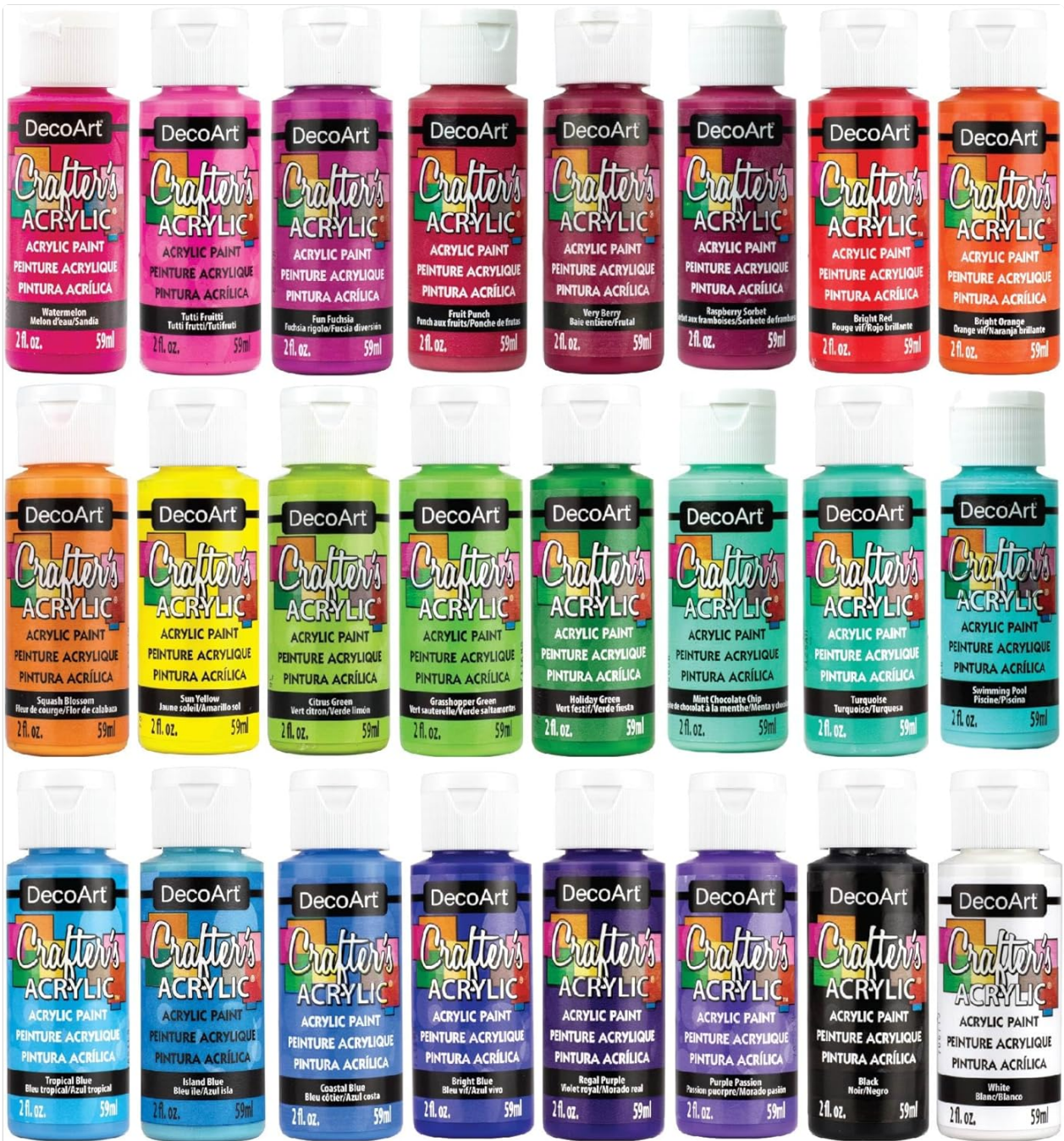
Image: The complete set of 24 DecoArt Crafter's Acrylic paints, showcasing the variety of colors available.