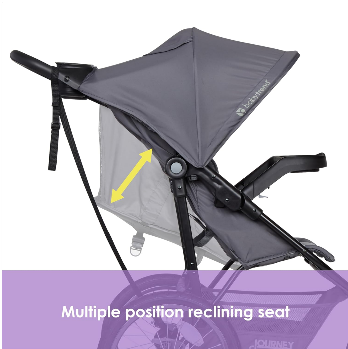
Image: Stroller seat shown in a reclined position, indicating adjustability.