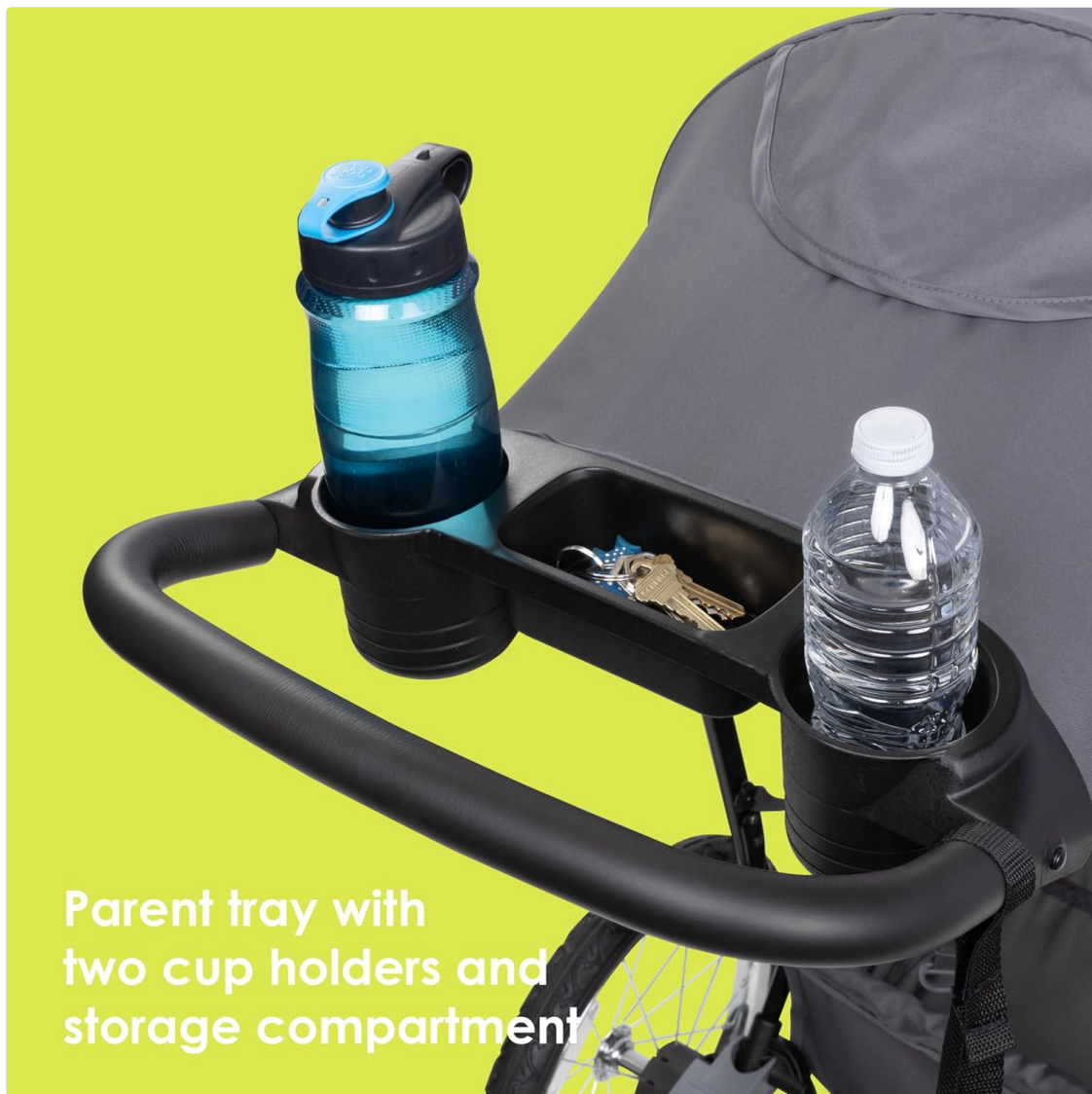
Image: Close-up of the parent tray with cup holders and a storage compartment.