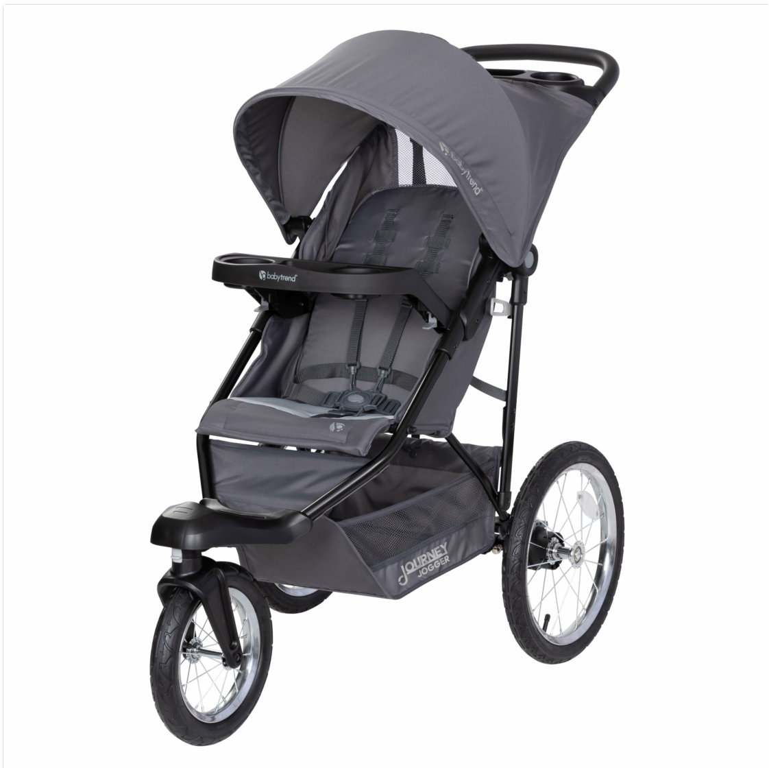
Image: Fully assembled Baby Trend Journey Jogging Stroller in Stellar Grey.