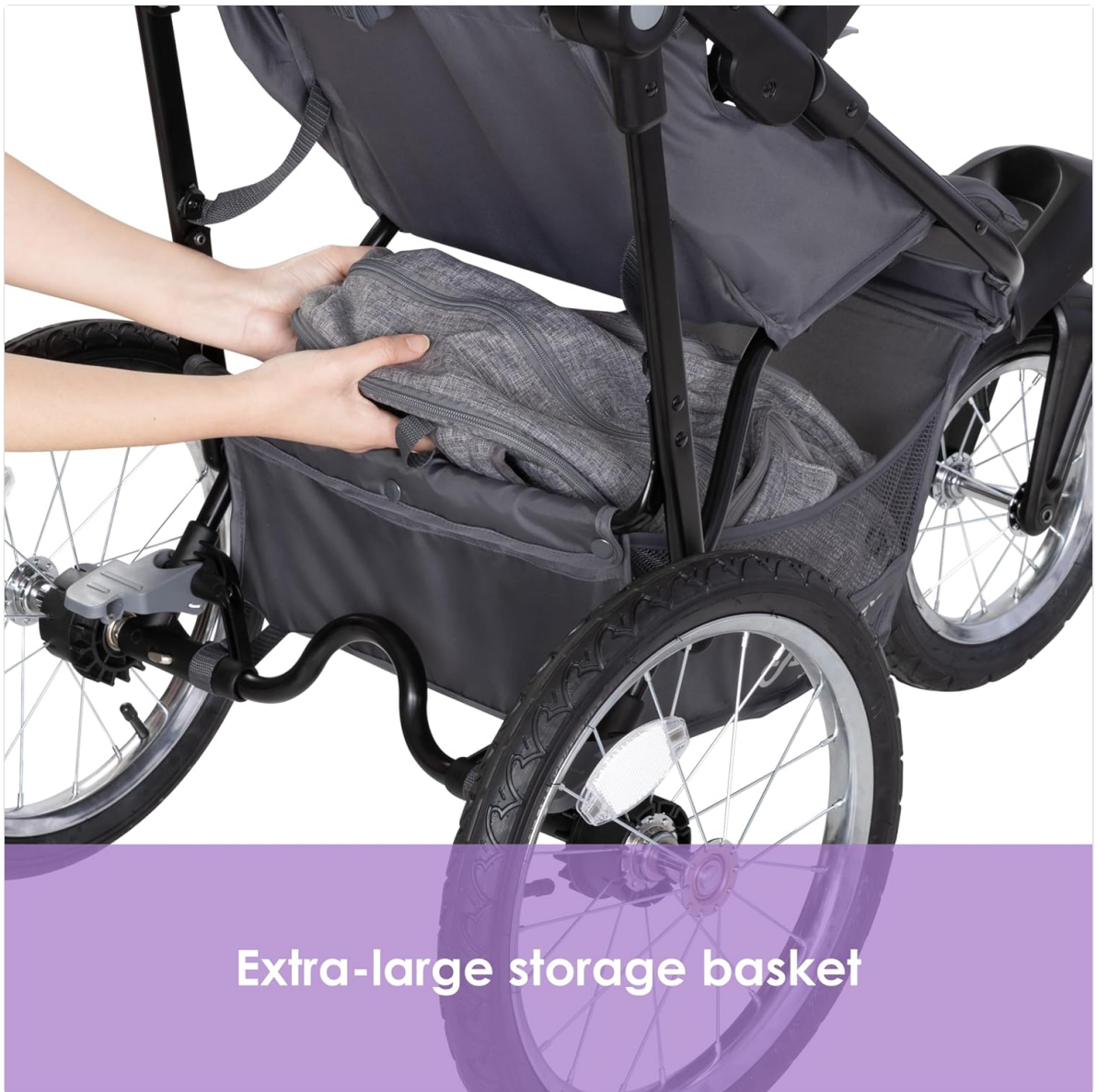
Image: A hand placing items into the extra-large storage basket of the stroller.