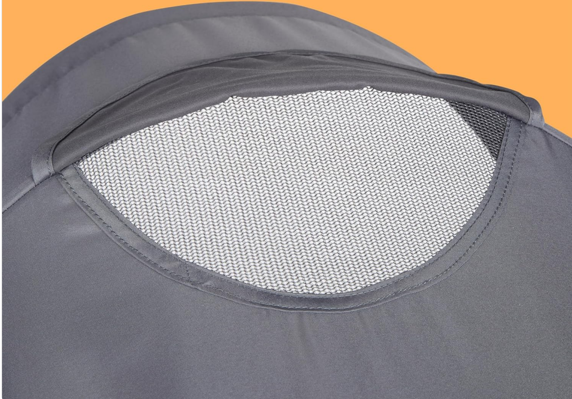
Image: View of the peek-a-boo window on the stroller's canopy.