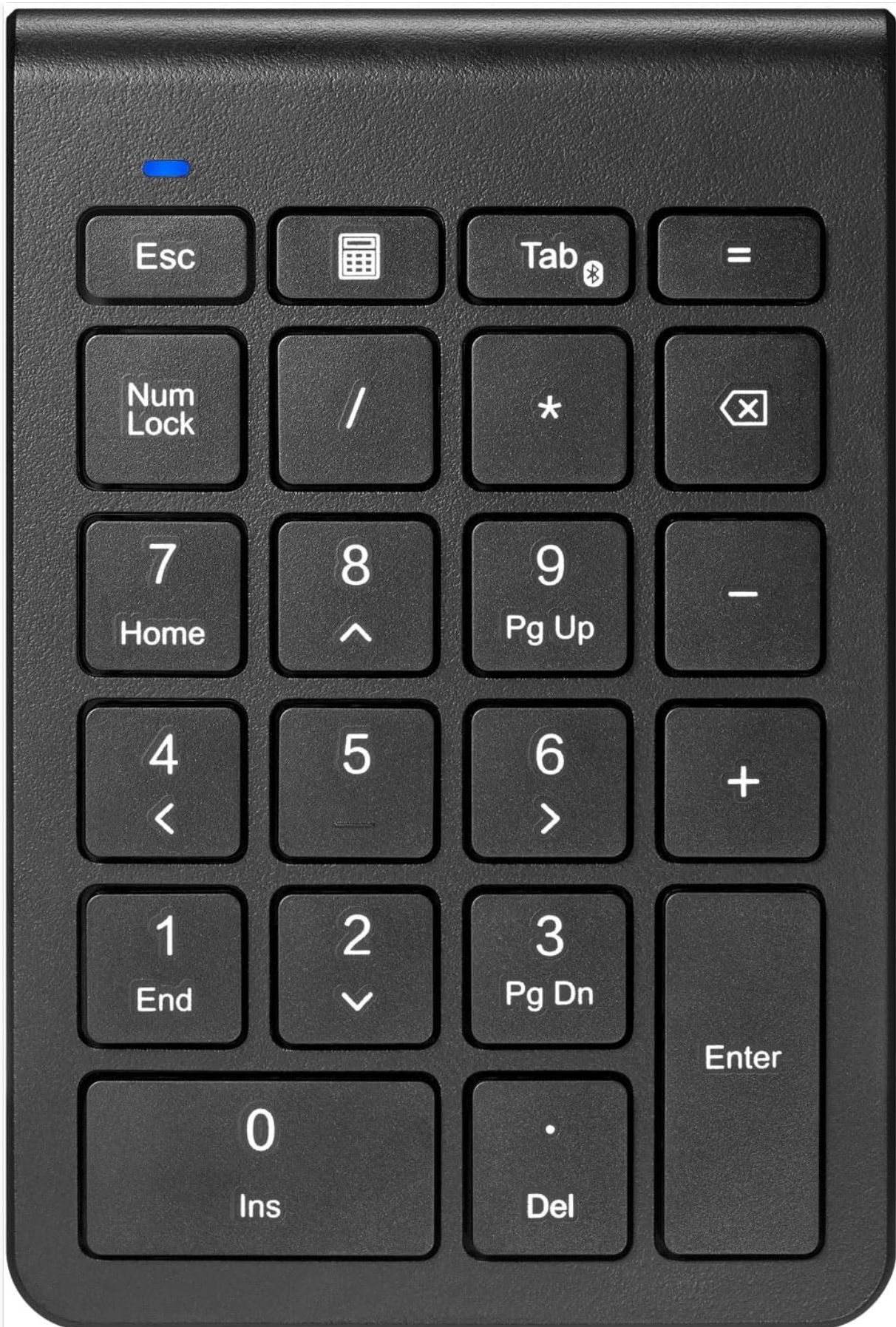
Image: A close-up view of the number pad's keys, including the Bluetooth indicator light.