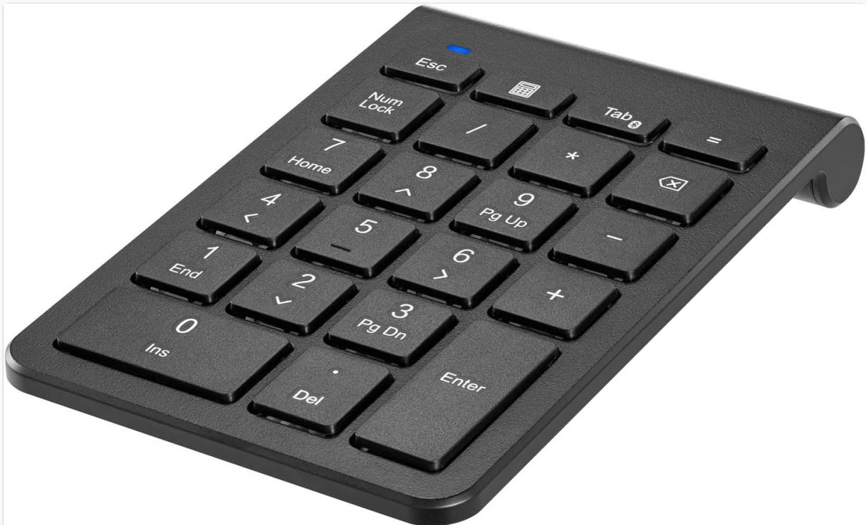
Image: An angled view of the number pad, highlighting the layout and key labels.