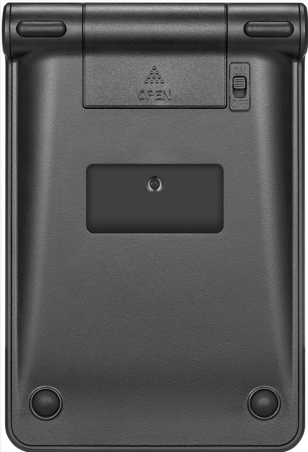
Image: The underside of the number pad, clearly showing the battery compartment and the ON/OFF switch.