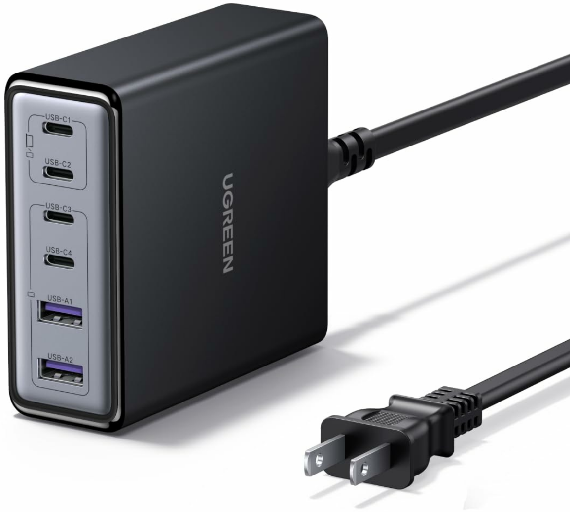
Image 1.1: UGREEN 100W GaN Desktop Charger, showcasing its compact design and multiple charging ports.