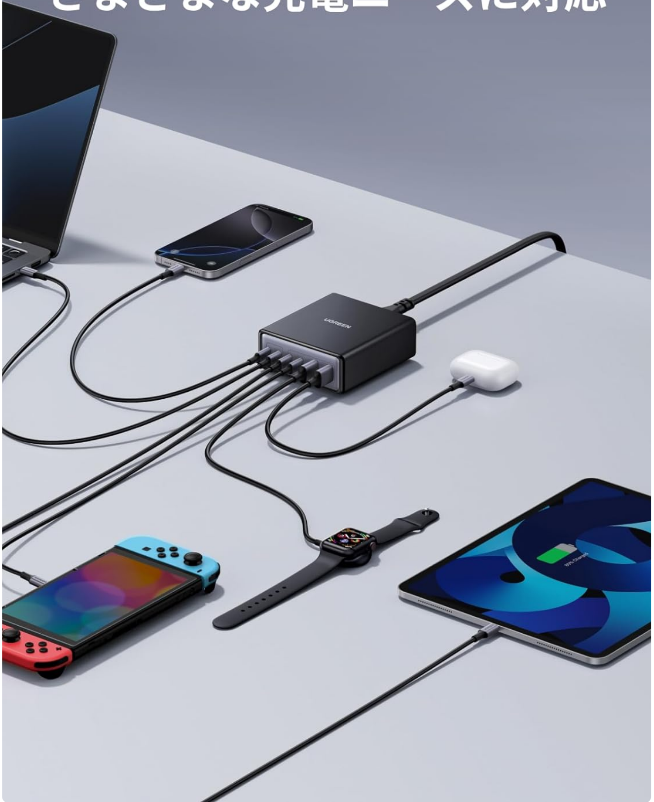
Image 3.1: The charger in use, demonstrating its ability to charge various devices simultaneously, such as a laptop, smartphone, smartwatch, and Nintendo Switch.