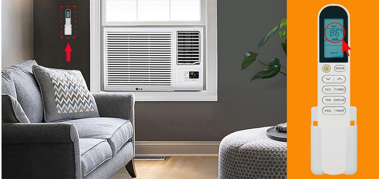
Image: Example of remote control wall mounting near an air conditioning unit.