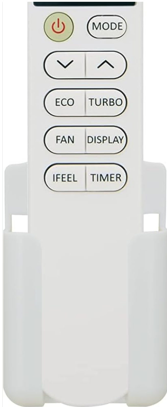
Image: The replacement remote control, displaying temperature and mode settings.