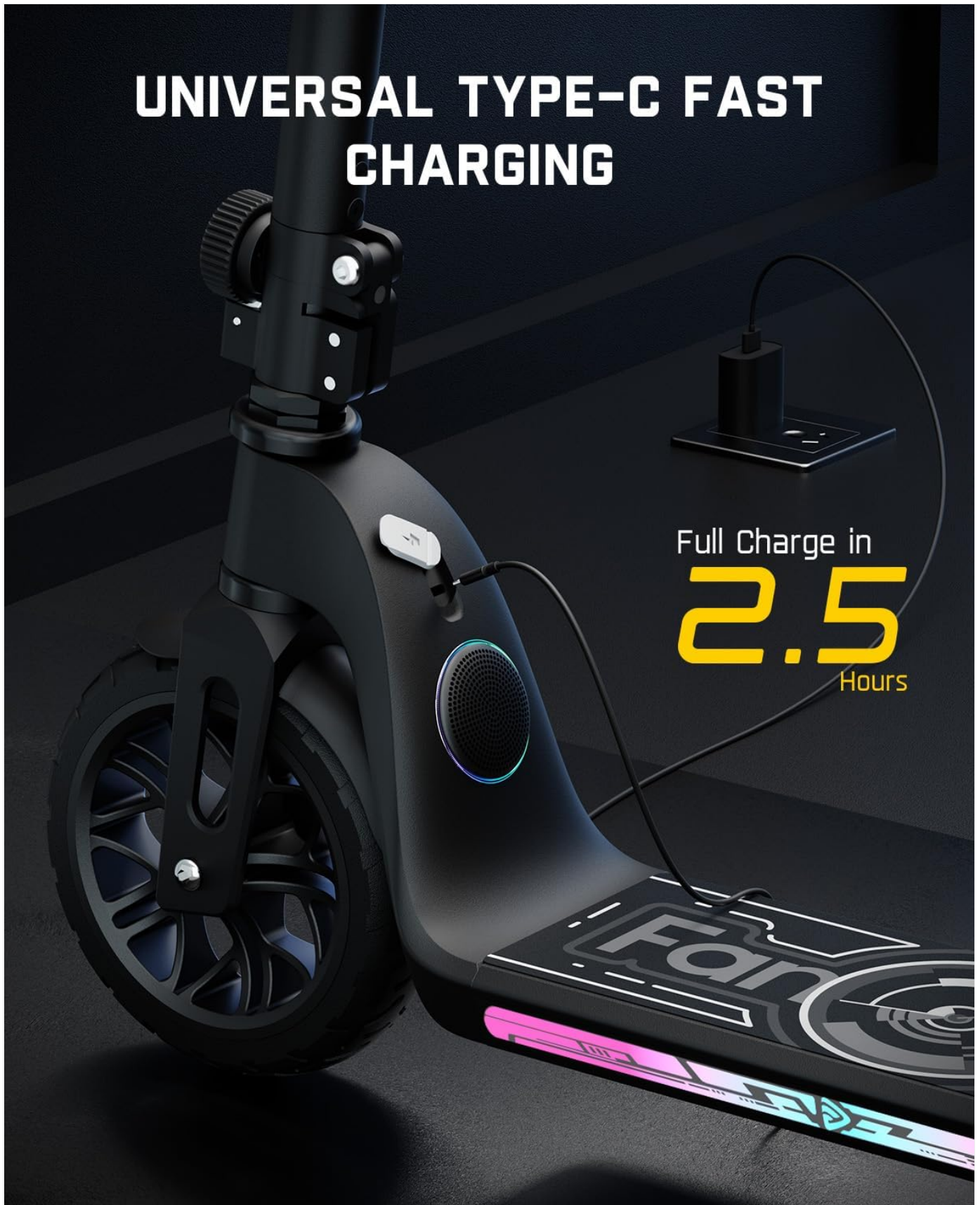
Image: Universal Type-C Fast Charging Port.

USB power adapter (not included). A full charge typically takes 2.5 hours with a 60W PD charger.