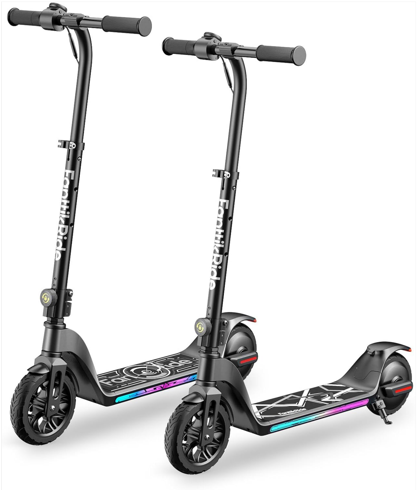
Image: Fantikride C10 Pro and C10 Apex Electric Scooters.