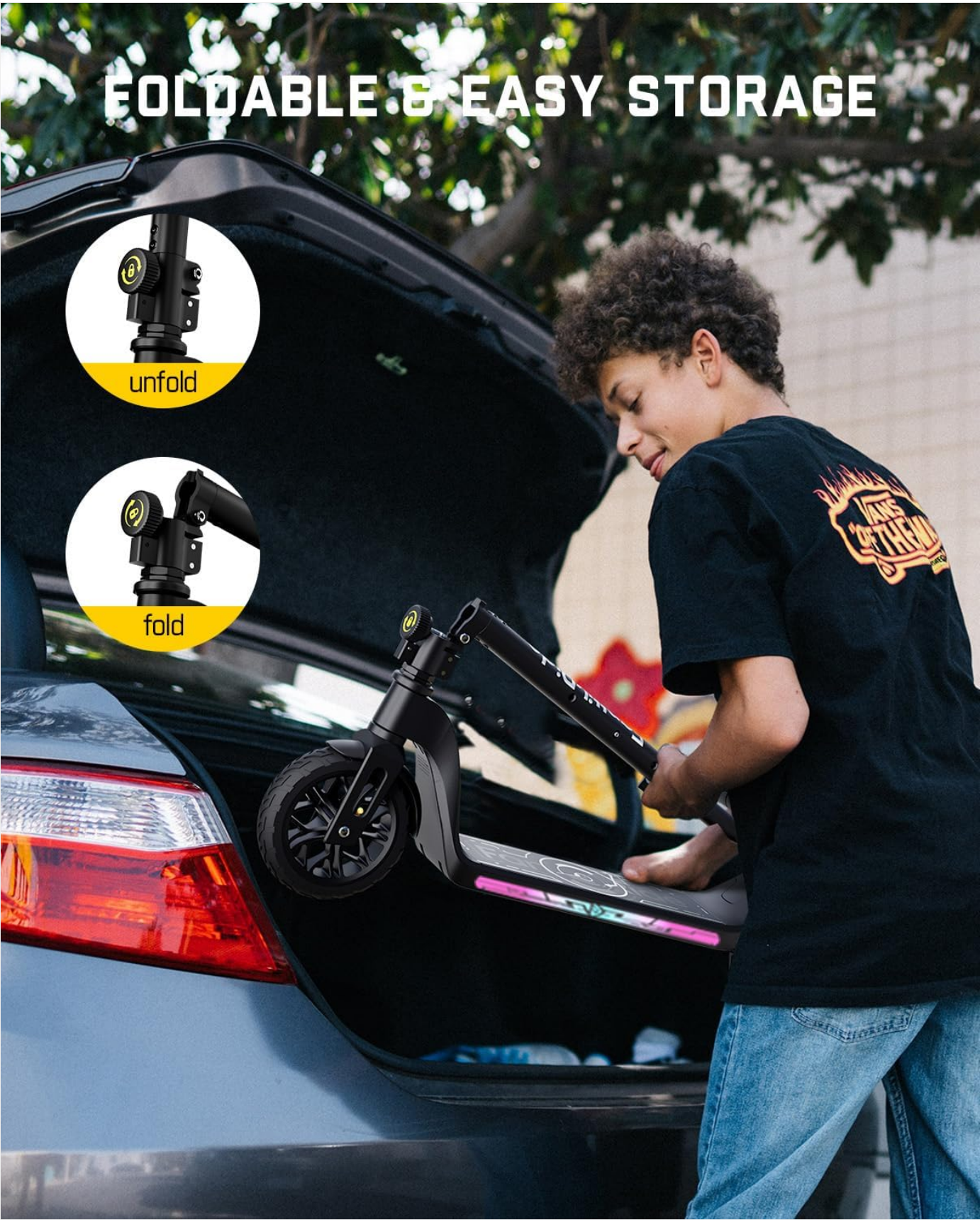
Image: Foldable design for easy storage and transport.