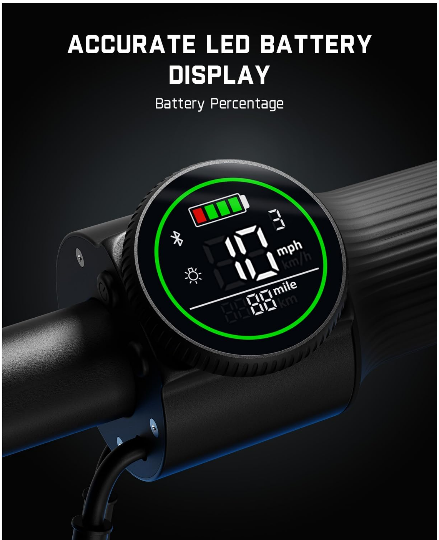
Image: Accurate LED Battery Display and Speedometer.

The scooter also features vivid LED ambient lights on the deck, which can display rainbow-colored patterns, enhancing visibility and adding a fun element to the ride. Some models include a Bluetooth speaker for audio playback.