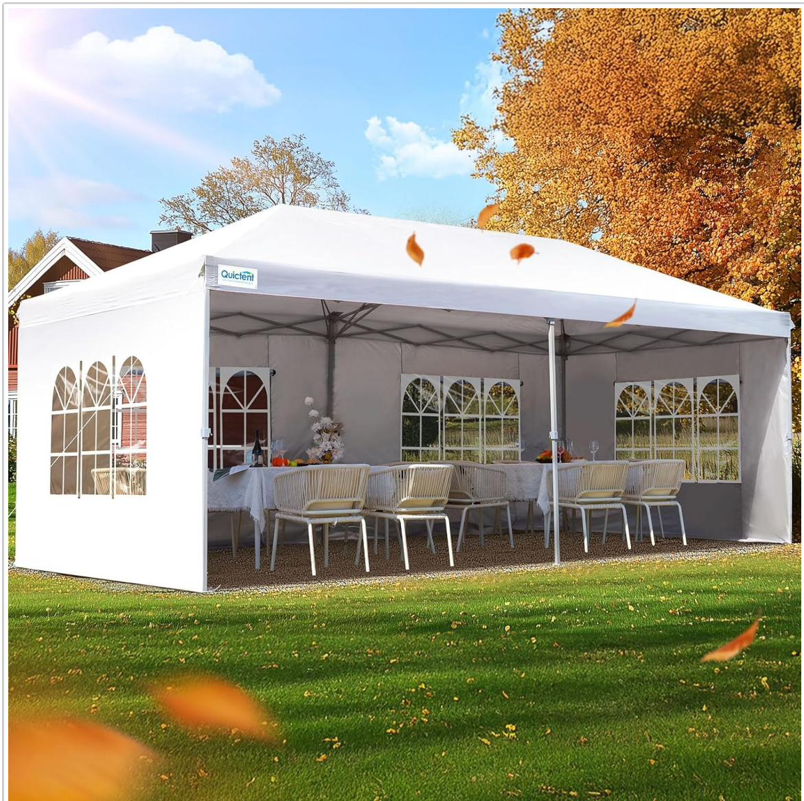
Image Description: A fully assembled QuicTent 10x20 ft Pop-Up Canopy with sidewalls, set up in an outdoor environment.

Attach the sidewalls to the canopy frame using the Velcro fasteners. The sidewalls feature double-sided zippers for easy entry and exit. The church windows provide visibility.