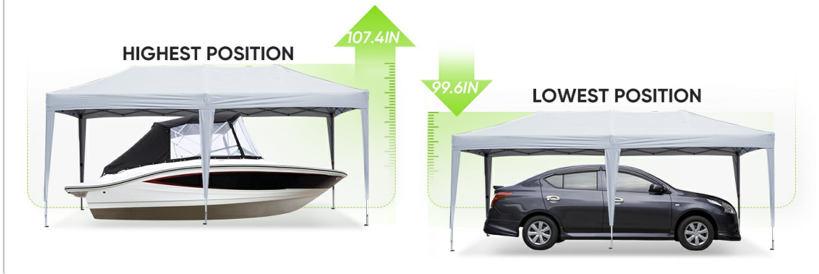
Image Description: An illustration demonstrating the adjustable height feature of the canopy, showing both highest and lowest positions.