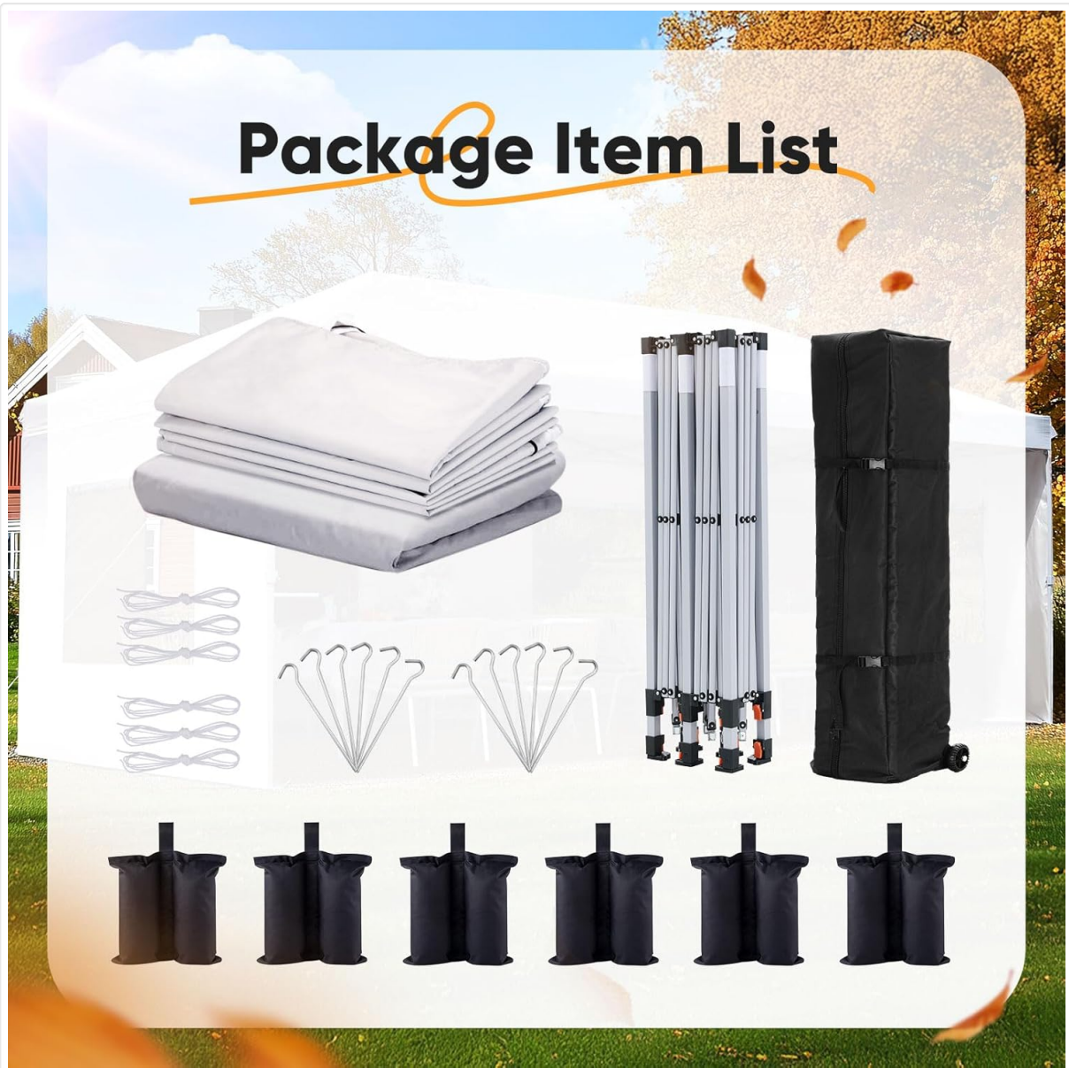
Image Description: An image displaying the complete package contents, including the canopy top, frame, roller bag, sandbags, ropes, and stakes.