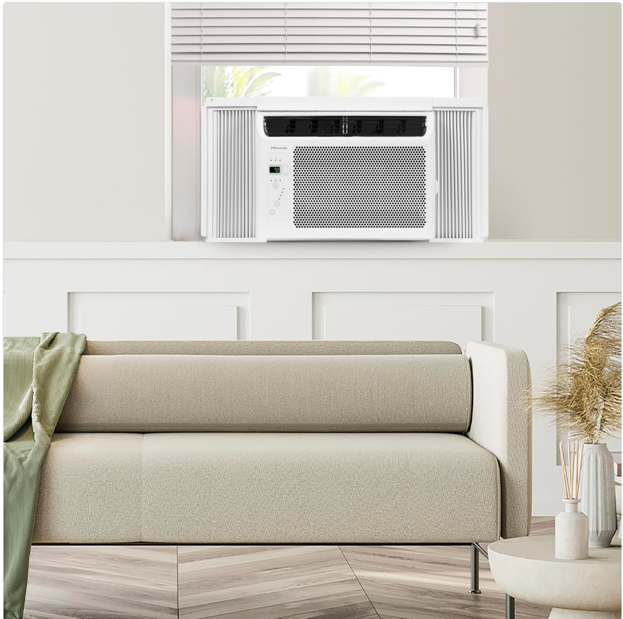
Image: The Hisense WC06R25A unit installed in a window, illustrating the 4-way air direction feature for optimal air distribution.

The unit features 4-way adjustable air vents. Manually adjust the horizontal and vertical louvers to direct the airflow as desired, ensuring even cooling throughout the room.