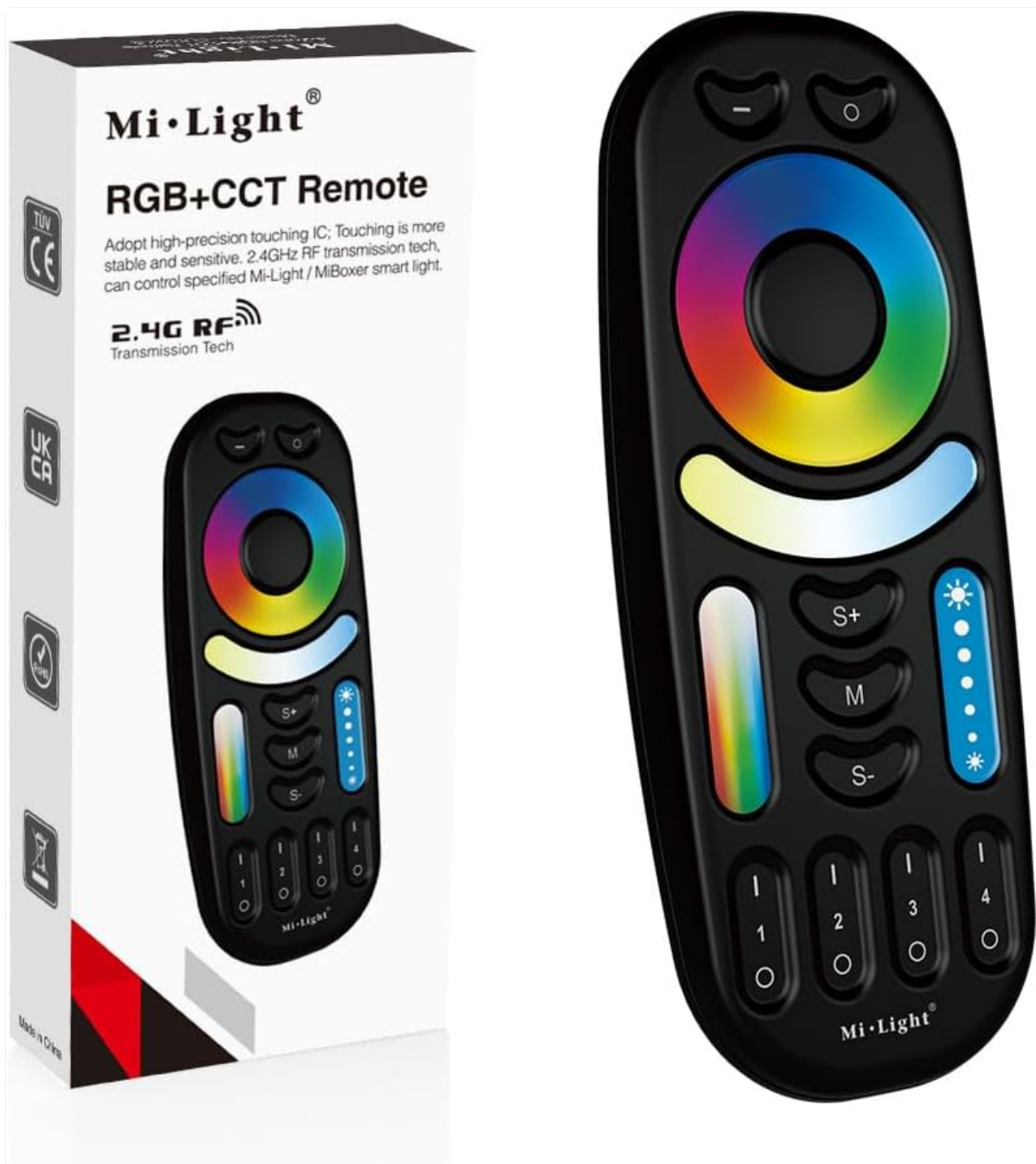
Image: The MiBOXER FUT092 remote control shown alongside its product packaging.