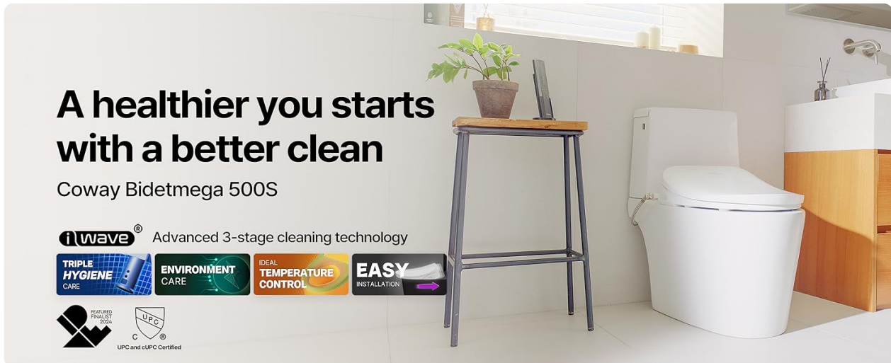
Figure 2.1: Overview of Coway Bidetmega 500S features including i-wave cleaning, triple hygiene care, ideal temperature control, triple environment care, and easy installation.