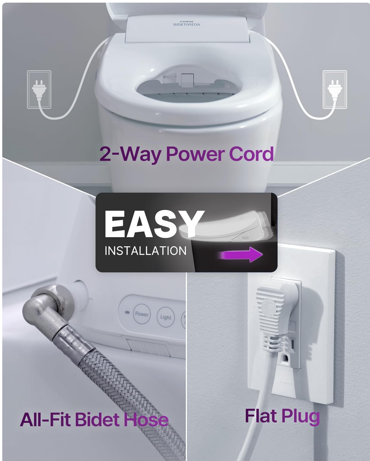
Figure 3.2: Illustration of the 2-way power cord and bidet hose connection for easy installation.