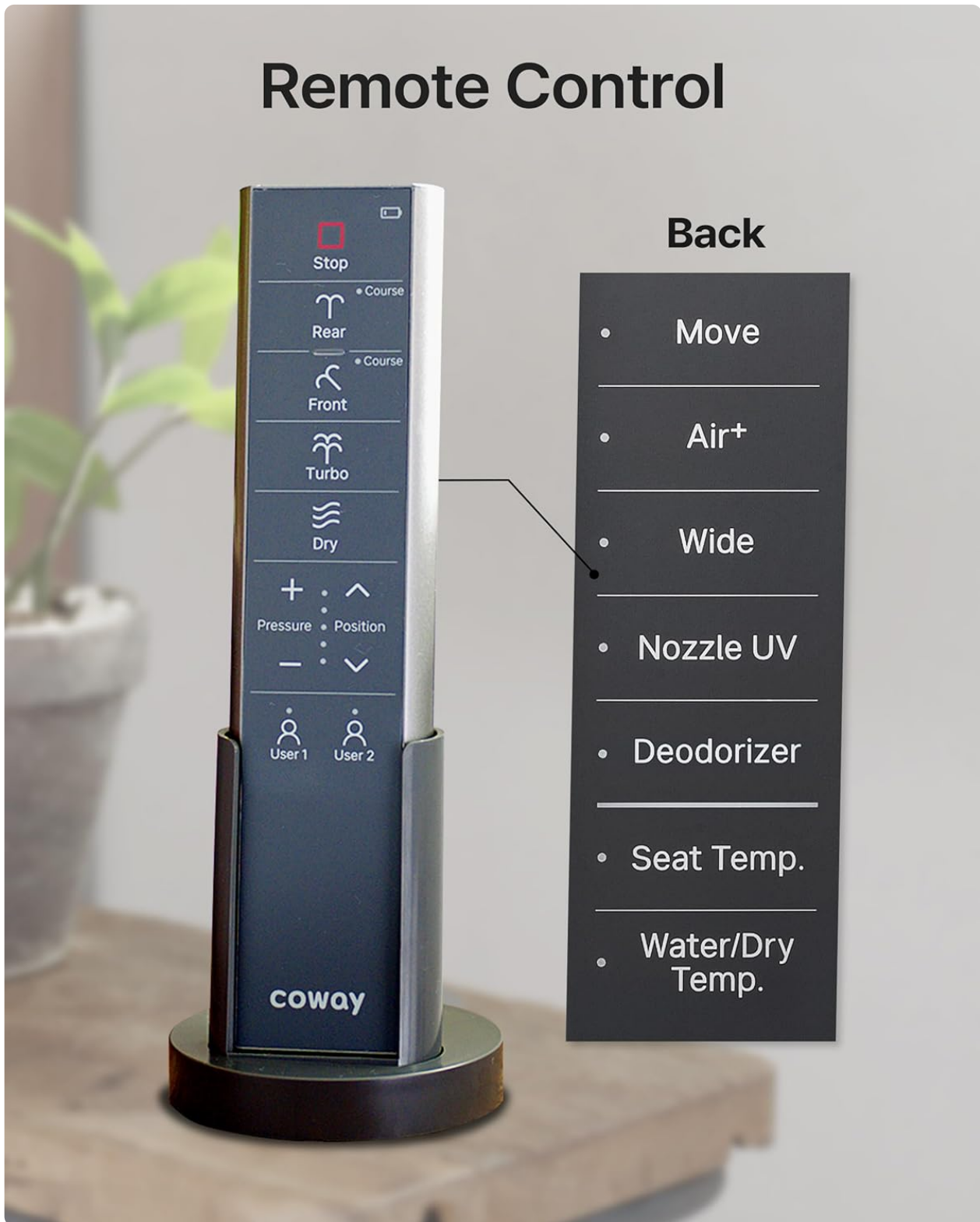
Figure 4.1: Remote control layout showing all available functions for personalized hygiene.