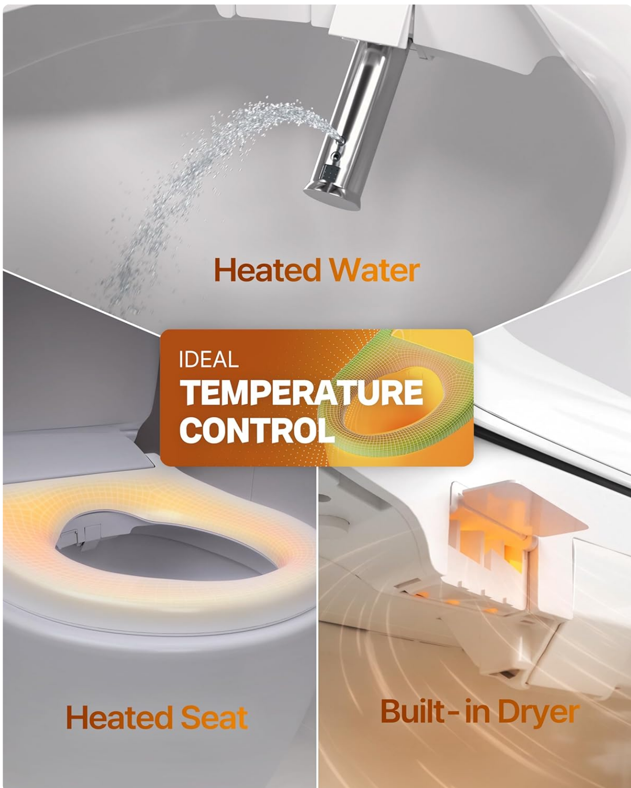
Figure 4.3: Illustration of adjustable heated water, heated seat, and built-in dryer functions.