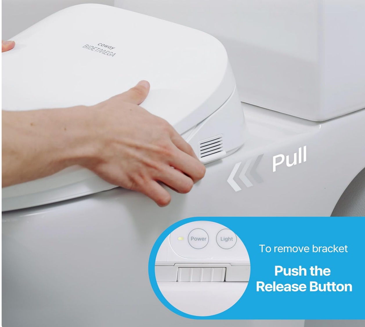
Figure 5.3: Quick-release mechanism for easy removal and cleaning of the bidet seat.