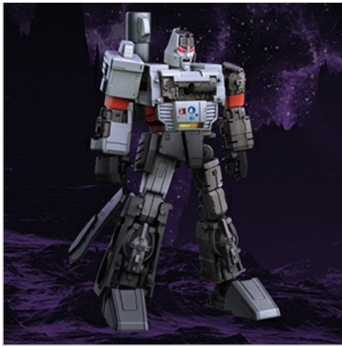
Image: Megatron model kit with partial armor. This image shows the Megatron figure with some external armor panels attached, demonstrating the layering process during assembly.