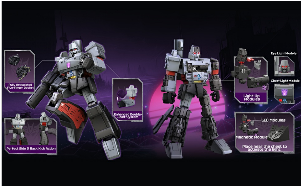
Image: Megatron articulation points and internal details. This image illustrates the various articulation points and the intricate internal mechanical details of the Megatron figure.