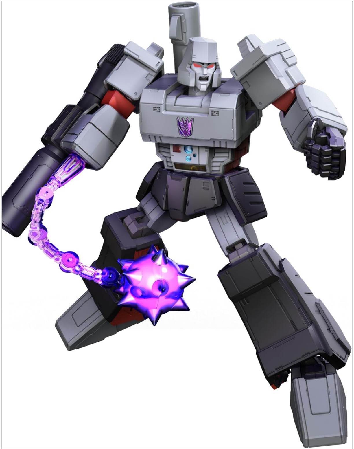
Image: Megatron holding energy mace. The figure is depicted in a dynamic pose, wielding its translucent purple energy mace.