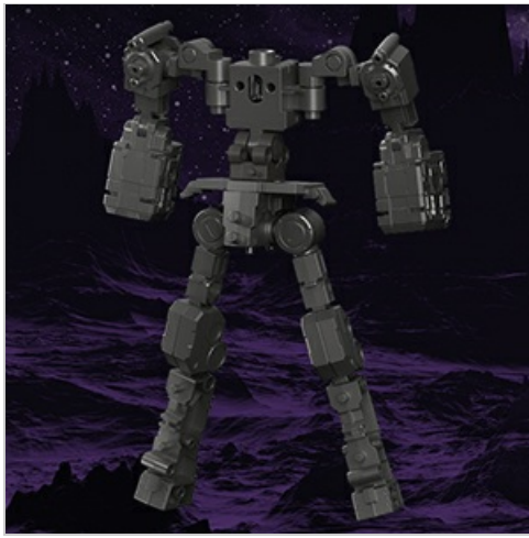
Image: Internal frame of Megatron model kit. This image displays the intricate internal skeletal structure of the Megatron figure, highlighting the detailed joint engineering.