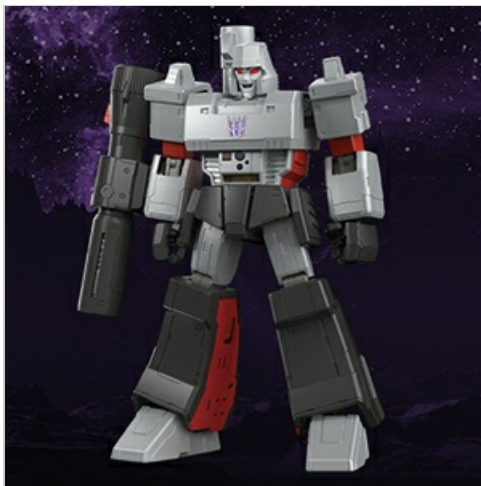
Image: Fully assembled Megatron model kit. This image presents the completed Megatron figure, showcasing its classic G1 design and detailed finish.