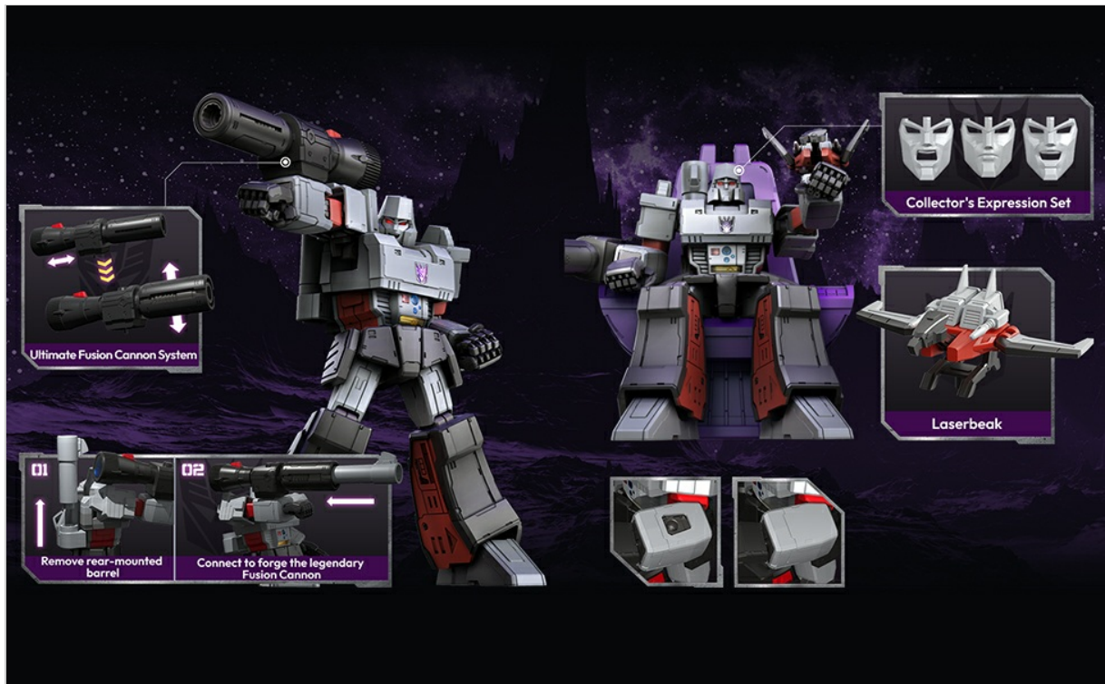
Image: Megatron with fusion cannon and interchangeable faces. This image highlights the ultimate fusion cannon system, multiple collector's expression faceplates, and the Laserbeak accessory.