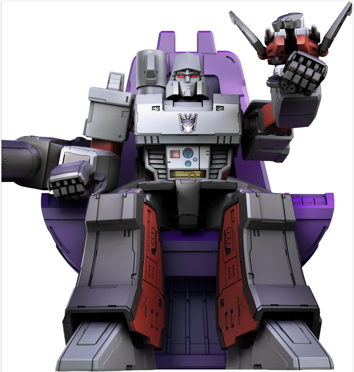
Image: Megatron on his Command Center Display throne. This image shows Megatron seated on his imposing purple throne, which also features ingeniously designed storage compartments for accessories.