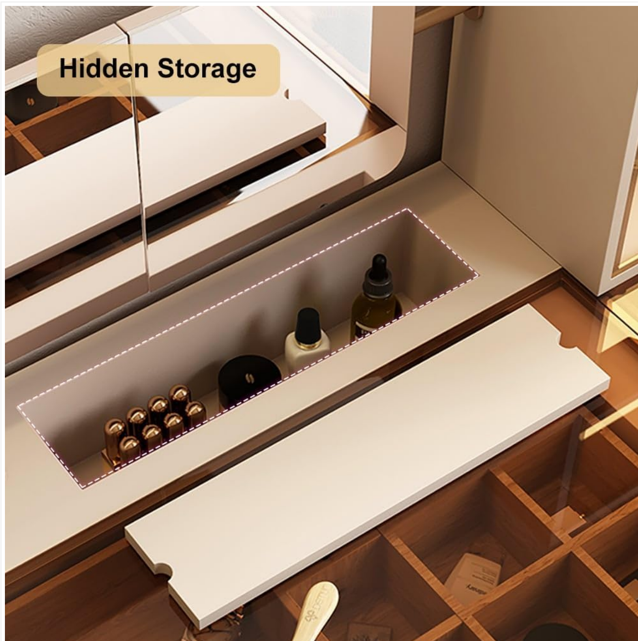
Figure 5.6: A hidden storage area beneath a removable panel on the vanity's surface, ideal for small items.