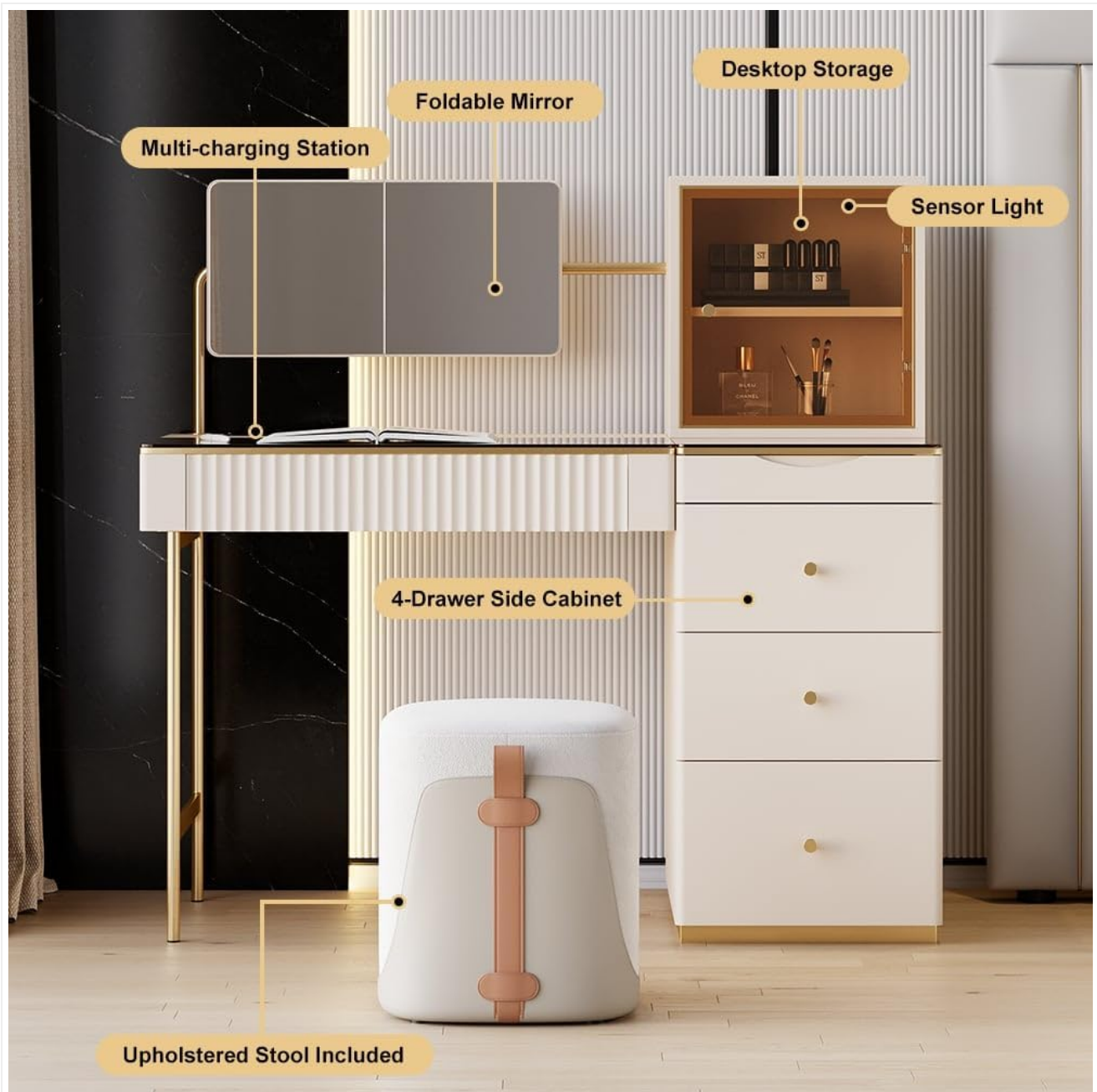
Figure 3.1: Overview of the vanity set with key features labeled, including the multi-charging station, foldable mirror, desktop storage, sensor light, 4-drawer side cabinet, and upholstered stool.