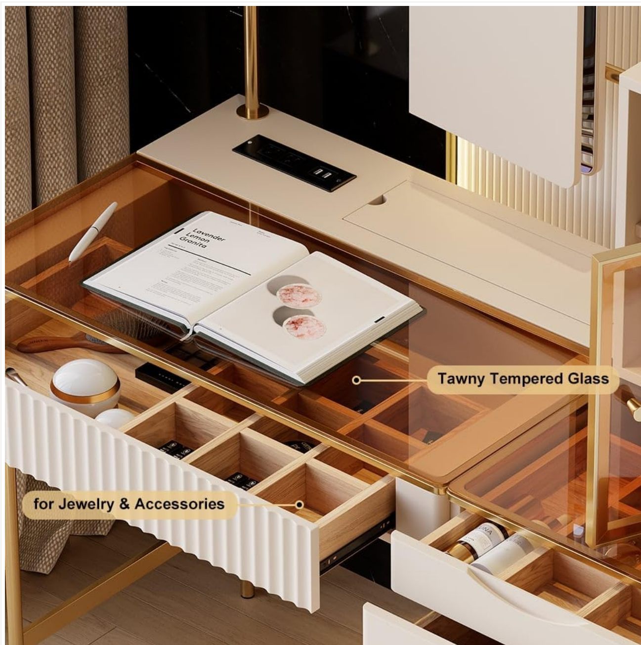
Figure 5.2: View of the tawny tempered glass surface, which lifts to reveal organized compartments for jewelry and accessories.