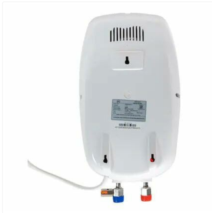
Figure 2: Rear View with Connections. This image displays the back of the water heater, highlighting the mounting points, the power cable, and the water inlet (blue) and outlet (red) connections at the bottom.