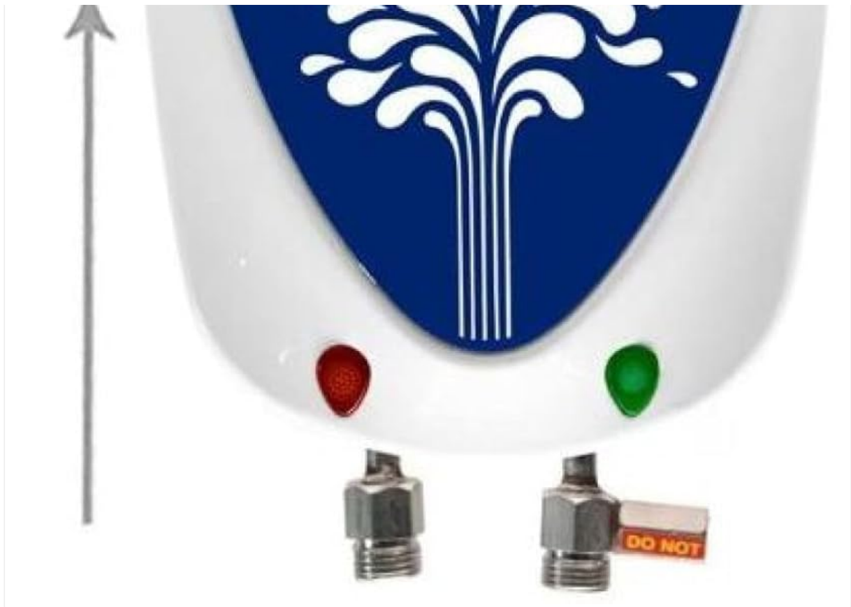
Figure 5: Product Dimensions. This diagram illustrates the physical dimensions of the water heater, indicating a width of 18.5 cm and a height of 36 cm.