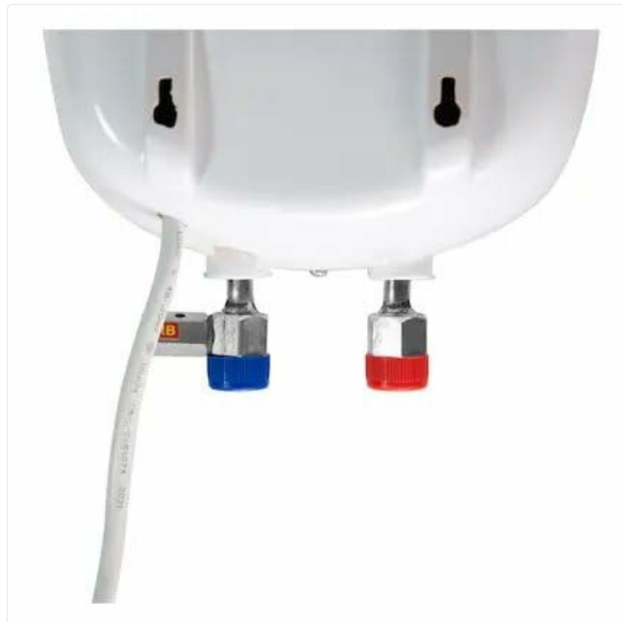
Figure 3: Water Connections. A detailed view of the water inlet (blue valve) and outlet (red valve) connections, crucial for plumbing installation.