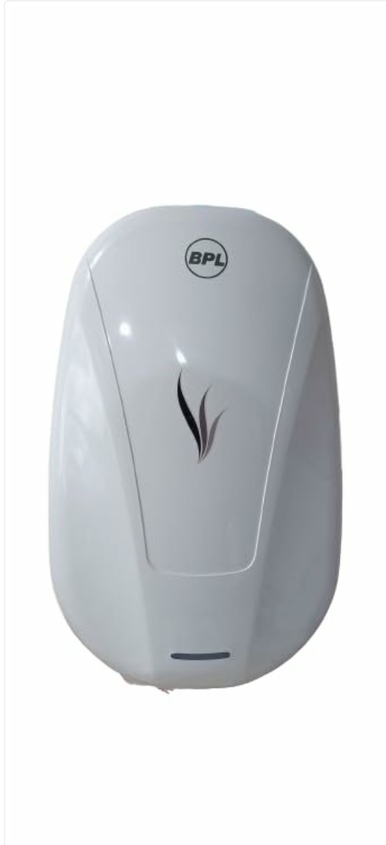
Figure 1: Front View. This image shows the front panel of the BPL Instant Water Heater, featuring its sleek white design and the BPL brand logo.

Familiarize yourself with the parts of your BPL Instant Water Heater.