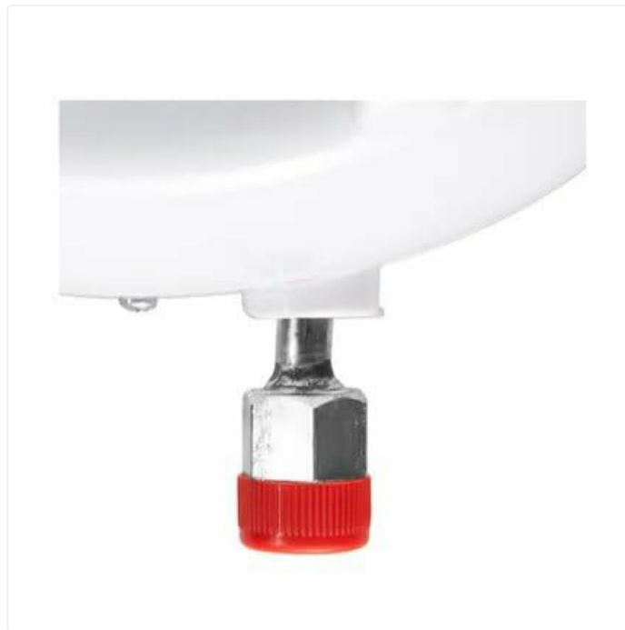
Figure 4: Hot Water Outlet. A close-up of the red-marked hot water outlet connection.