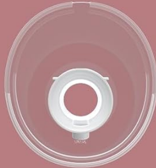
1 Flange (24mm)