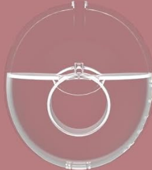
1 Milk Collector