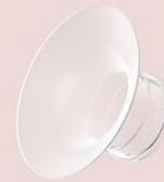
1 Insert (21mm)