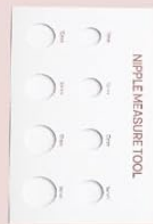
1 Size Ruler