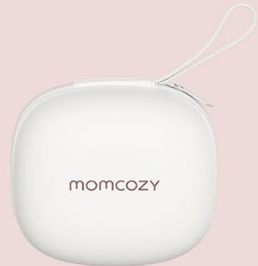
1 Pumps Case

Tips: Suggest replacing every 1-3 months for performance