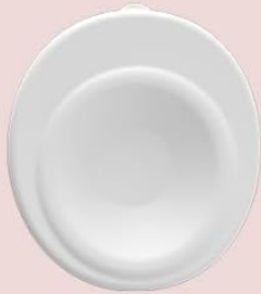
1 Flange Cover