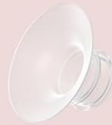
1 Insert (19mm)