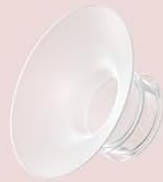
1 Insert (17mm)