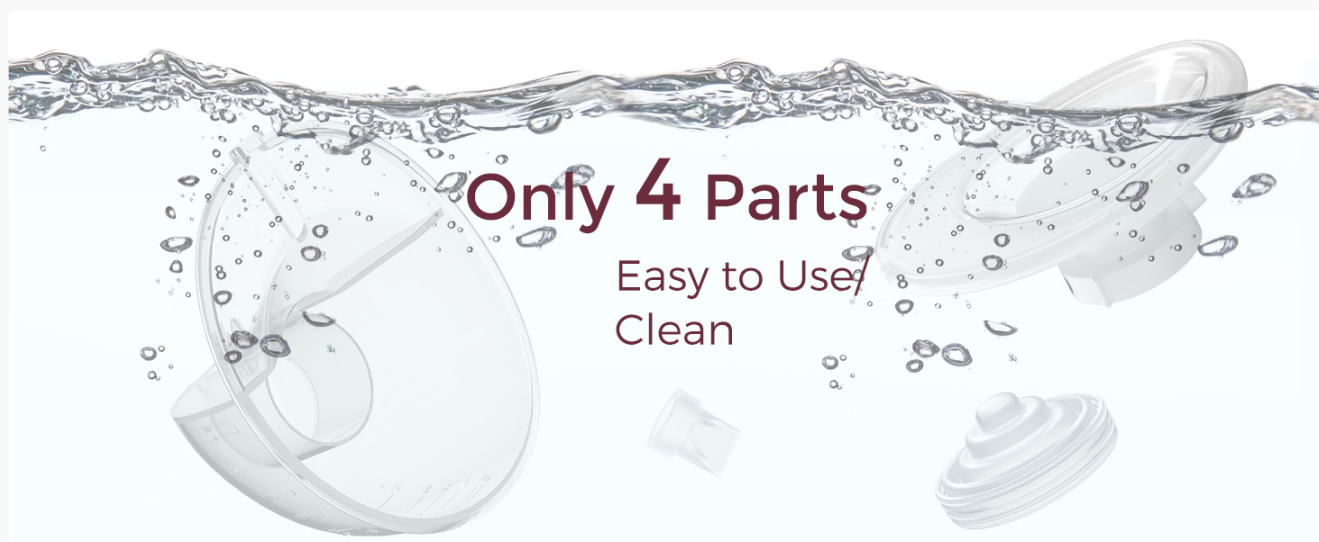
Image: Illustrates the minimal number of parts for the Momcozy M5, making cleaning simple.

Regular cleaning of your breast pump parts is essential for hygiene and optimal performance. The Momcozy M5 is designed for easy disassembly and cleaning.