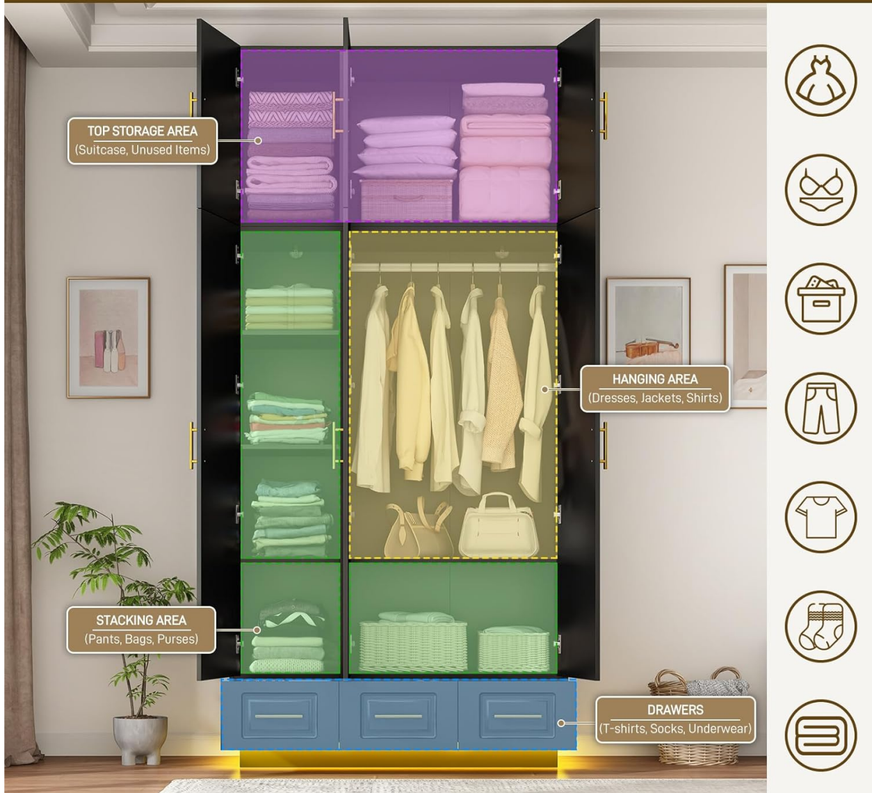
Image: Diagram illustrating the various storage partitions within the wardrobe, including top storage, hanging area, stacking area, and drawers.