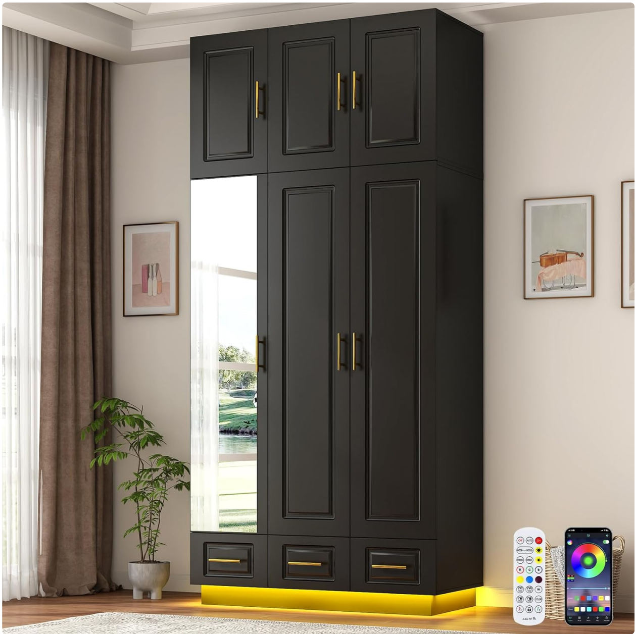
Image: The Hlivelood Large Armoire Wardrobe Closet in black with LED lights, featuring multiple doors and drawers.