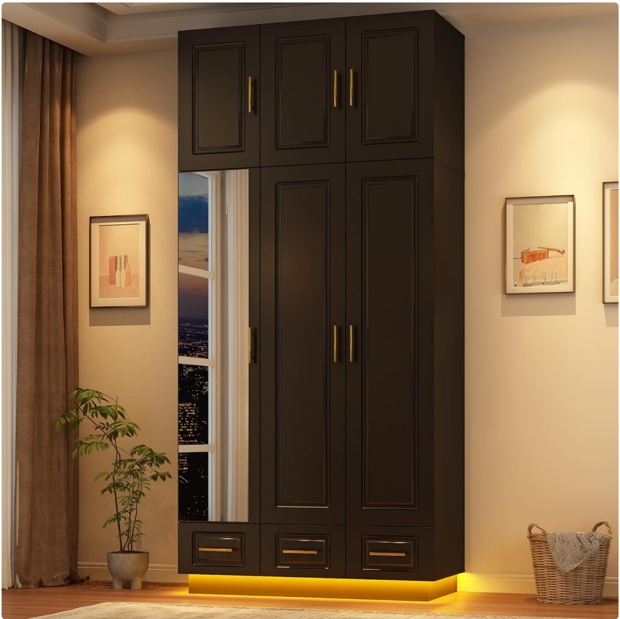
Image: The wardrobe illuminated by its LED lights in a nighttime setting, demonstrating its use as a night light.