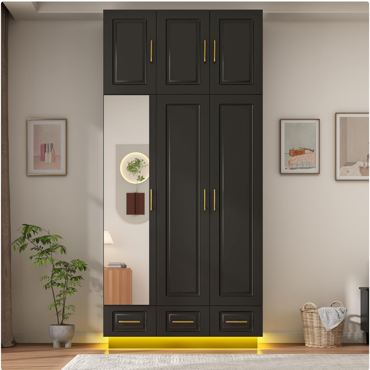
Image: The wardrobe illuminated by its LED lights in a daytime setting, showcasing the ambient glow.