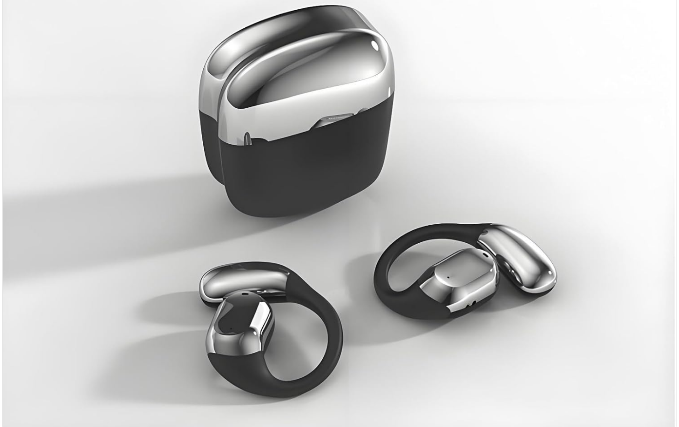
Image: The Hy-Y3 Pro earbuds and their charging case, highlighting their "AI Super Brain" capabilities for various intelligent functions.