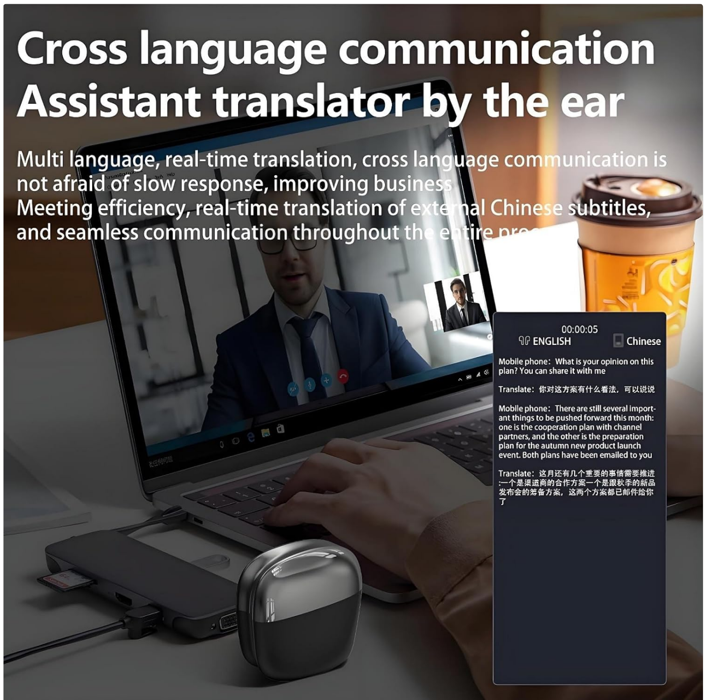
Image: A laptop screen showing a video conference with real-time translation subtitles, demonstrating the Hy-Y3 Pro's capability for cross-language communication in professional settings.

Multi language, real-time translation, cross language communication is not afraid of slow response, improving business Meeting efficiency, real-time translation of external Chinese subtitles, and seamless communication throughout the entire process