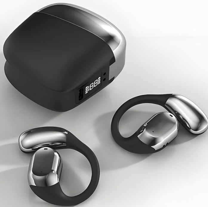
Image: The Hy-Y3 Pro earbuds and their case, illustrating their multi-functional AI capabilities for recording, writing, translating, listening, and speaking.