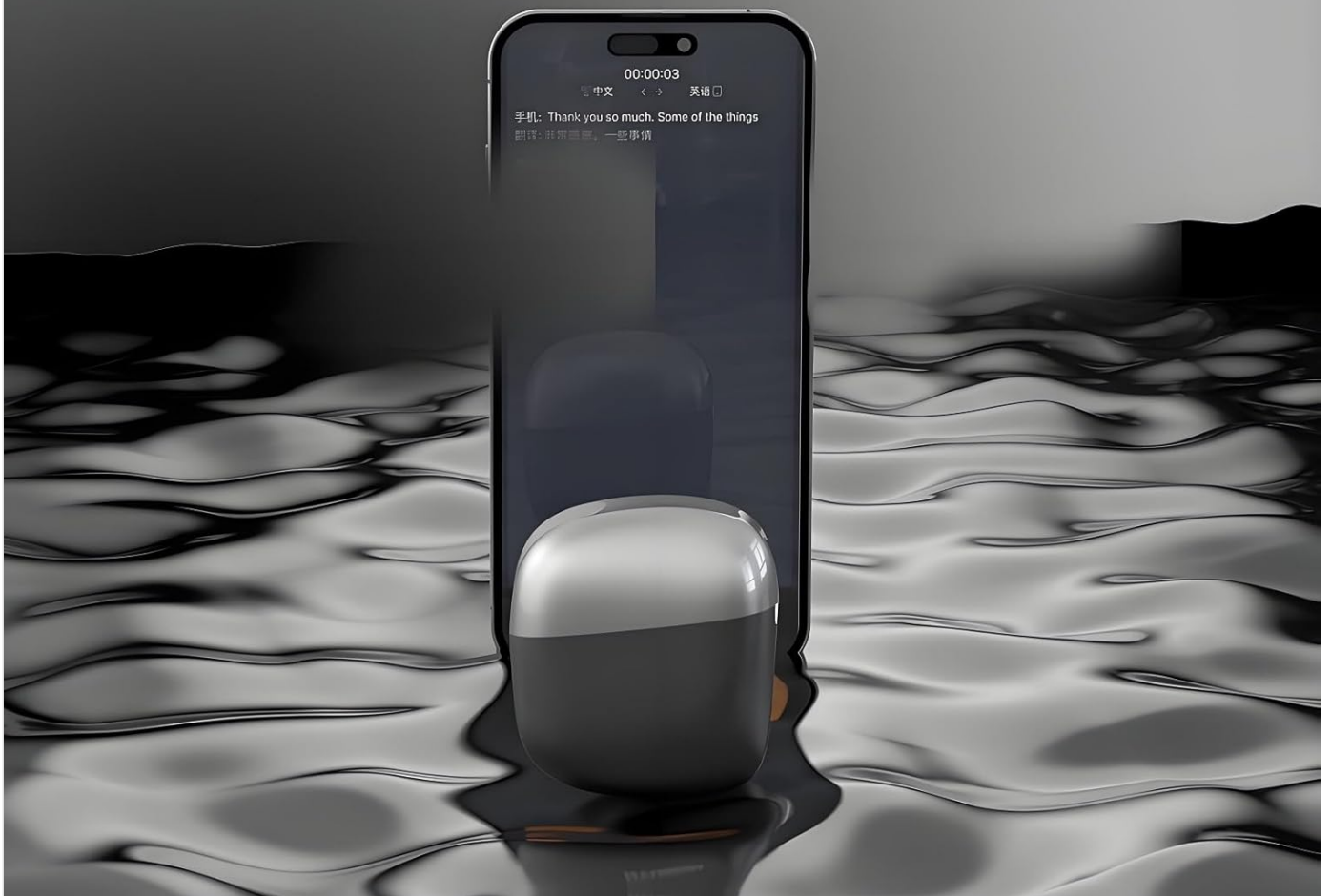
Image: A smartphone screen showing the Hy-Y3 Pro app actively translating a conversation, displaying both original and translated text.