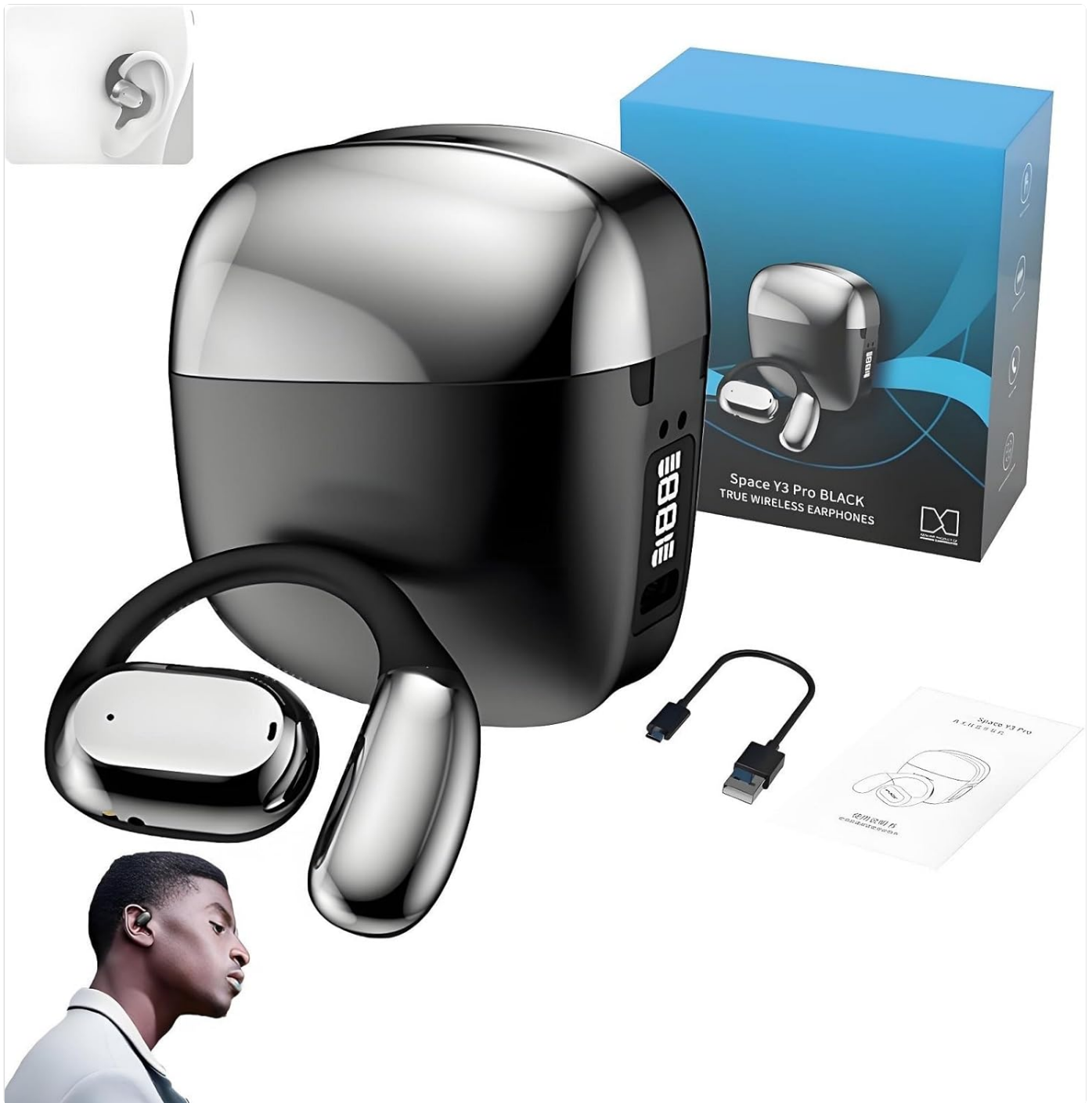
Image: The Hy-Y3 Pro Language Translator earbuds, their charging case, a Type-C charging cable, and a function instruction card, all neatly arranged.