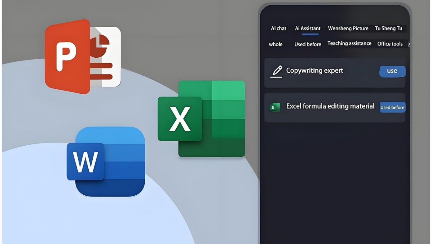
Image: A visual representation of the Hy-Y3 Pro AI Assistant app, highlighting its diverse functionalities including office tools and AI chat.

AI Assistant "with over 200 built-in applications, including creation, office, learning, law, and more More than 10 scenes. Work and study anytime, anywhere to improve work efficiency. For example: copywriting Rewriting, EXCEL formula editing, Xiaohongshu copywriting generation, etc. They are all convenient for daily work Efficient tools for production. Combining functions together makes it more convenient for users to use and improves efficiency Use efficiency. It integrates natural language processing, machine learning, deep learning, and other advanced technologies The intelligent service platform for advanced technology aims to provide users with personalized and intelligent services Service experience. In addition, click on the function you want to use and follow Nebula's prompts to provide specific instructions Just ask. You can view the used applications in the "Used" interface.