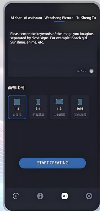
Image: A screenshot of the Hy-Y3 Pro AI app, demonstrating the "Wensheng Picture" feature where users can generate images from text descriptions.