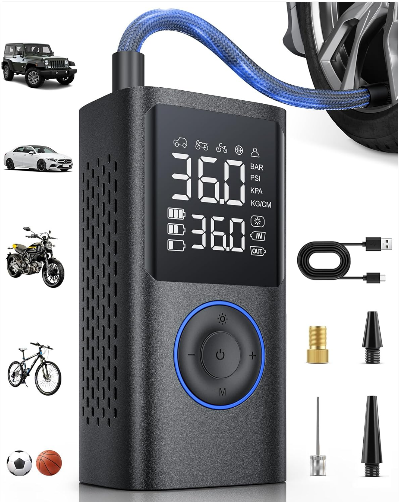
Figure 1: Powools ATJ-006 Portable Tire Inflator and its applications.

The inflator is equipped with a digital display for real-time pressure monitoring and preset pressure settings, along with an automatic shut-off function to prevent over-inflation. Its integrated LED light provides illumination for nighttime use and includes emergency signaling modes.