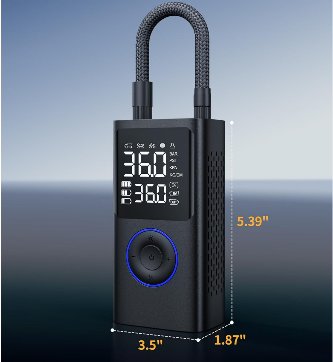
Figure 6: Compact dimensions of the Powools ATJ-006 for easy portability.