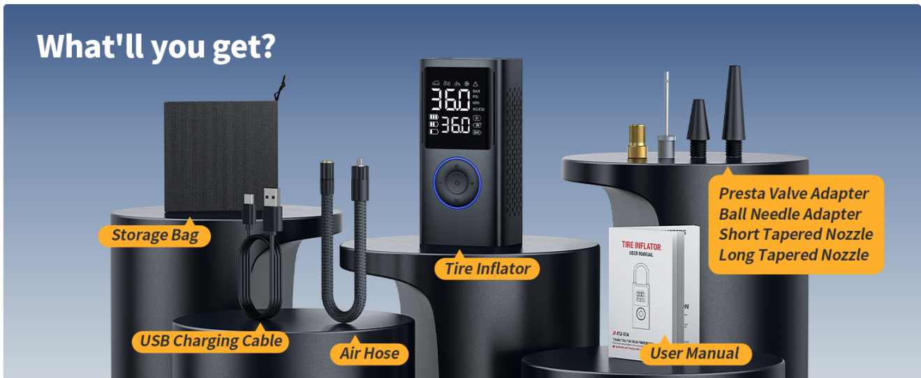
Figure 2: Included accessories with the Powools ATJ-006 Tire Inflator.