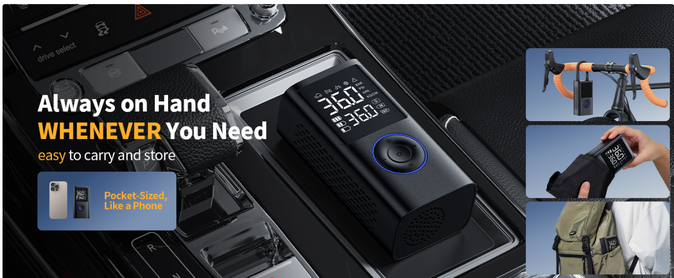
Figure 3: The Powools ATJ-006 features a convenient Type-C charging port.