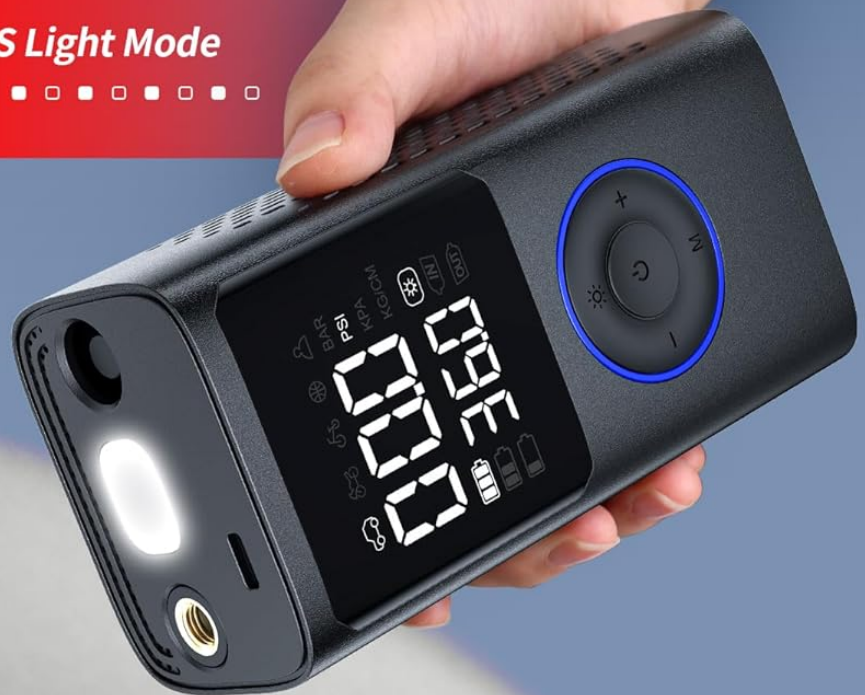
Figure 5: The LED light offers multiple modes for visibility and safety.