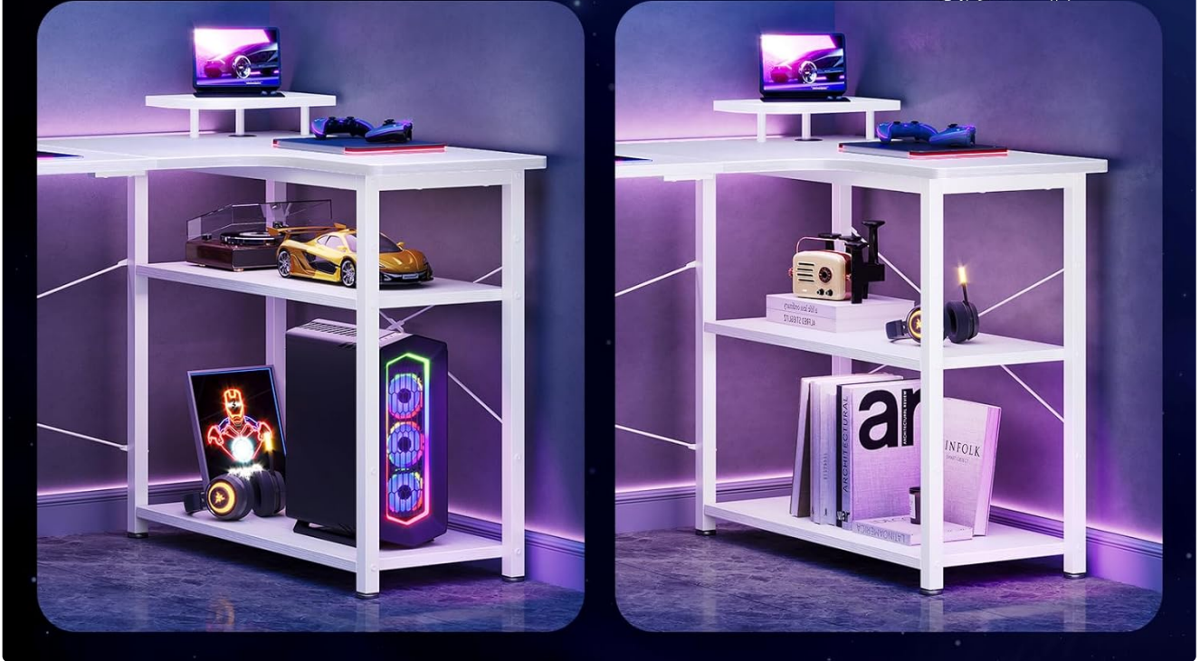
Image 4.2: The integrated shelves can be adjusted to different heights.