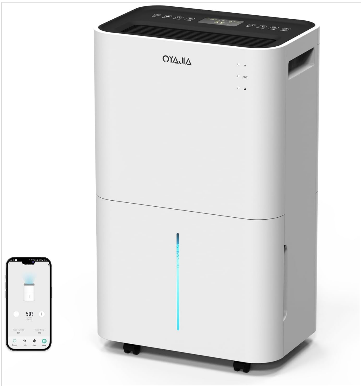
Figure 2.1: Overall view of the Oyajia BD029A Dehumidifier, showing its compact design and a mobile app interface for remote control.