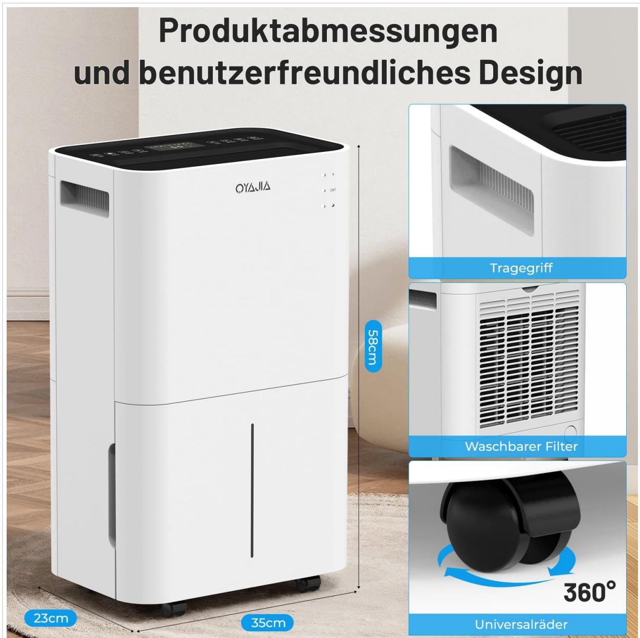
Figure 2.2: Product dimensions (23.5 x 35 x 58 cm) and design elements including a carry handle, washable filter, and 360-degree universal wheels for portability.