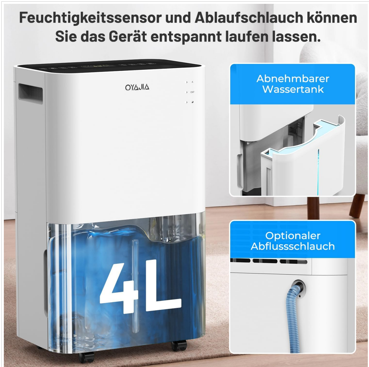
Figure 3.1: The dehumidifier features a removable 4-liter water tank and an optional drain hose for continuous drainage. The humidity sensor allows for relaxed operation.

Ensure the 4-liter water tank is correctly inserted into the unit. The unit will not operate if the tank is full or improperly seated.