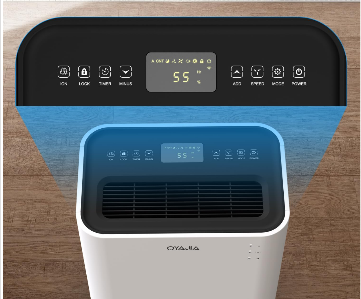
Figure 4.1: The intelligent LED display and control panel for easy operation and monitoring of humidity levels.

Das moderne LED-Display mit Feuchtigkeitsanzeigeleuchten sorgt für eine einfache Bedienung.