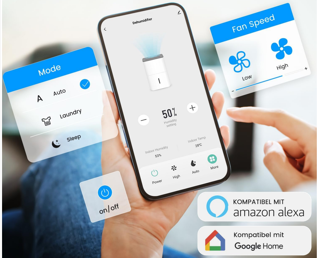
Figure 4.3: Smart App operation allows control of the dehumidifier from anywhere via the app or voice command, compatible with Amazon Alexa and Google Home.

Bedienen Sie Ihren Luftentfeuchter von überall aus über die App oder per Sprachbefehl.