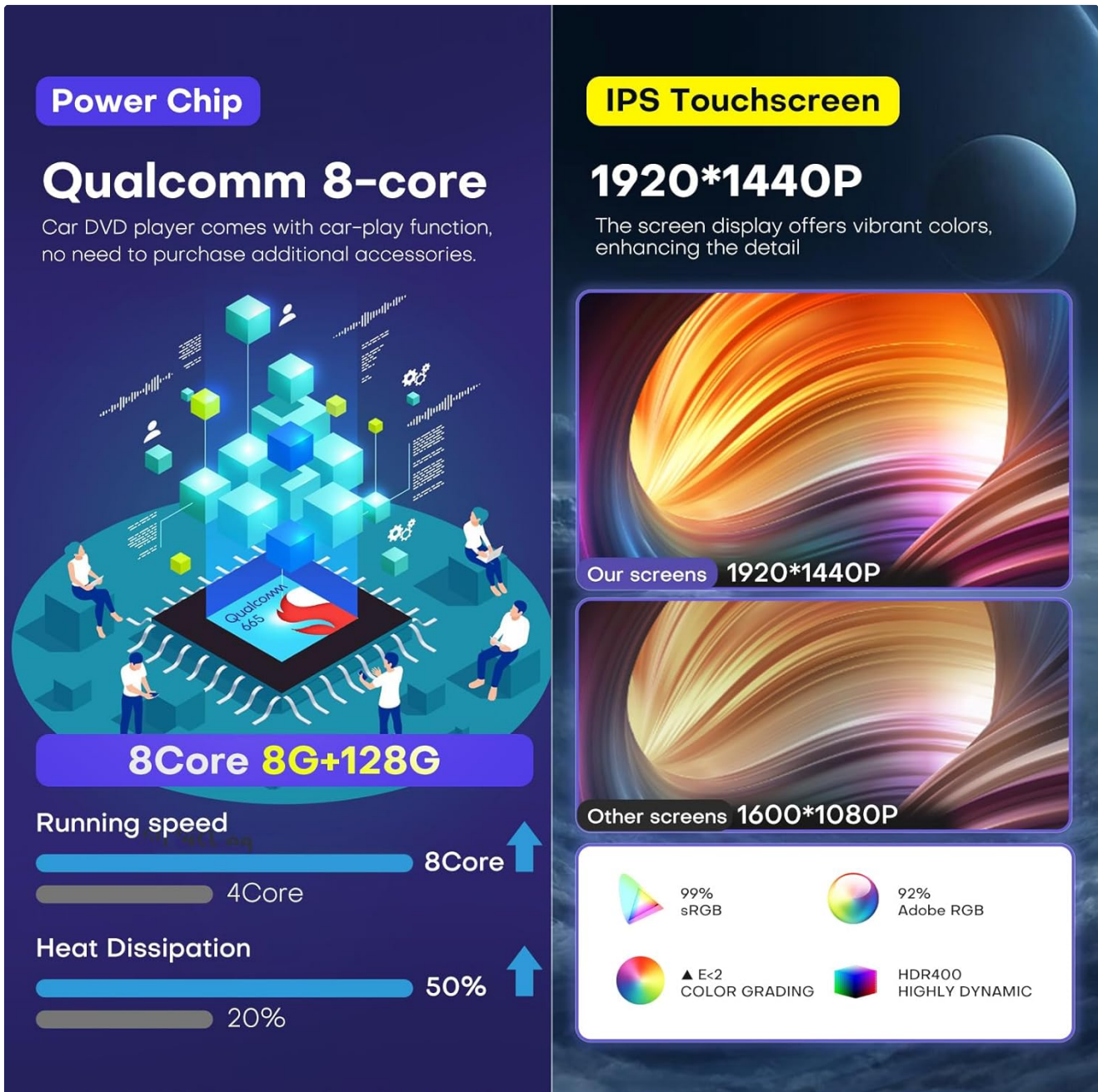
Figure 6.1: Performance and Display Specifications