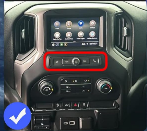
Figure 2.1: Before and After Installation

The installation process replaces your existing car radio with the new 15.6-inch display, integrating seamlessly into your vehicle's dashboard. The system retains all OEM features, including steering wheel controls, rear camera, and radar functions.