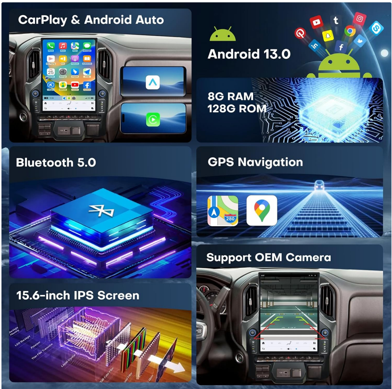
Figure 1.1: Key Features of the Toeklsa Qualcomm Car Radio