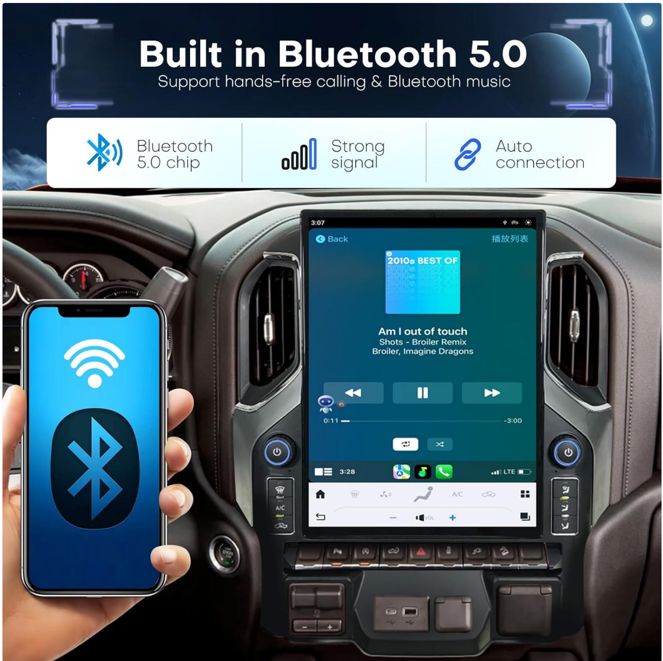
Figure 3.3: Bluetooth 5.0 Functionality