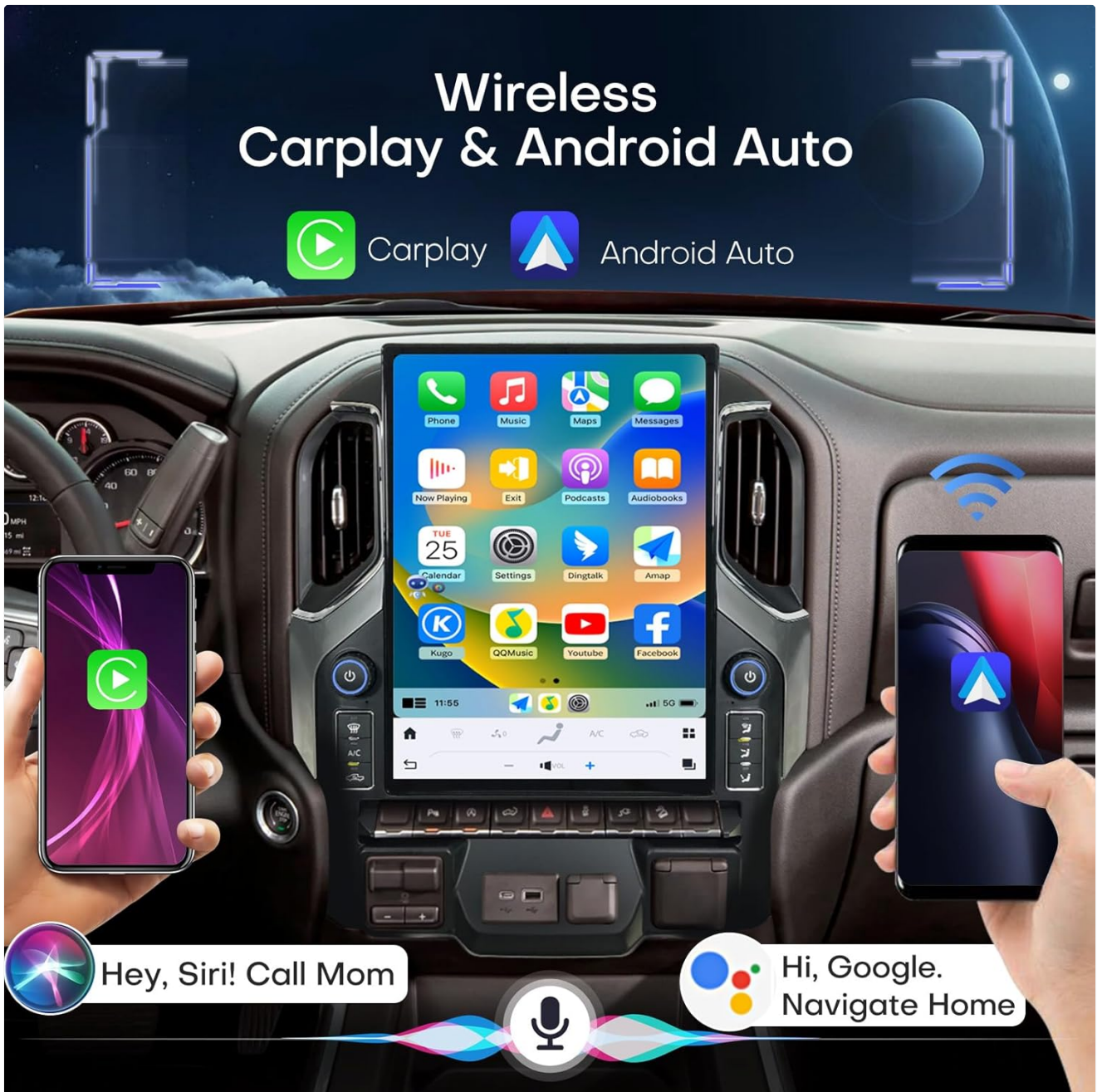
Figure 3.1: Wireless CarPlay and Android Auto Interface

Your browser does not support the video tag.