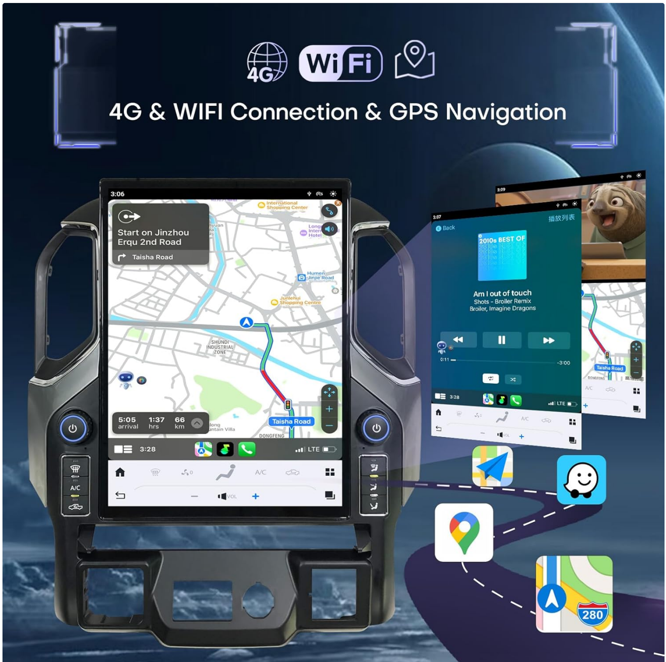
Figure 3.2: GPS Navigation and Connectivity Features