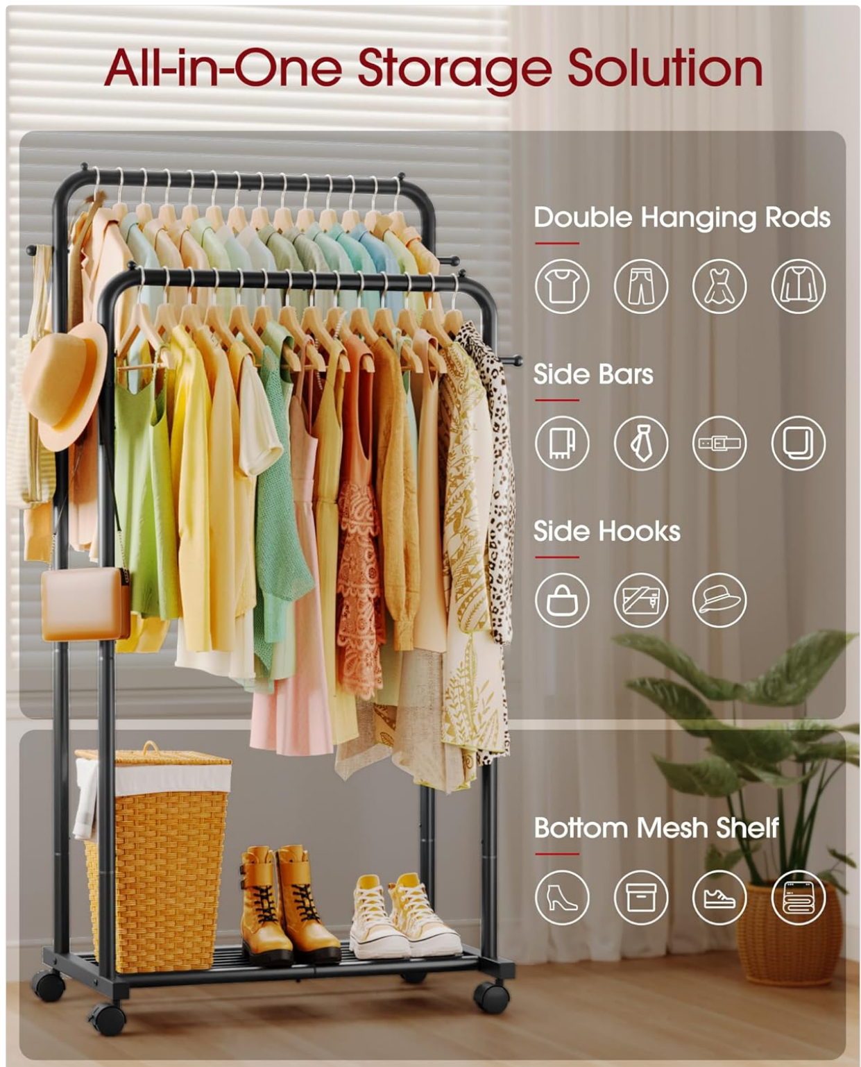
Figure 4: All-in-one storage solution highlighting double rods for hanging, side hooks for accessories, and a bottom mesh shelf for various items.