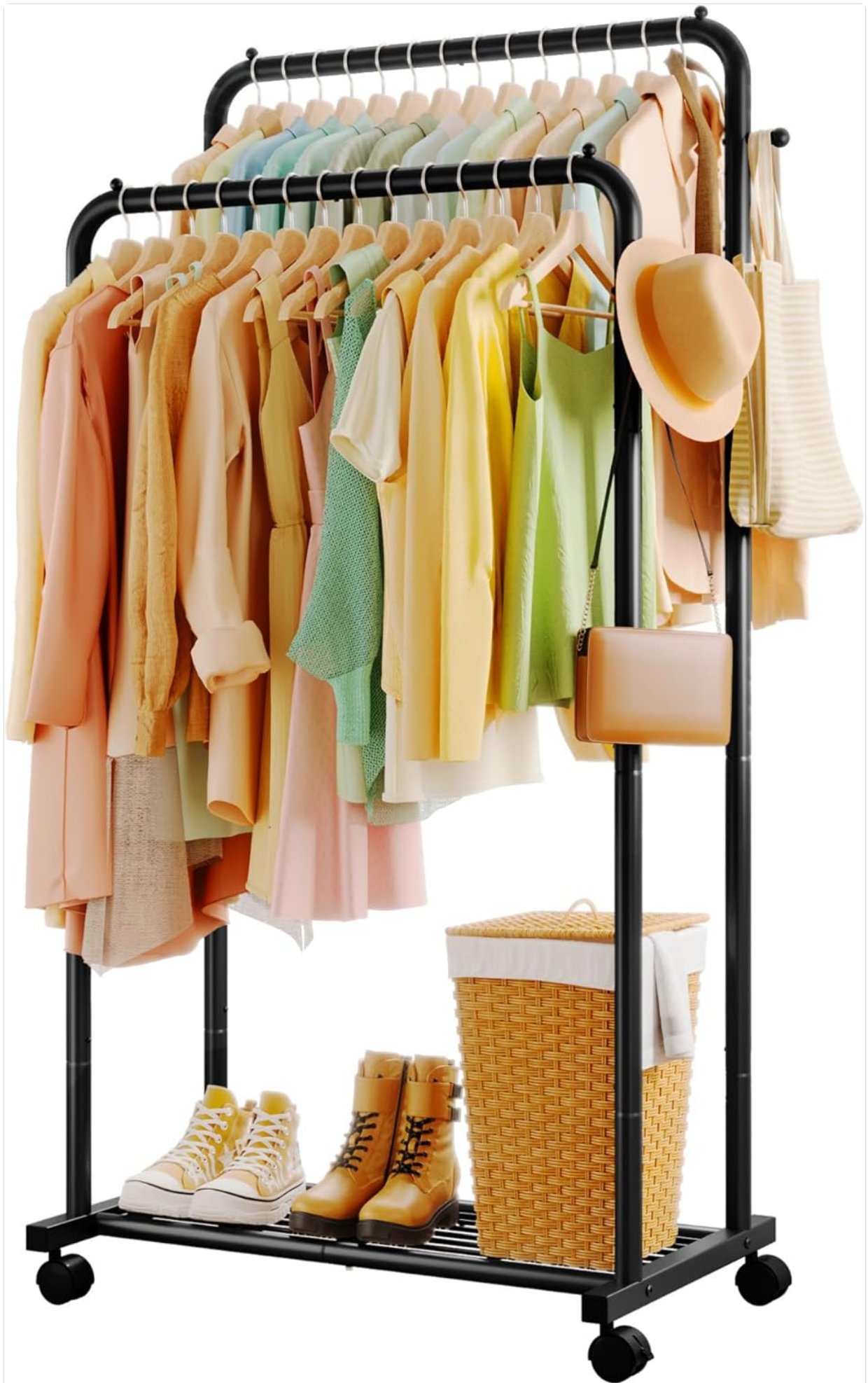
Figure 1: Fully assembled Sakugi Double Rods Clothing Rack, showcasing its double rods, mesh shelf, and side hooks.