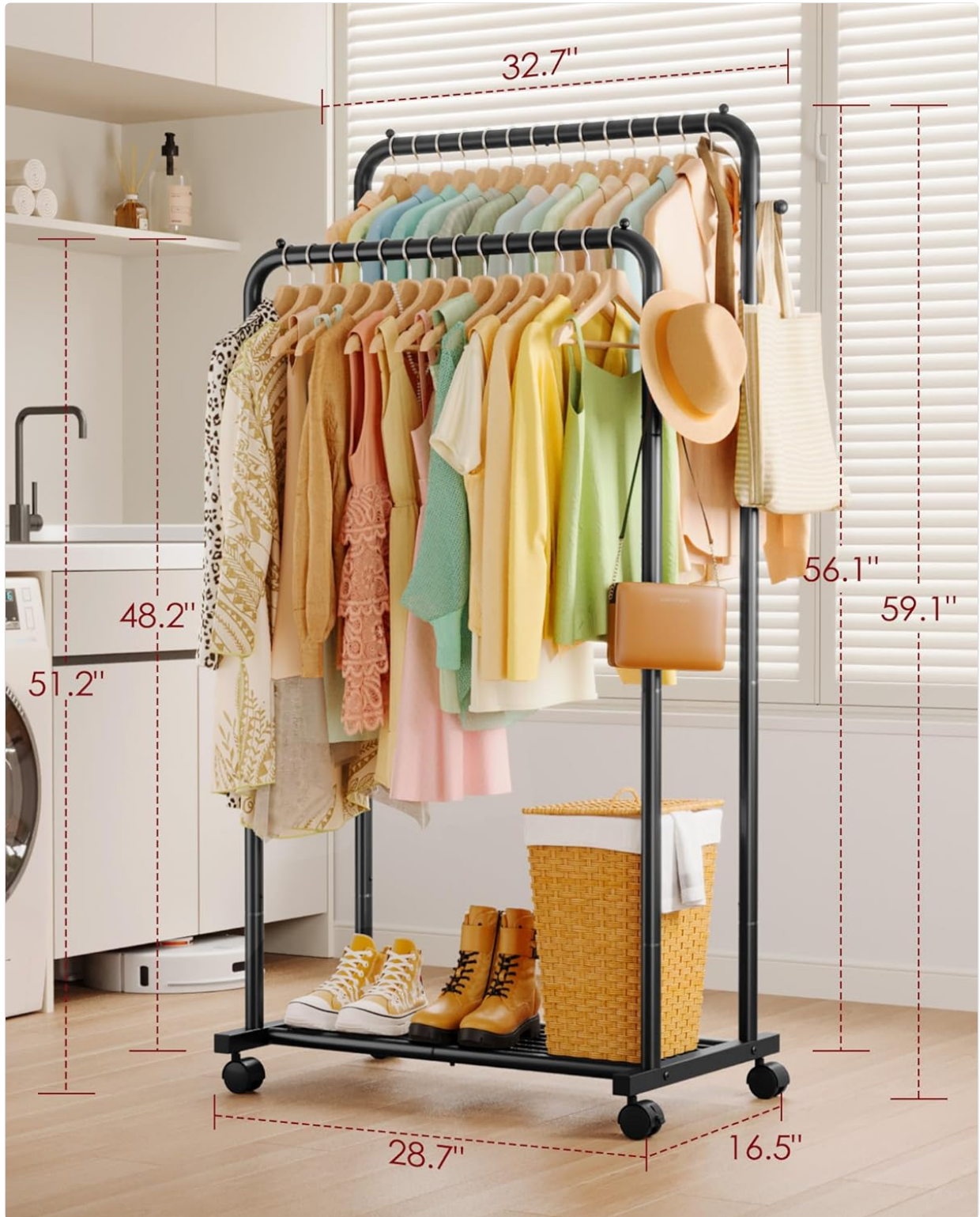
Figure 6: Detailed dimensions of the clothing rack, including width, depth, and height.