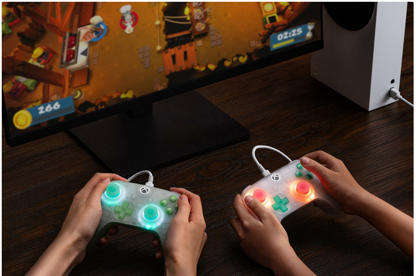
The controller in use, showcasing its compact design and illuminated joysticks.