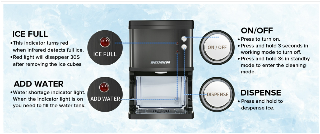
Figure 5.1: Simple steps to begin ice production.