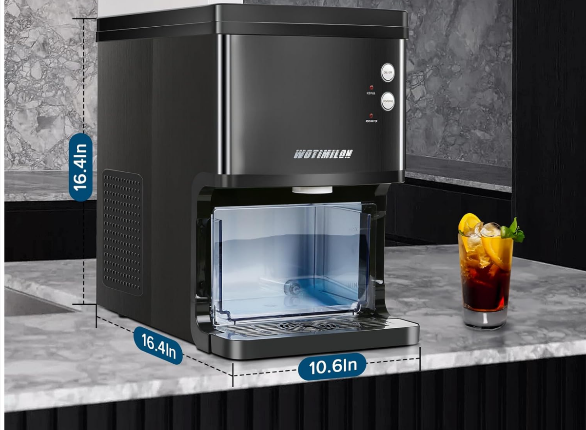
Figure 3.3: Product dimensions for placement consideration.