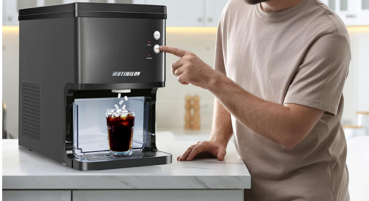
Figure 5.2: Dispensing ice by pressing the 'Dispense' button.