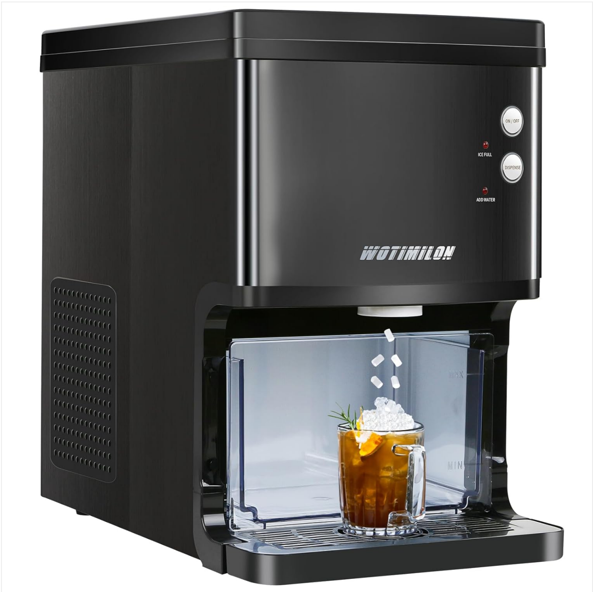
Figure 3.1: Front view of the WOTIMILON Nugget Ice Maker, showing the ice dispensing area and control panel.