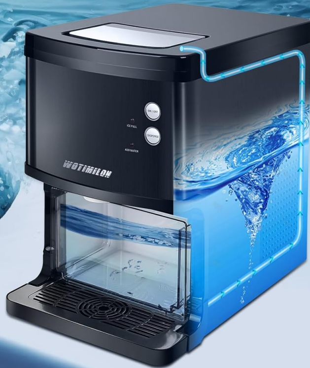
Figure 6.1: Activating the self-cleaning function.