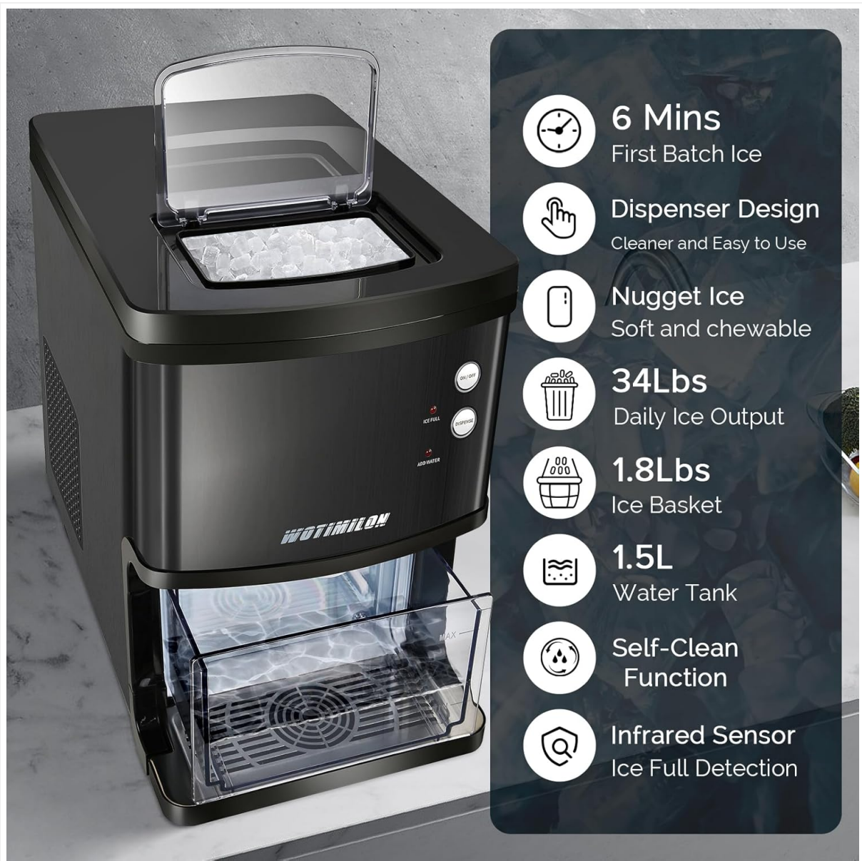
Figure 3.2: Key features and specifications of the ice maker, including ice production capacity and water tank size.