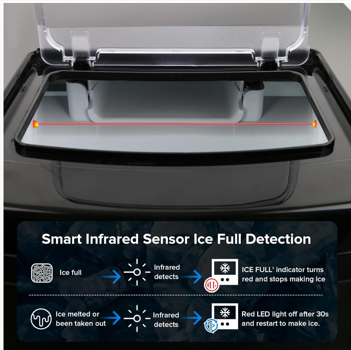
Figure 5.4: Illustration of the infrared sensor's ice full detection and auto-restart function.