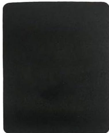
No.3 Mouse Pad

Image: Included accessories, featuring a USB extension cord, an HDMI cable, and a mouse pad.