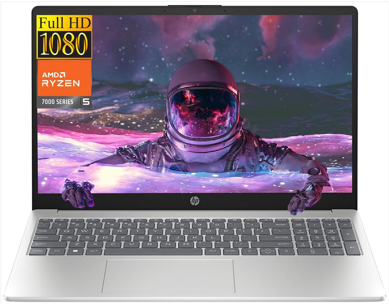
Image: The HP 15 Laptop, featuring a 15.6-inch Full HD display, AMD Ryzen 5 processor, and a full-size keyboard with numeric keypad.