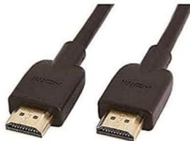
No.2 HDMI cable