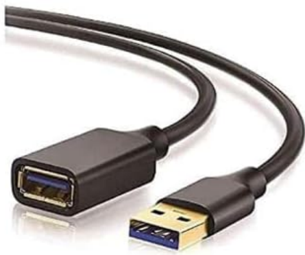
No.1 USB extension cord