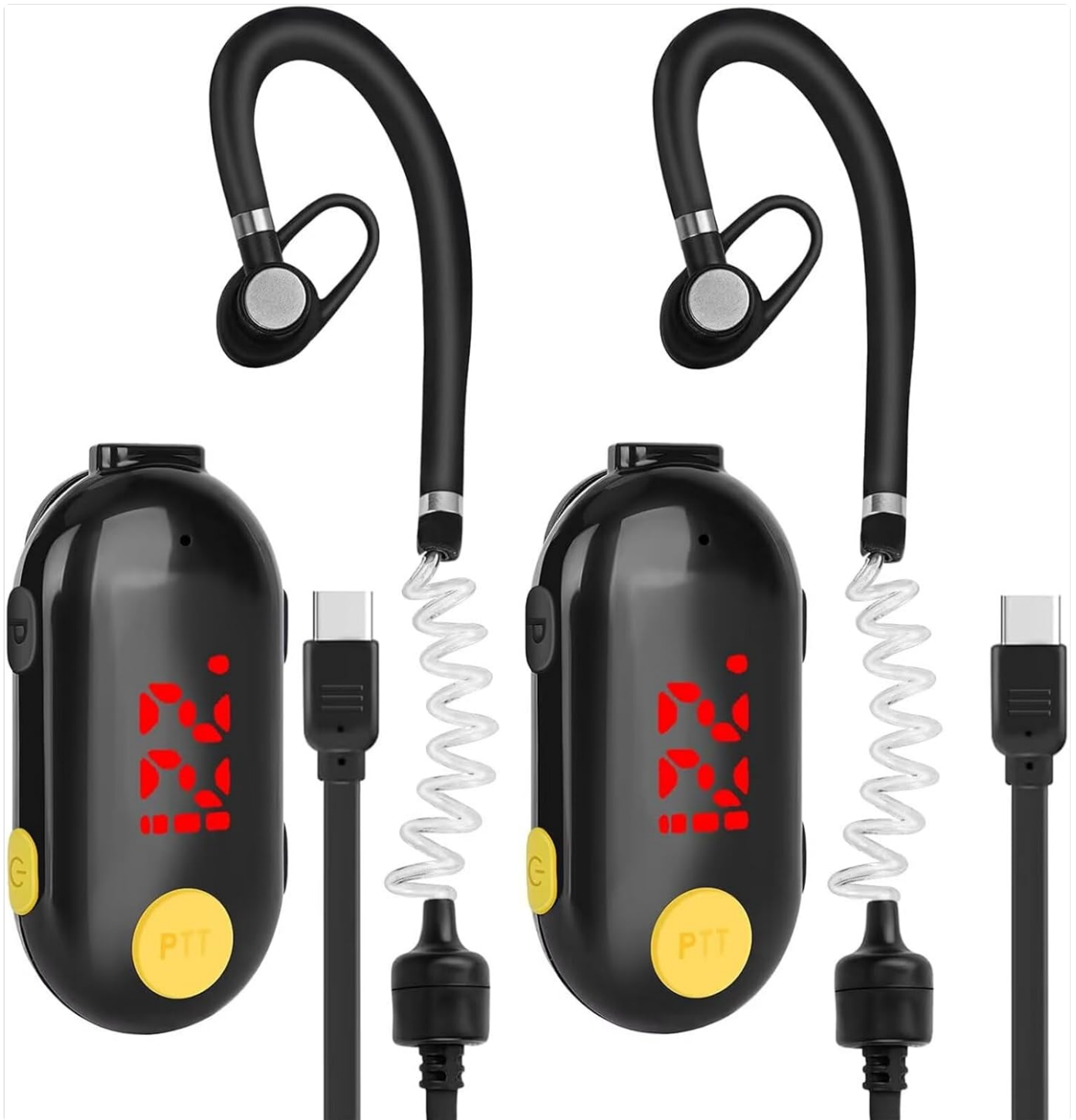
Image 1: ELIDAIP T-M9 Super Mini Walkie Talkies with earpieces and charging cables.