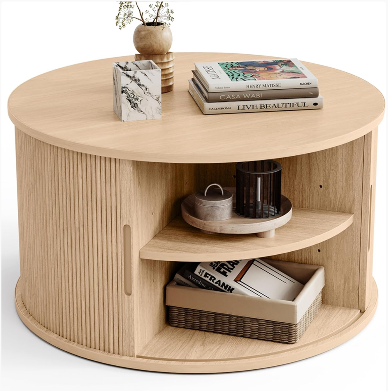
Image: The LINSY HOME Round Drum Coffee Table, showcasing its oak finish and the unique sliding tambour door design.