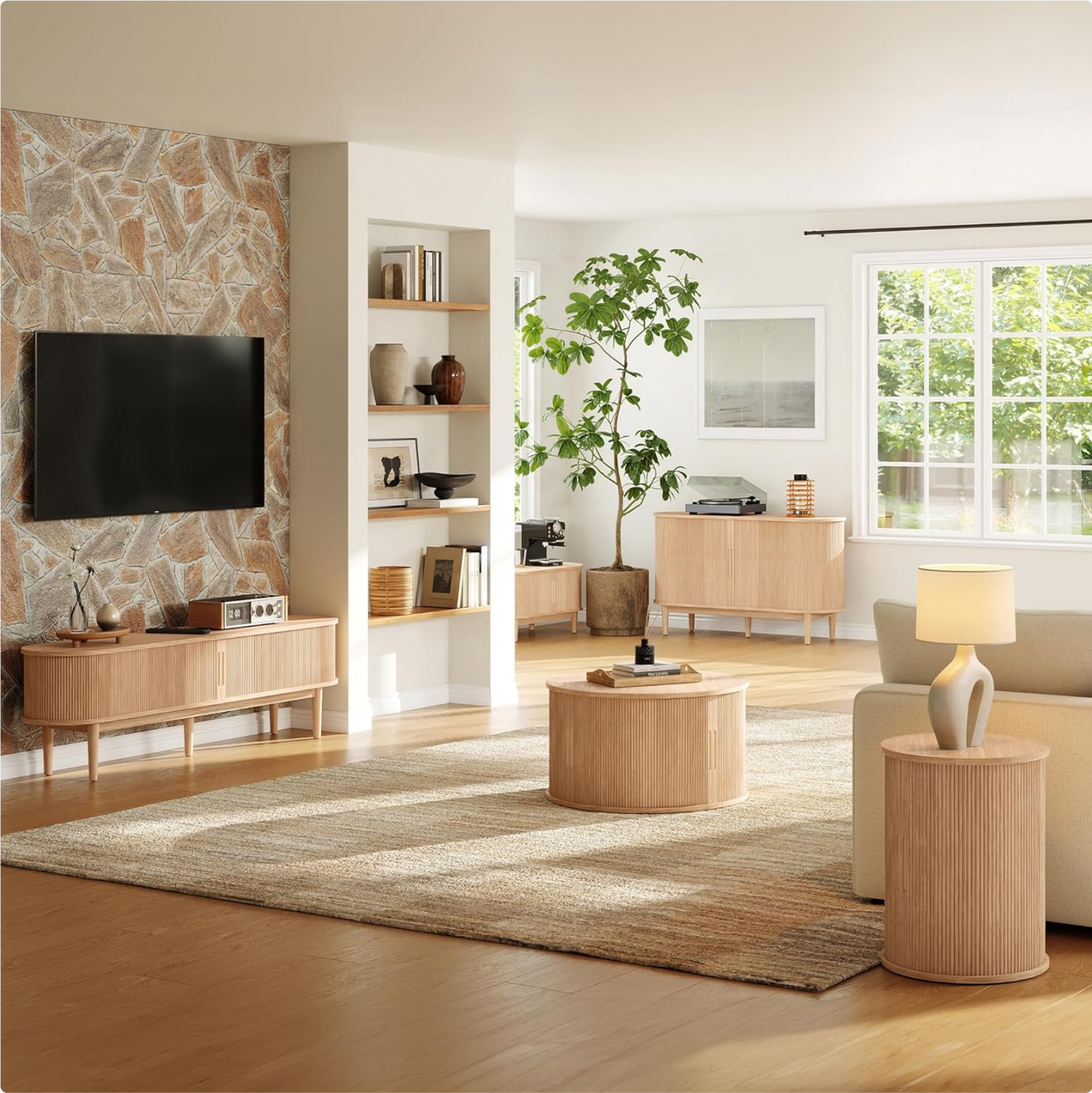
Image: A visual guide demonstrating potential color variations of the coffee table when viewed under different lighting environments.

LED, IPS, PLS), and other environmental factors during photography. The images provided are for reference, and the actual product color may differ.