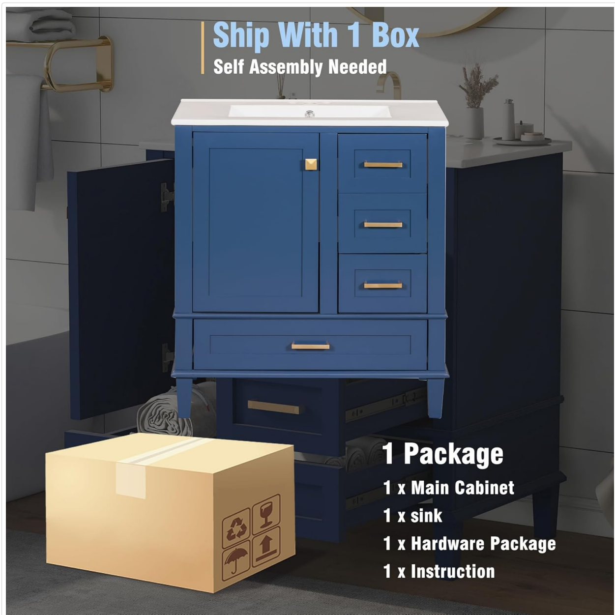
Figure 1: Illustration of the vanity package contents, including the main cabinet, sink, hardware, and manual.