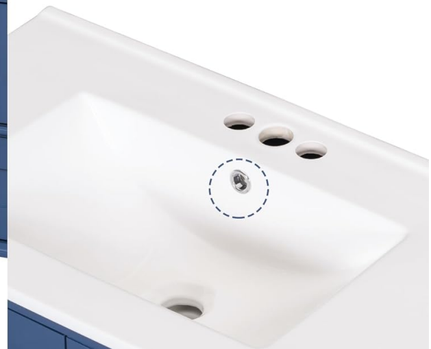
Figure 5: Close-up of the ceramic basin, highlighting its durable and easy-to-clean surface, 4-inch pre-drilled faucet holes, and anti-spill overflow hole.