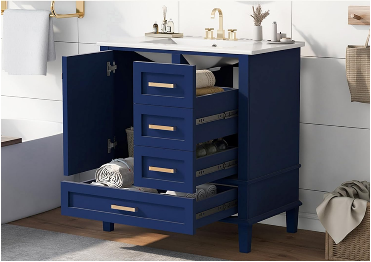
Figure 4: Illustration of the vanity's storage capabilities, showing the cabinet and three drawers used for organizing items like hair dryers, curling irons, shampoos, lotions, towels, and baskets.