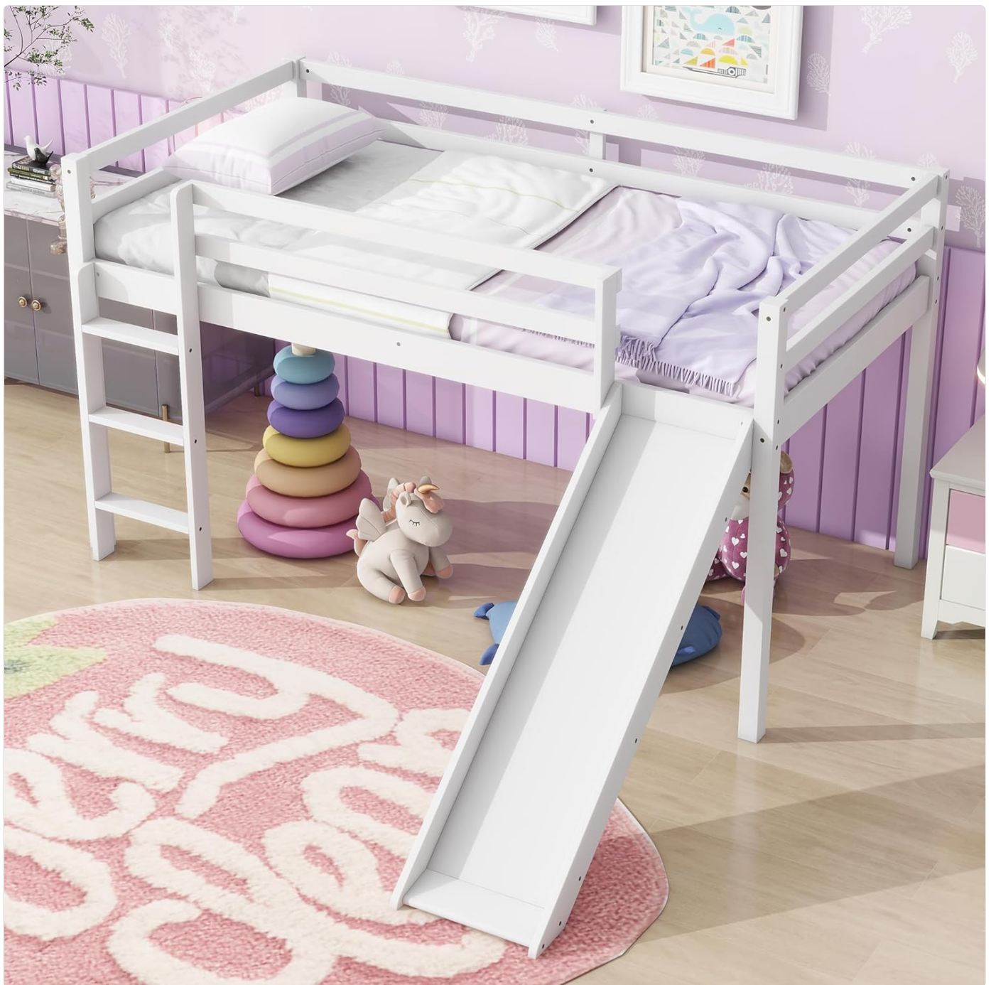
Figure 1: The Bellemave Twin Loft Bed with Slide and Ladder, shown in a child's bedroom setting.