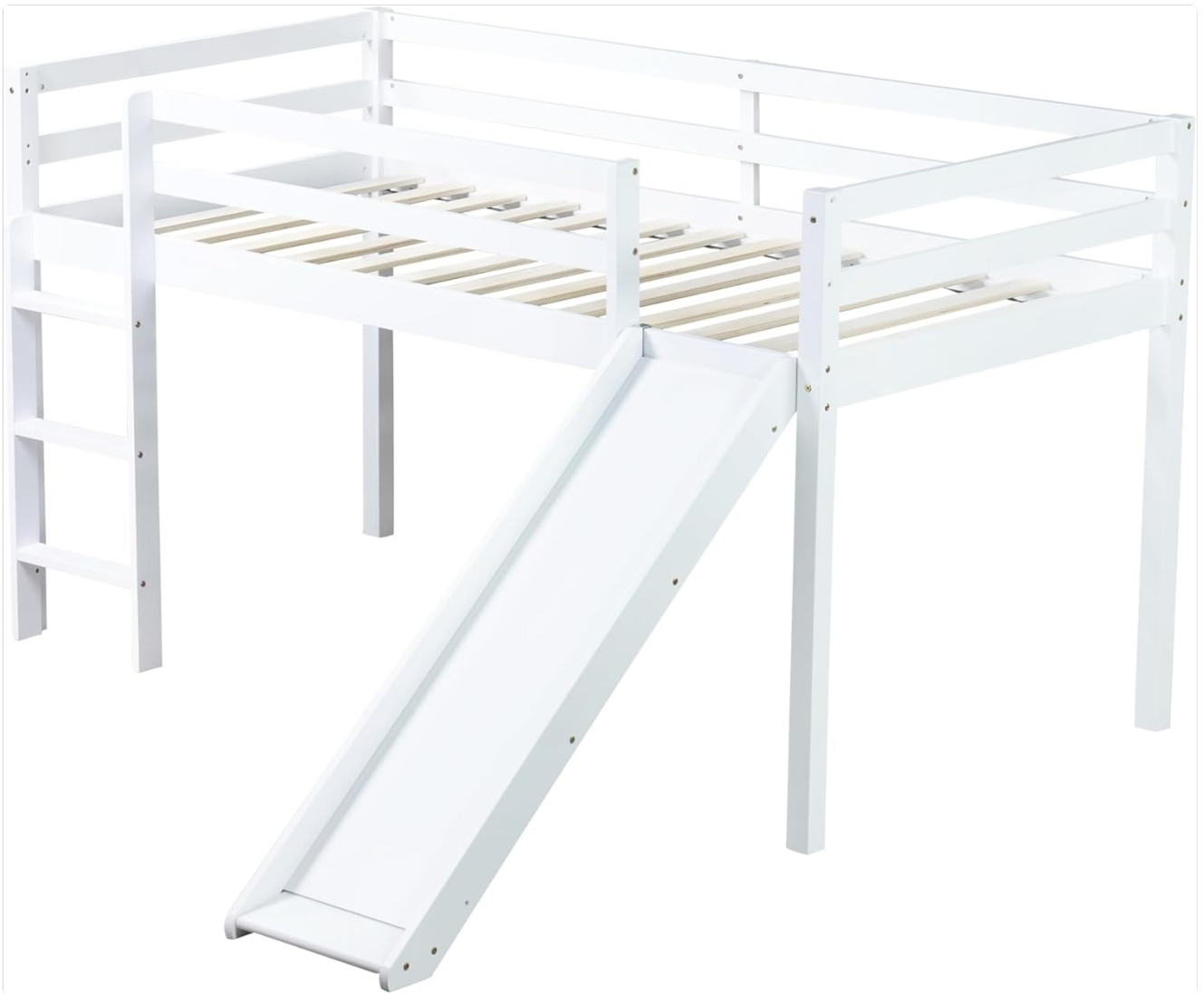
Figure 4: Detail of the sturdy ladder construction.