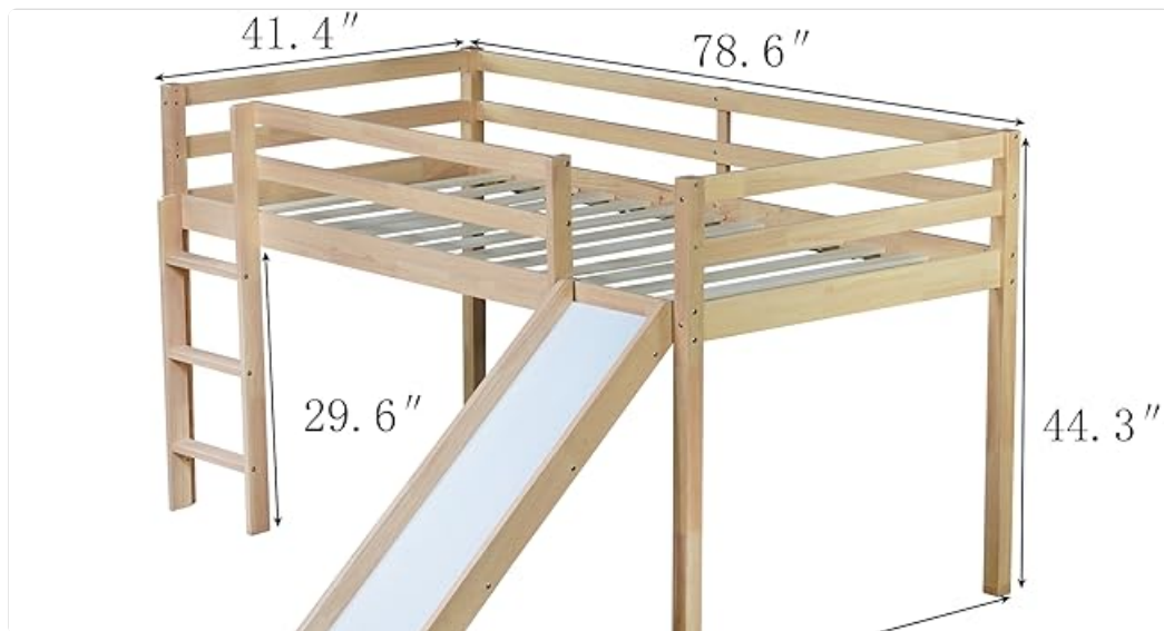
Figure 3: Illustrates the connection points for the bed frame components.

Attach the side rails to the headboard and footboard using the provided bolts and Allen wrench. Do not fully tighten all bolts until the entire frame is assembled to allow for minor adjustments.