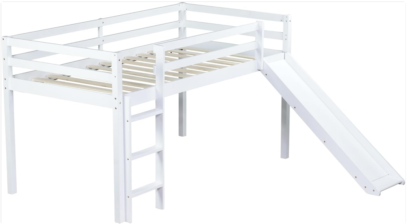
Figure 2: Overview of bed components before assembly.