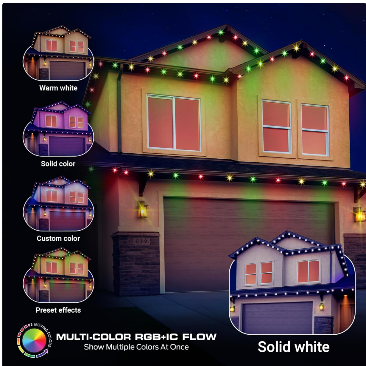
Image: A house illuminated with various multi-color RGB+IC flowing light effects, showcasing the dynamic capabilities of the lights.