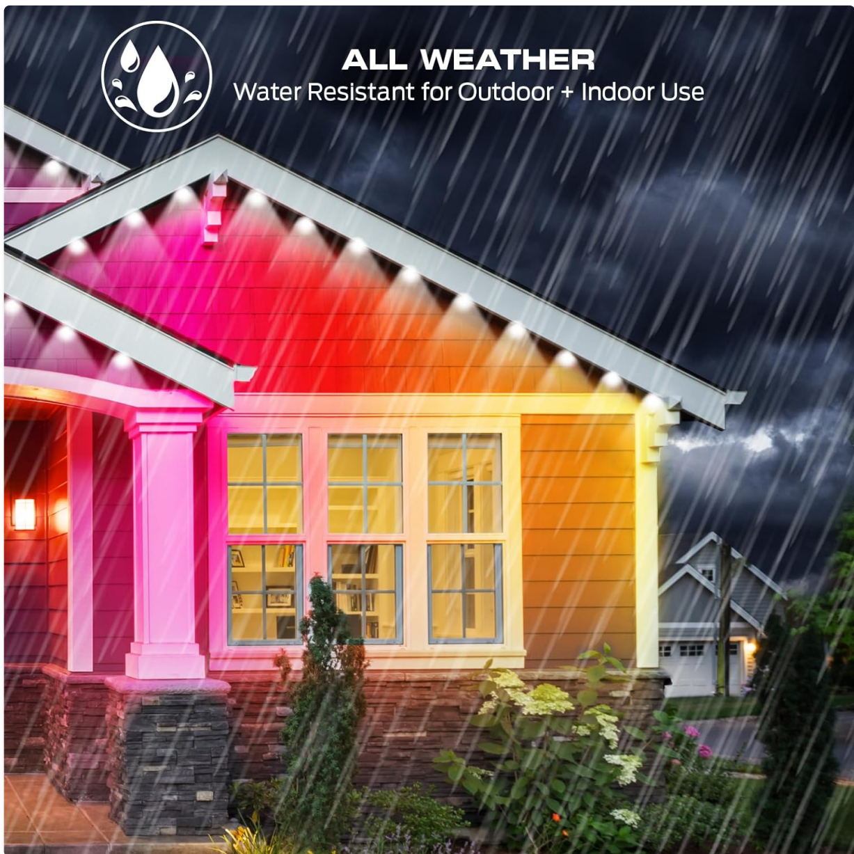
Image: Outdoor lights installed on a house during a rainy day, highlighting their weather-resistant design.