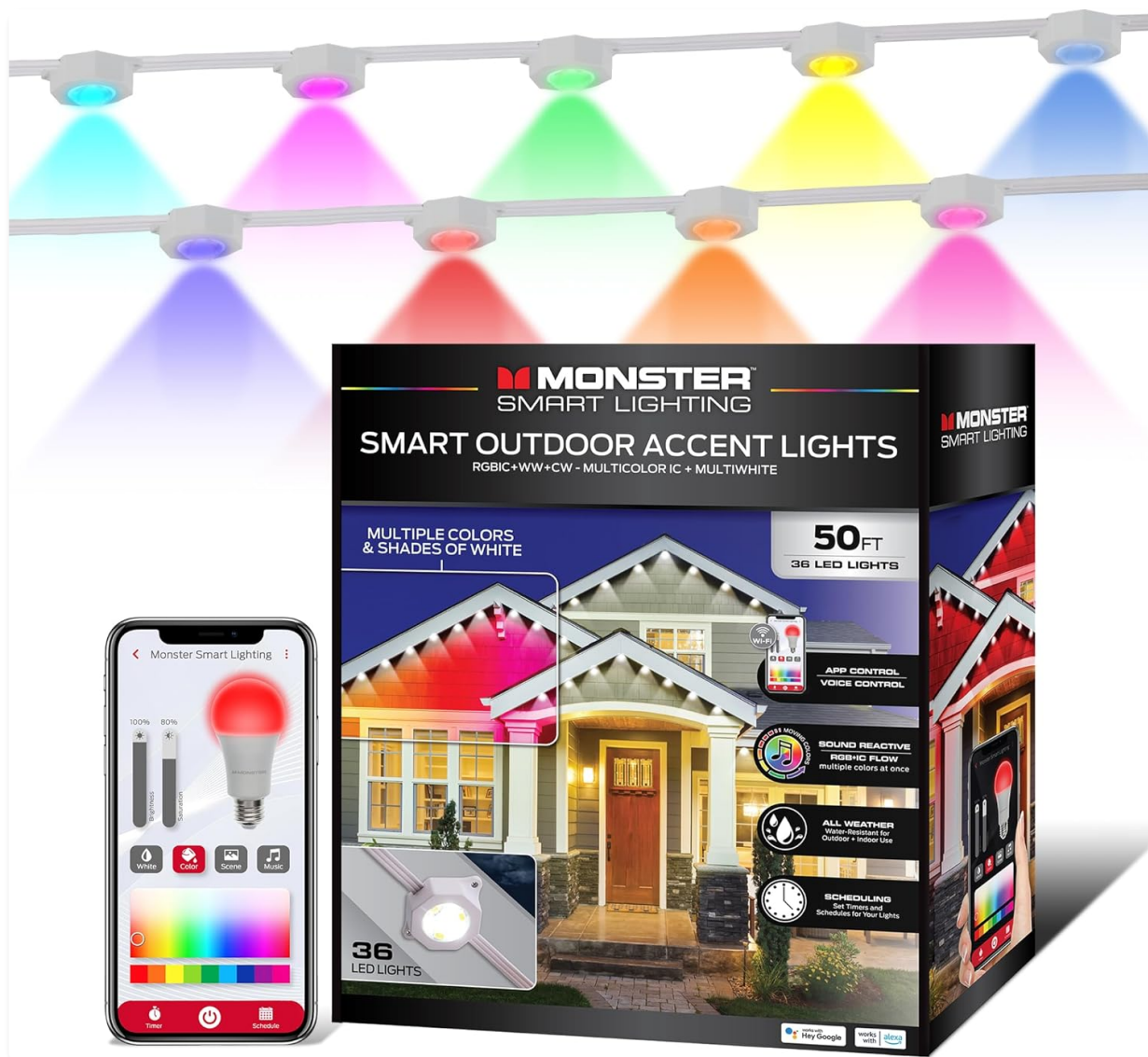
Image: Overview of the Monster Smart Permanent Outdoor Lights product and its packaging.