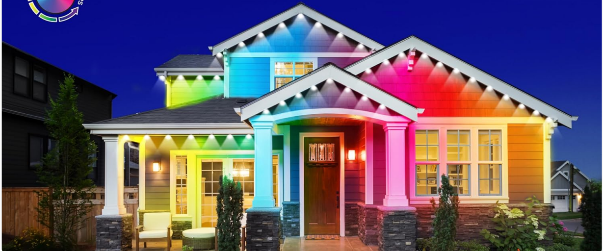
Image: The exterior of a house with sound-reactive lights, illustrating how the lights can flash and change in response to music or sound.