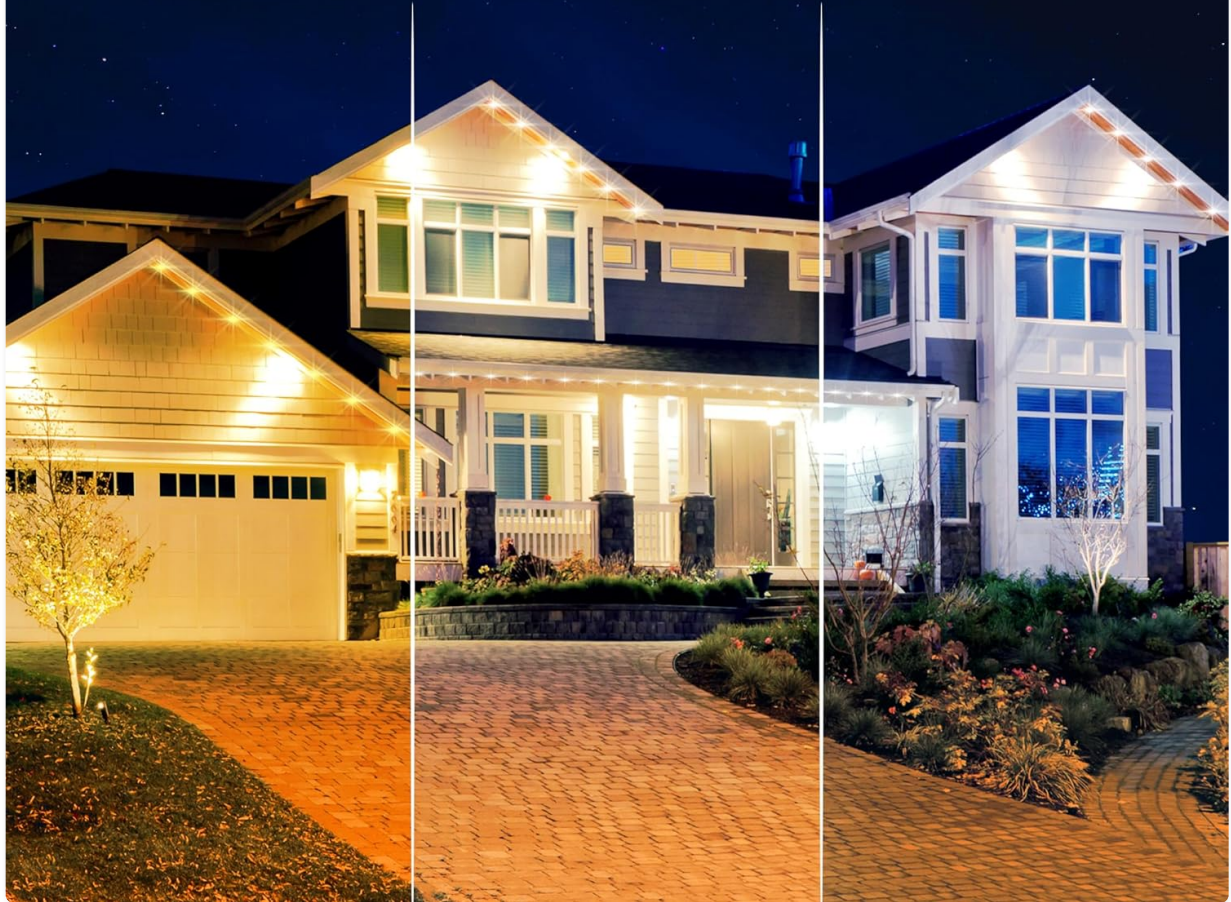
Image: A house illuminated with different shades of white light, demonstrating the multi-white light feature from warm to cool tones.