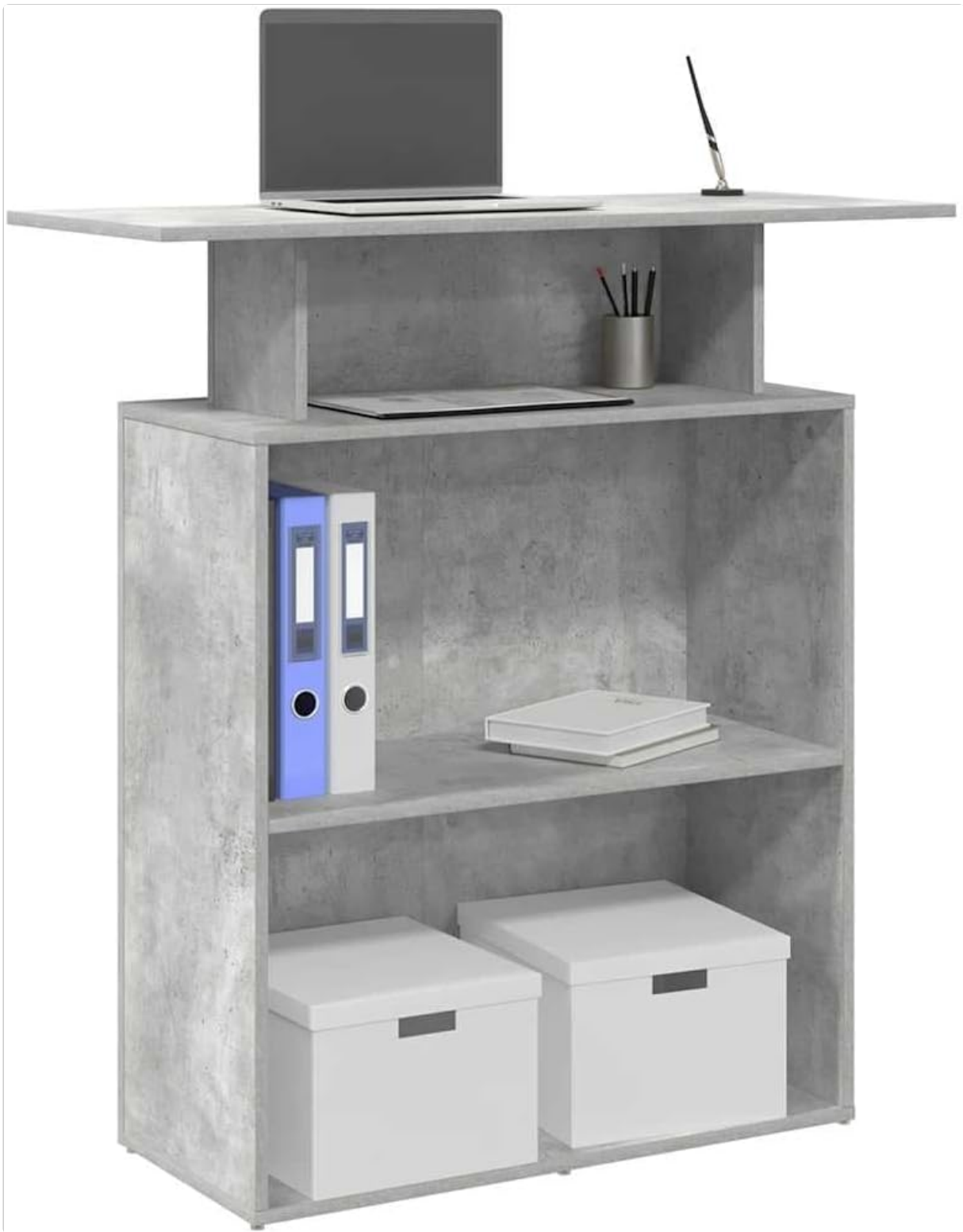
Image description: A front-facing view of the concrete gray reception desk. A laptop is placed on the top counter, and the internal shelves hold blue binders and white storage boxes, demonstrating the integrated storage solutions.