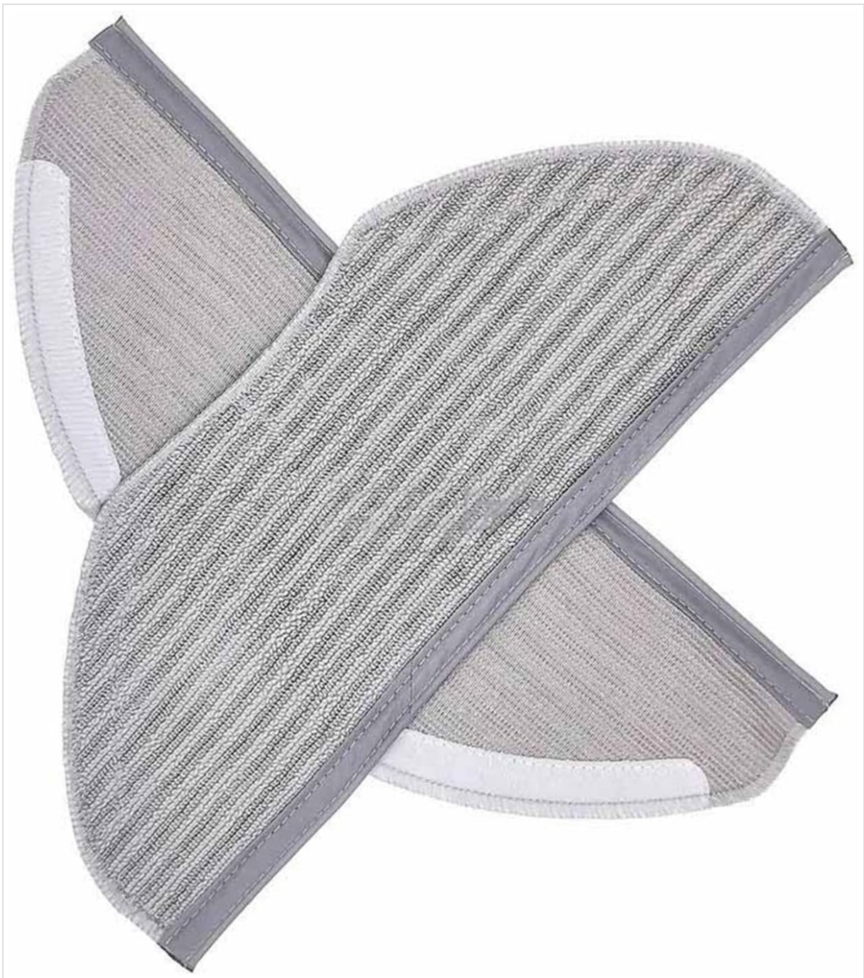
Image: Two grey striped mop pads, designed for wet cleaning, shown with their hook-and-loop fastening strips.