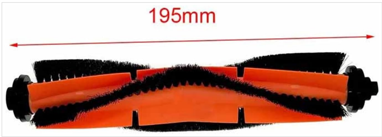
Image: A detailed view of the main roller brush, highlighting its 195mm length, ready for installation.