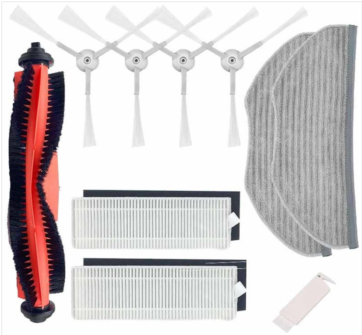
Image: Overview of the complete ROBAUN replacement kit, showing the main roller brush, side brushes, filters, mop pads, and a small cleaning tool.