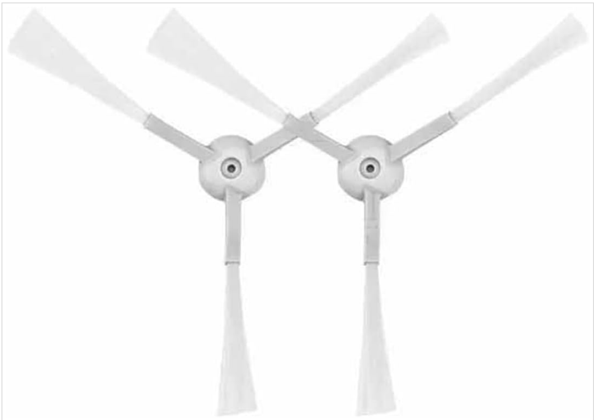
Image: A pair of white three-arm side brushes, designed to sweep debris into the vacuum's path.