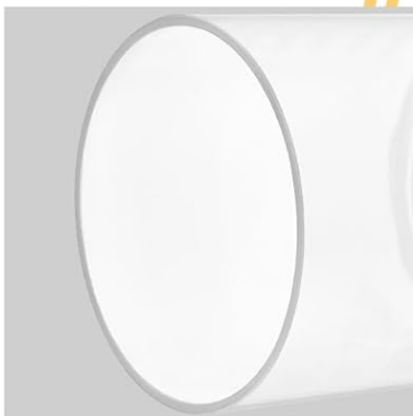
Clear Thick Glass