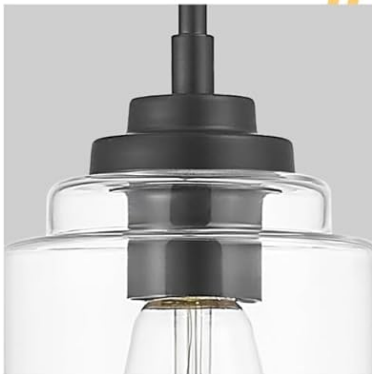
Black Metal Finish