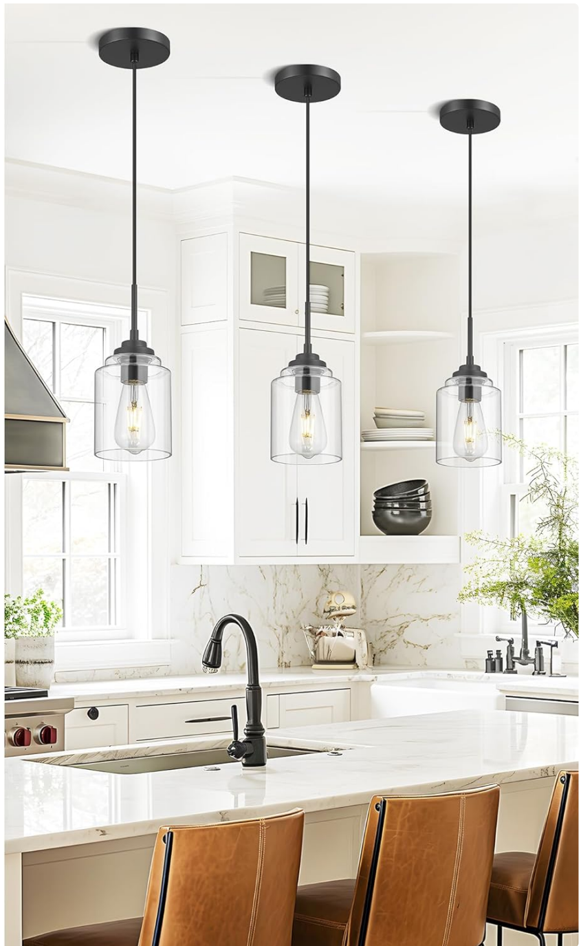
Image: The AUTELO H7010 BK 1-Light Industrial Pendant Light featuring a clear glass shade and black metal finish.