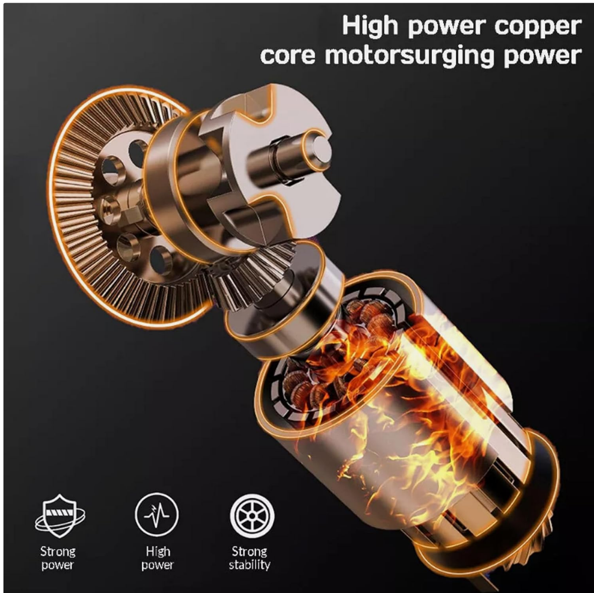
Figure 9.1: Illustration of the chainsaw's high-power copper core motor.