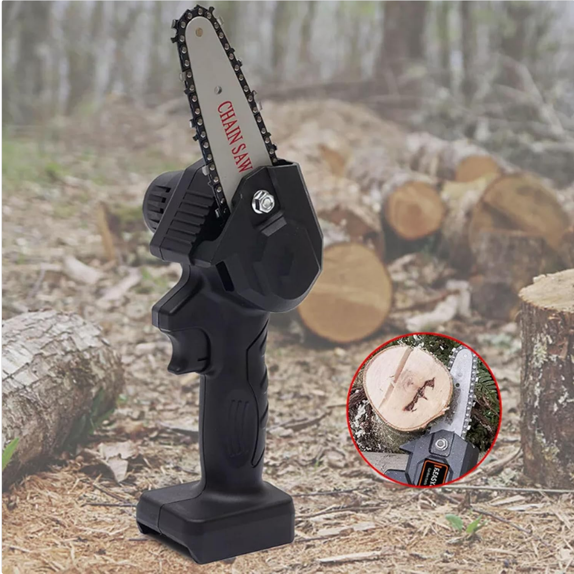
Figure 6.1: The mini chainsaw in operation, demonstrating its use for cutting branches.