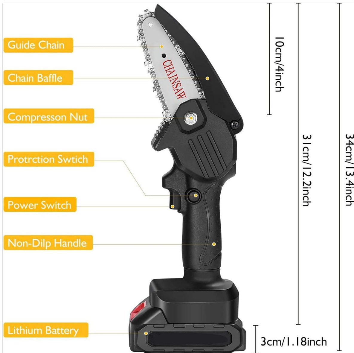
Figure 4.1: Labeled components of the Wood Ranger Mini Chainsaw.

Familiarize yourself with the different parts of your Wood Ranger Mini Chainsaw: