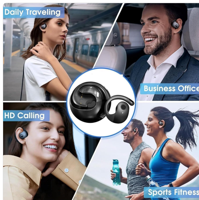
Image 3.4: Various usage scenarios for the Hy-T26 Pro earbuds, including daily commuting, office work, making HD calls, and during

The earbuds feature a built-in 16mm dynamic speaker, providing 360° high-fidelity stereo sound. Enjoy music playback and make/receive calls with clear audio. The earbuds support HD calling for enhanced voice clarity.