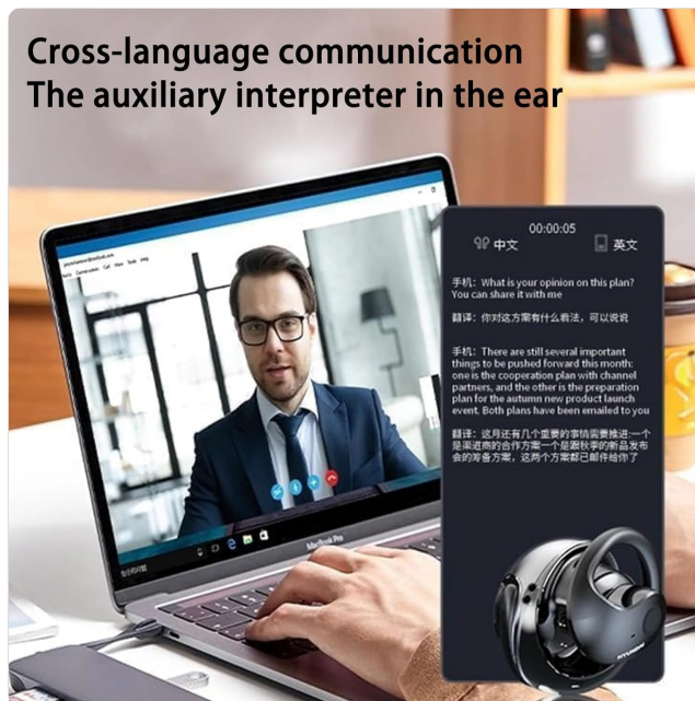
Image 3.2: A user engaging in cross-language communication, with the Hy-T26 Pro earbuds serving as an auxiliary interpreter during a video call on a laptop.