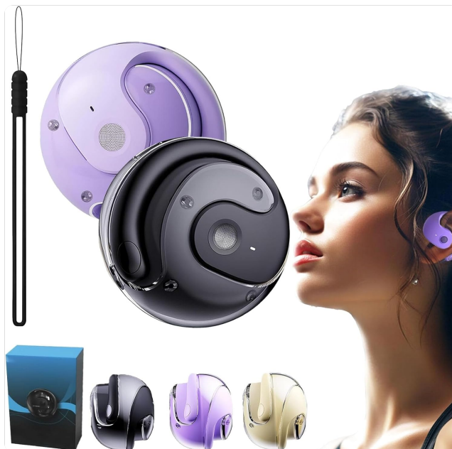
Image 1.1: The Hy-T26 Pro Wireless Bluetooth Translation Earbuds, showcasing the earbuds and their compact charging case.

The GDSAFS Hy-T26 Pro Wireless Bluetooth Translation Earbuds are designed to facilitate seamless communication across language barriers. These advanced earbuds offer real-time translation in up to 75 languages, combined with high-fidelity audio for music and calls. Featuring intelligent noise reduction and AI smart functions, the Hy-T26 Pro provides a versatile and portable solution for daily use, travel, business, and more.