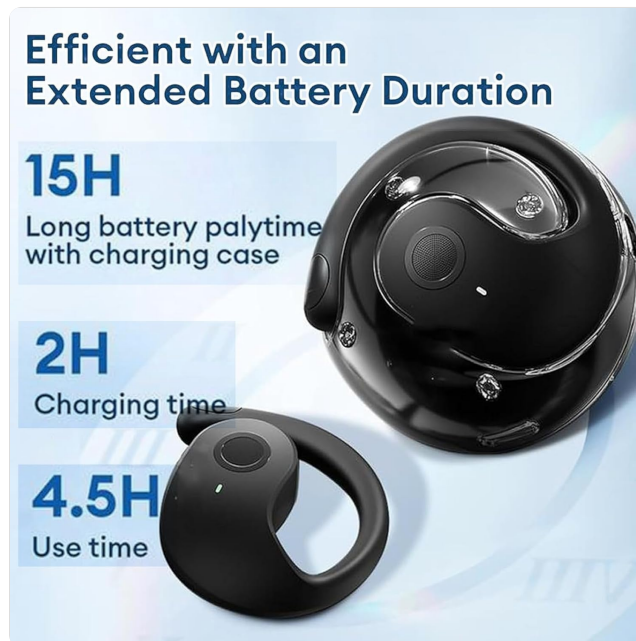
Image 2.1: Visual representation of the Hy-T26 Pro's battery life, indicating 15 hours with the charging case, 2 hours charging time, and 4.5 hours of earbud use time.

Before first use, fully charge the earbuds and the charging case. Connect the provided Type-C charging cable to the charging port on the case and plug the other end into a compatible USB power source. The charging compartment has a capacity of 300mAh. Indicators on the case will show charging status. A full charge provides approximately 15 hours of playtime with the charging case, 2 hours charging time, and 4.5 hours of use time for the earbuds.