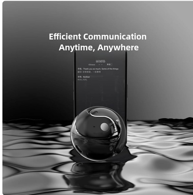
Image 3.1: The Hy-T26 Pro earbuds facilitating efficient communication, showing a phone screen with translated text.