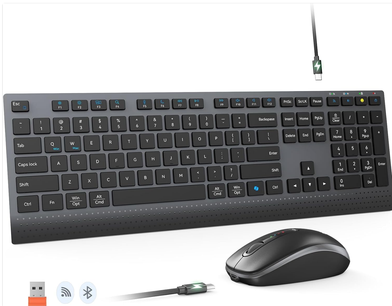
Image: The MEETION C2000 keyboard and mouse combo, showcasing its sleek design and included USB receiver and charging cable.

Thank you for choosing the MEETION C2000 Bluetooth Keyboard and Mouse Combo. This versatile set offers seamless connectivity and ergonomic design for enhanced productivity across various devices. This manual provides detailed instructions for setup, operation, and maintenance to ensure optimal performance.