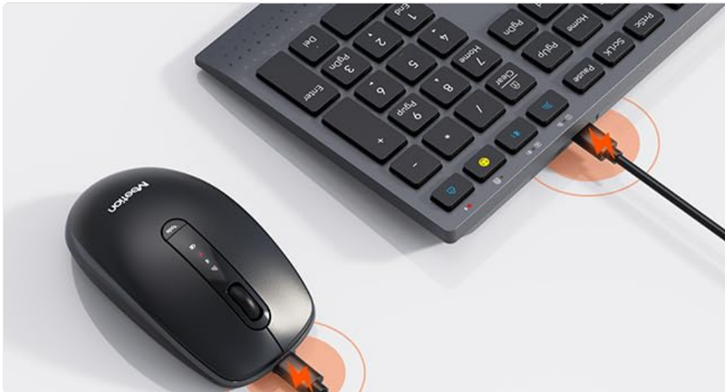
Image: A close-up of the keyboard's charging port and indicator light, showing the red light indicating charging status.