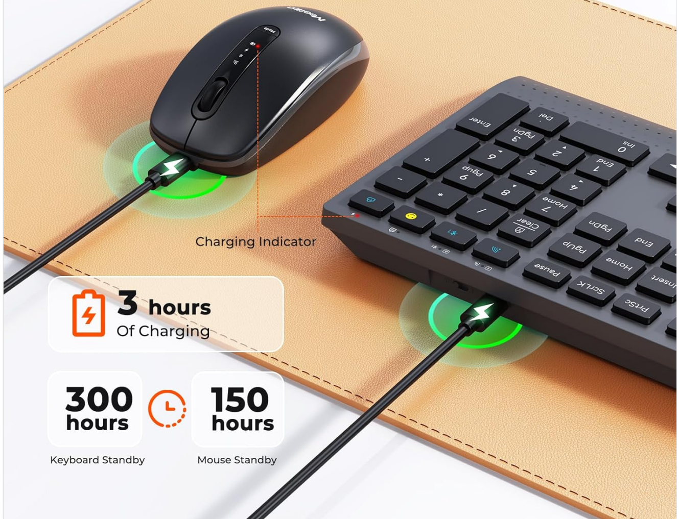
Image: The mouse connected to its USB-C charging cable, with visual indicators showing the charging status and estimated battery life.

You don't need to buy alkaline batteries again, which can save you a lot of money.