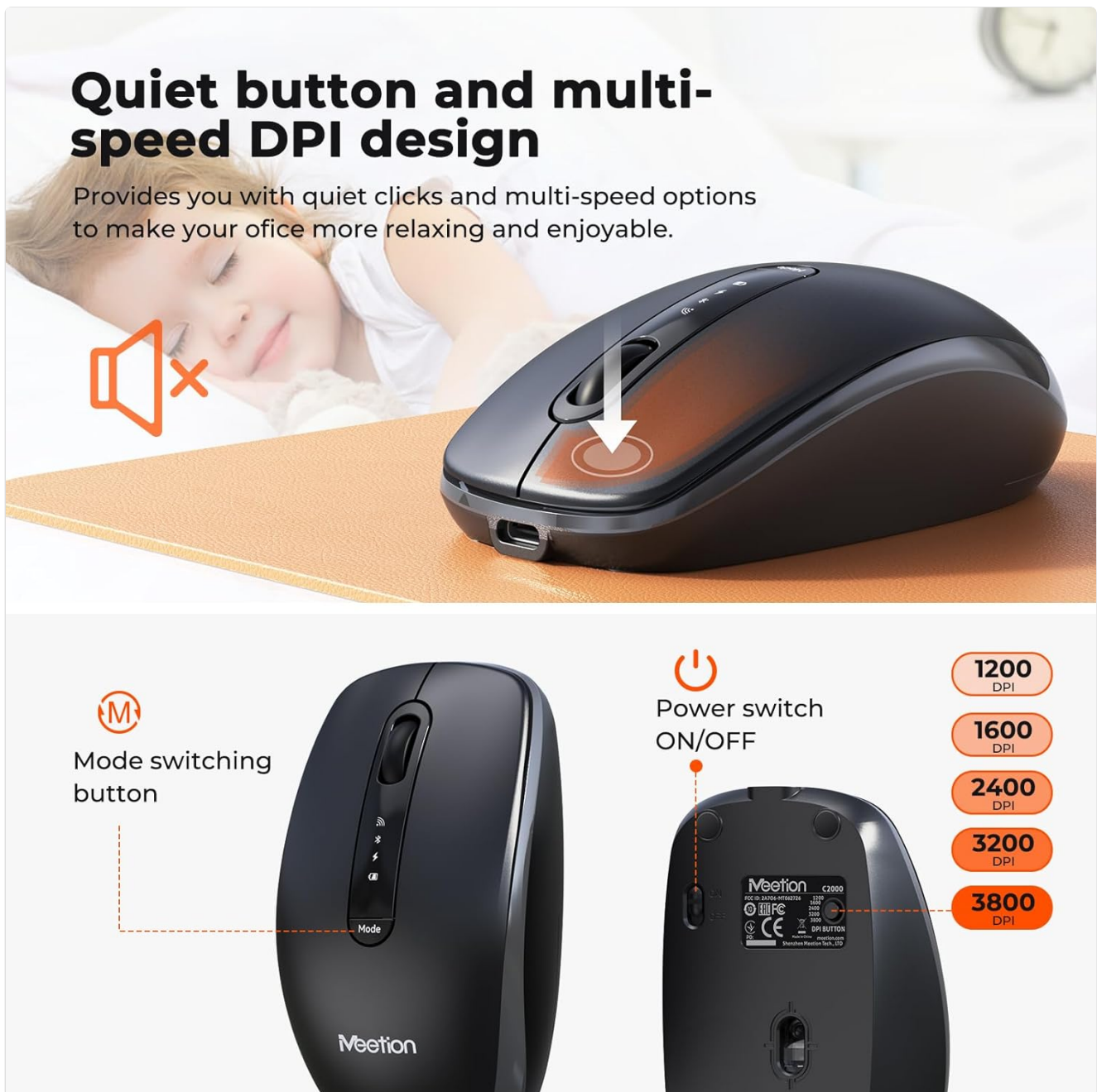
Image: The MEETION C2000 mouse highlighting its silent click feature and the DPI adjustment button, with a visual representation of the five available DPI settings.