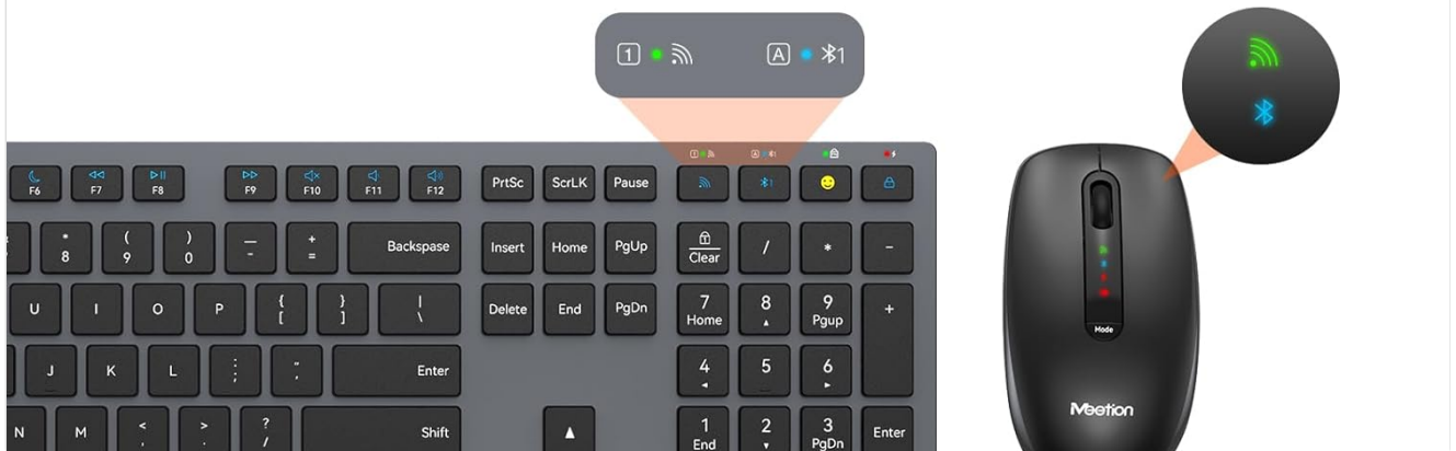
Image: A desktop setup illustrating the dual USB and Bluetooth connectivity options of the keyboard and mouse, allowing connection to multiple devices simultaneously.

Connect up to 2 devices at the same time to streamline your desktop space