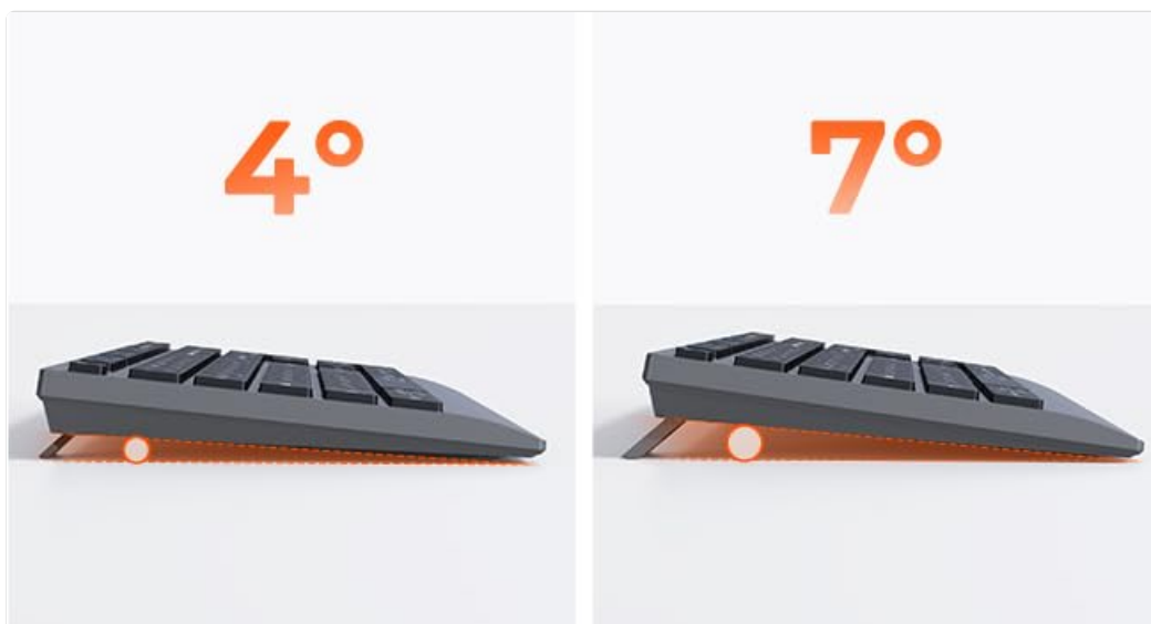
Image: Close-up view of the keyboard's dual kickstands, demonstrating the two adjustable tilt angles (4° and 7°) for ergonomic typing.