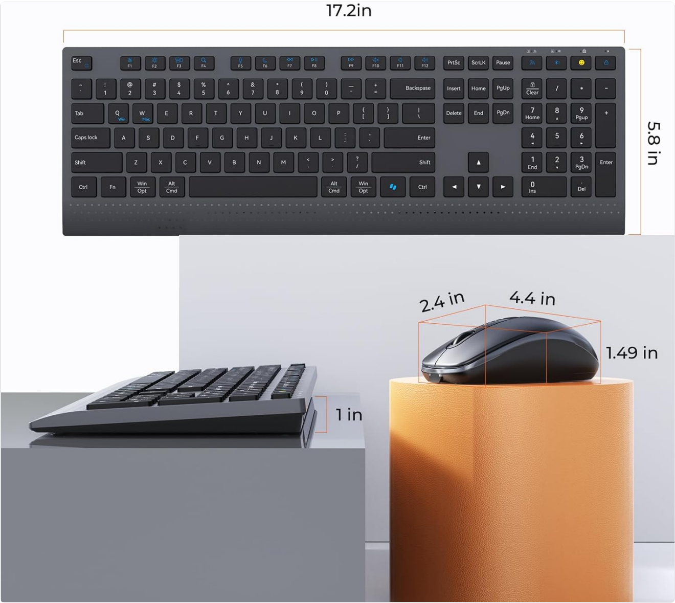
Image: Detailed dimensions of both the MEETION C2000 keyboard and mouse for reference.