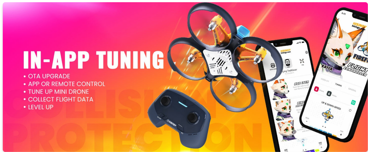
Image: A visual representation of the HISINGY Firefly FPV Drone Kit's package contents.