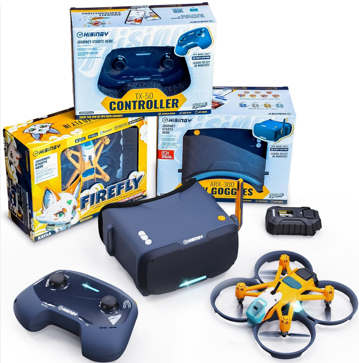
Image: HISINGY Firefly FPV Drone Kit components including drone, controller, and FPV goggles.