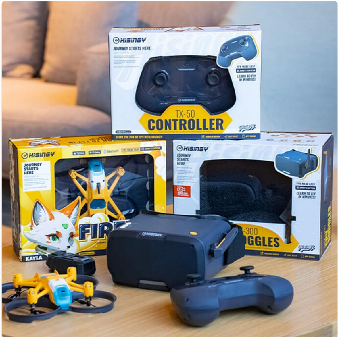
Image: A wide array of HISINGY DIY drone parts and accessories displayed on a table.