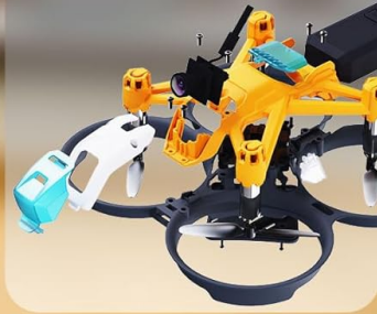
Image: HISINGY Firefly drone highlighting Altitude Hold, Automatic Emergency Stop, and Modular Design features.

Your browser does not support the video tag.