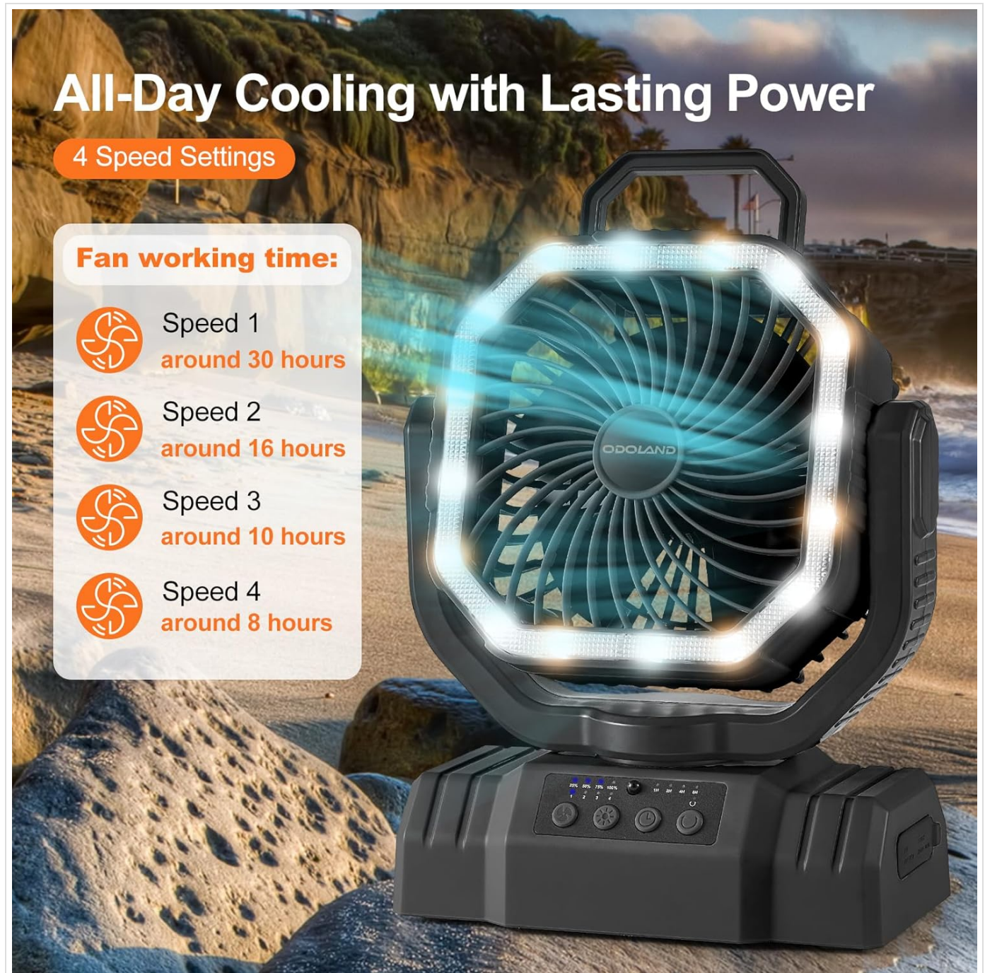
Image 6.1: The fan offers 4 speed settings, providing approximately 30 hours of operation at Speed 1, 16 hours at Speed 2, 10 hours at Speed 3, and 8 hours at Speed 4.

The fan has 4 speed settings. Press the fan speed button on the control panel or remote control repeatedly to cycle through speeds 1 (low) to 4 (high). The LED indicators will show the current speed.