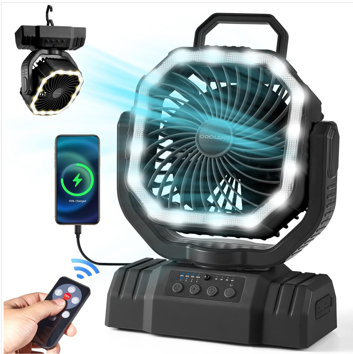
Image 1.1: The Odoland Portable Camping Fan with LED Lantern, showcasing its fan and light features, remote control, and charging capability for a mobile phone.