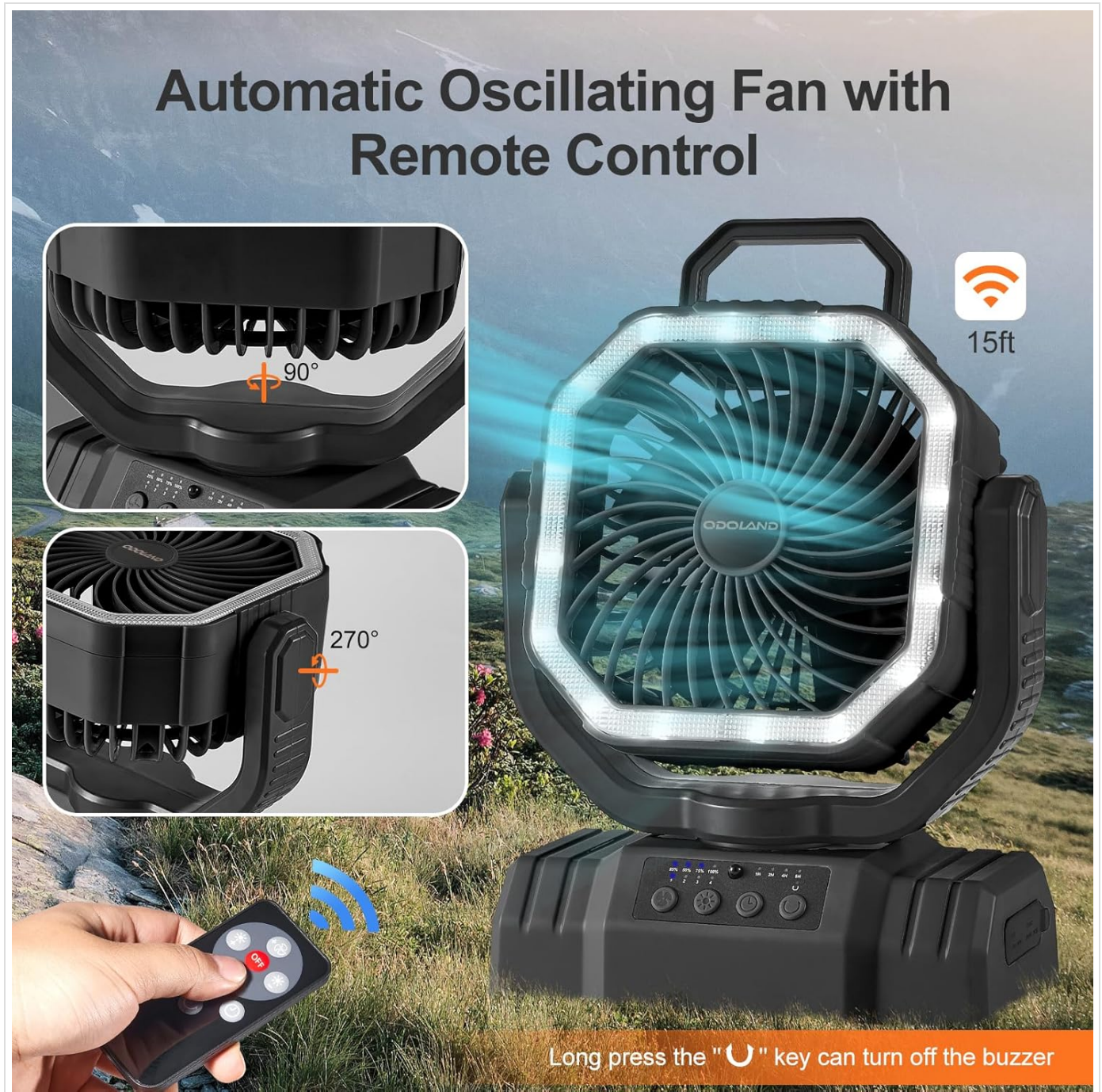
Image 4.1: The fan head can oscillate 90 degrees automatically and swivel 270 degrees manually, providing flexible airflow direction.