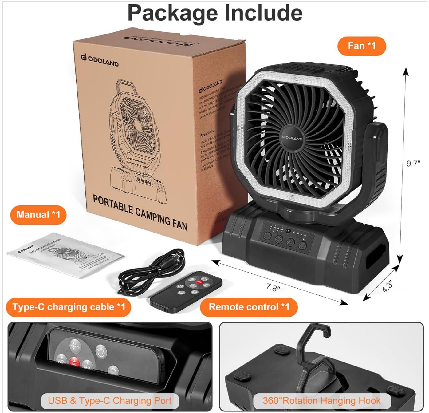
Image 3.1: Contents of the product package, including the fan, remote control, Type-C charging cable, and user manual.