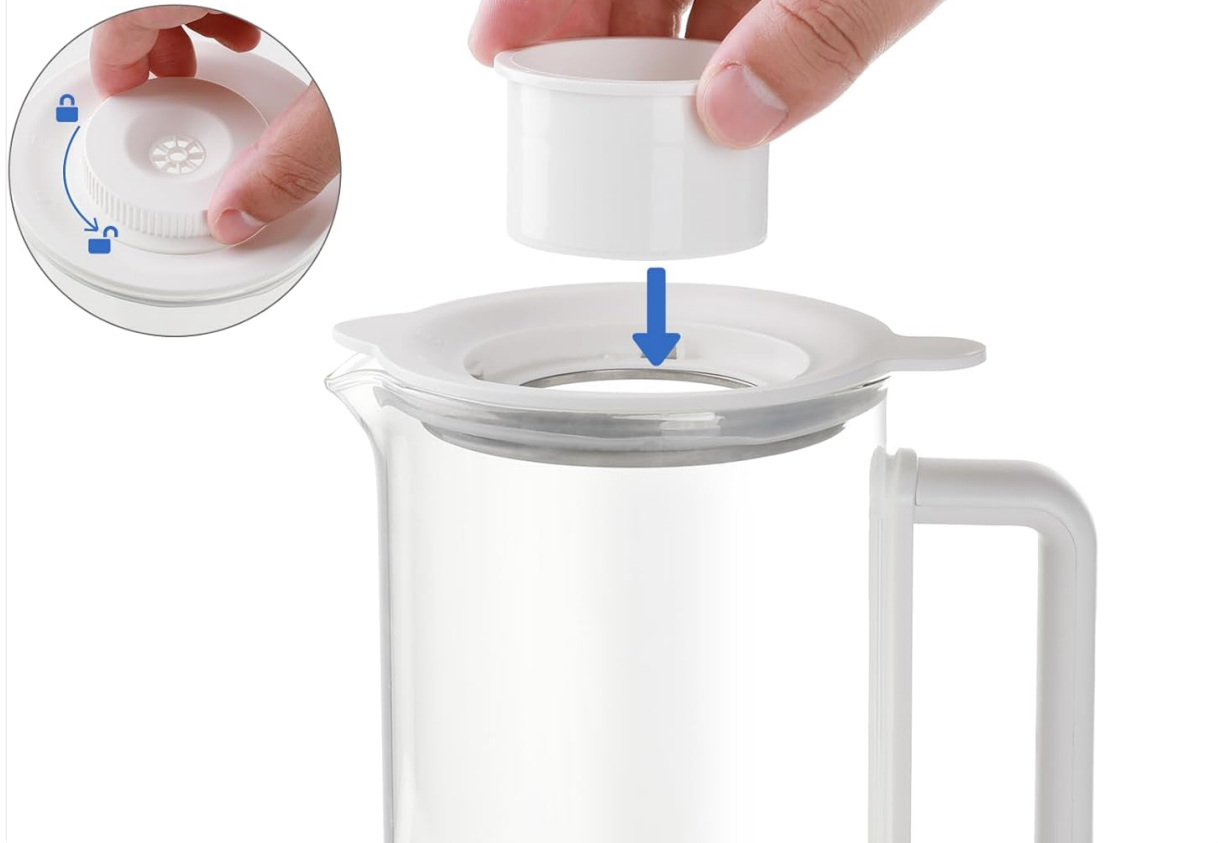
Image 2.1: The Slevoo K1 filter is designed for quick and easy replacement in compatible systems.