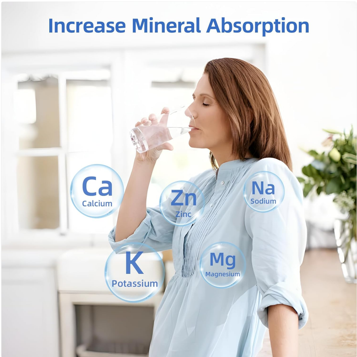
Image 1.2: The filter is designed to increase the mineral content in your drinking water, supporting better mineral absorption.