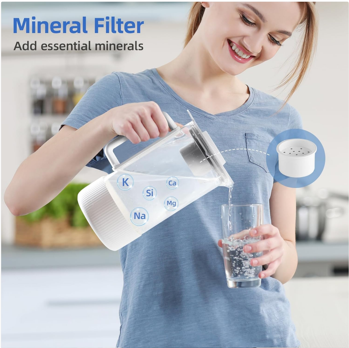
Image 1.1: The Slevoo K1 filter adds essential minerals like Potassium (K), Silicon (Si), Calcium (Ca), Magnesium (Mg), and Sodium (Na) to your filtered water.