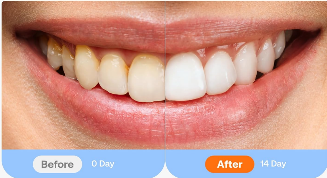
Image: Before and after comparison of teeth, demonstrating plaque removal efficacy, with the ADA Accepted seal.

Seal Statement: "The ADA Council on Scientific Affairs' acceptance is based on findings that Bitvae D2 is safe and effective for plaque removal and gingivitis prevention when used as directed."