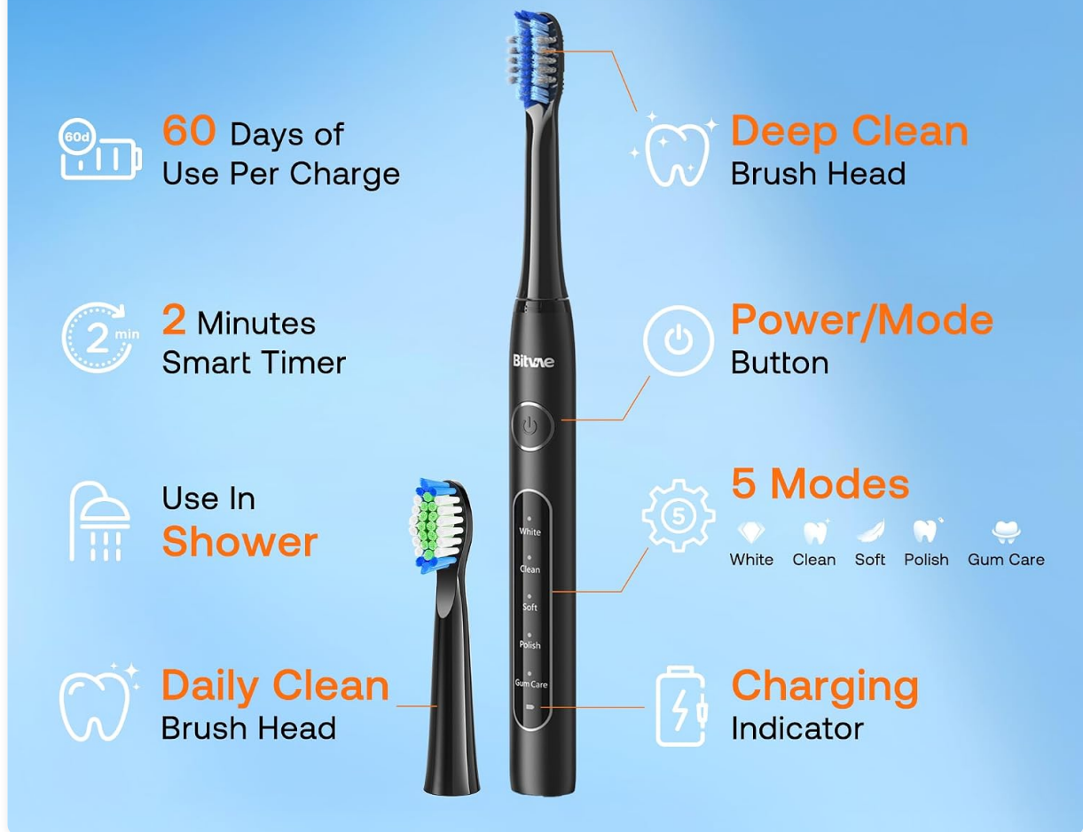
Image: Bitvae D2 Electric Toothbrush highlighting its 5 modes, 2-minute smart timer, 60-day battery, and shower-safe design.