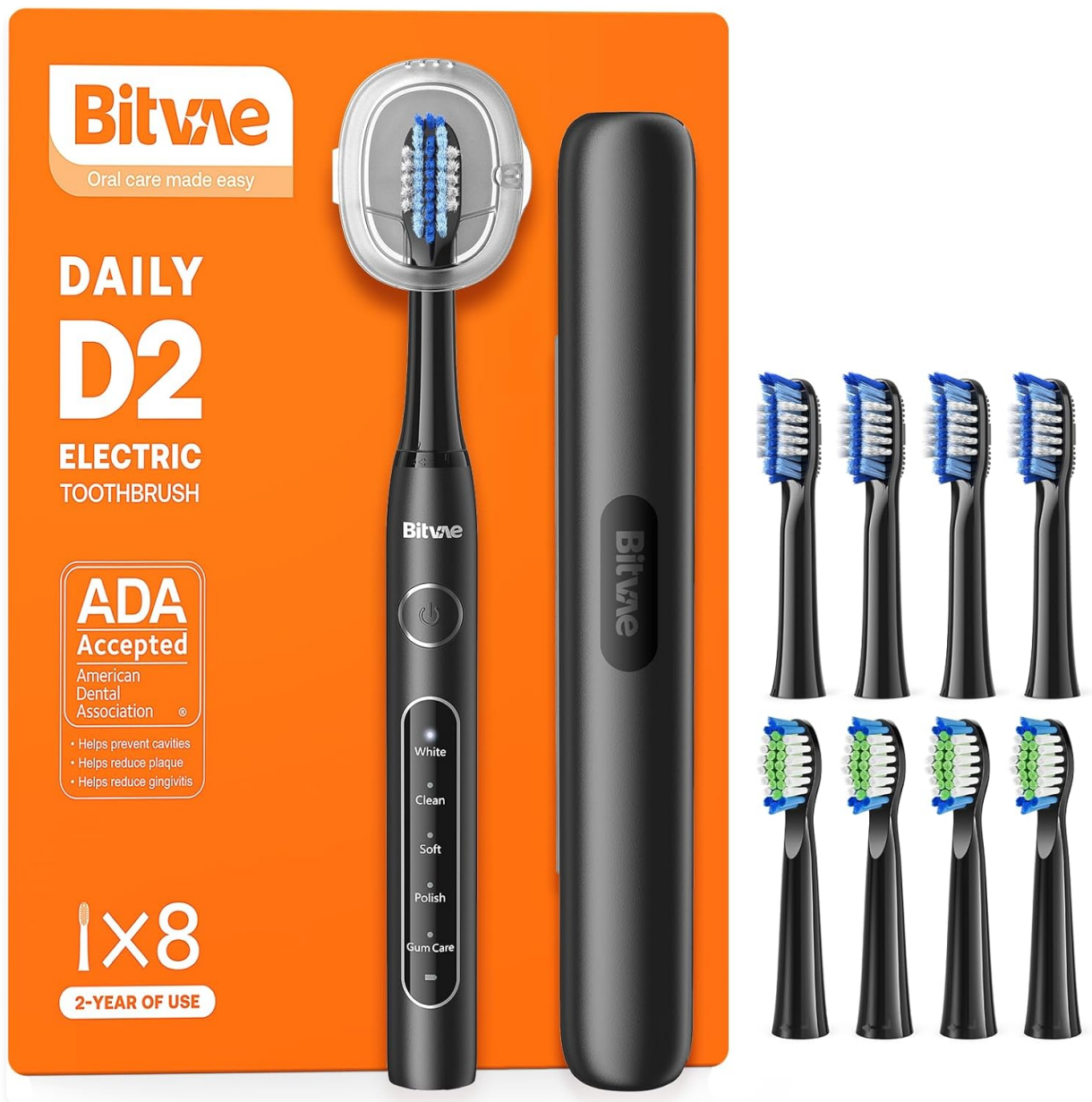
Image: Bitvae D2 Electric Toothbrush, travel case, and brush heads.